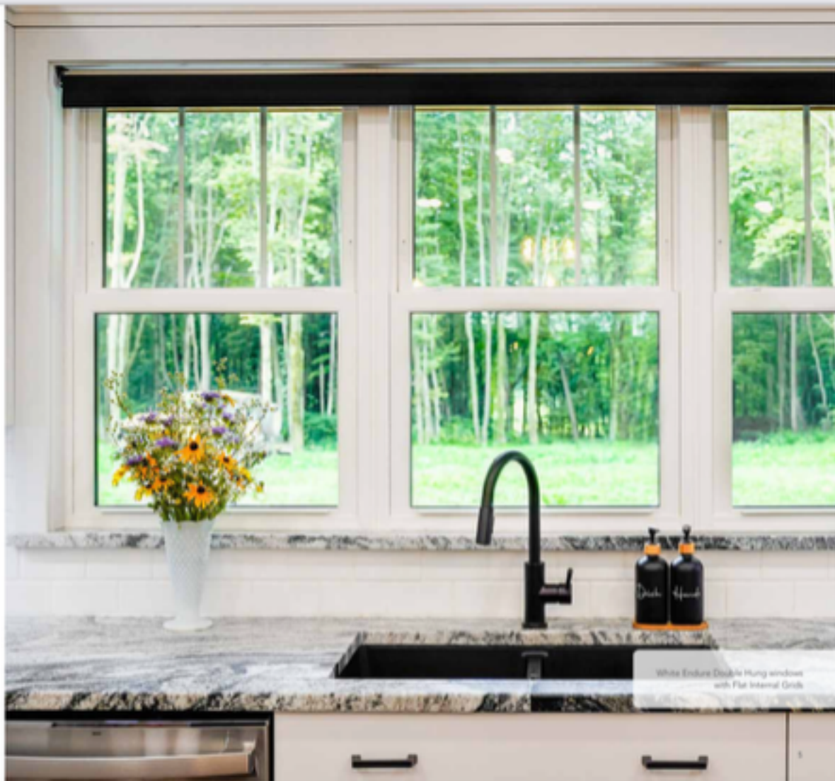
White Endure Double Hung windows with Flat Internal Grids

Industry partnerships and on-going research into new technologies ensure the vinyl compound exceeds industry standards, outperforms the competition, and works together to offer best-in-class technology.