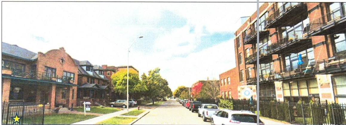
Streetscape view, looking west on W. Willis. Subject property is denoted by the metal fence at bottom left (★). There are two dominant wall materials for each building on this block: brick and stone.