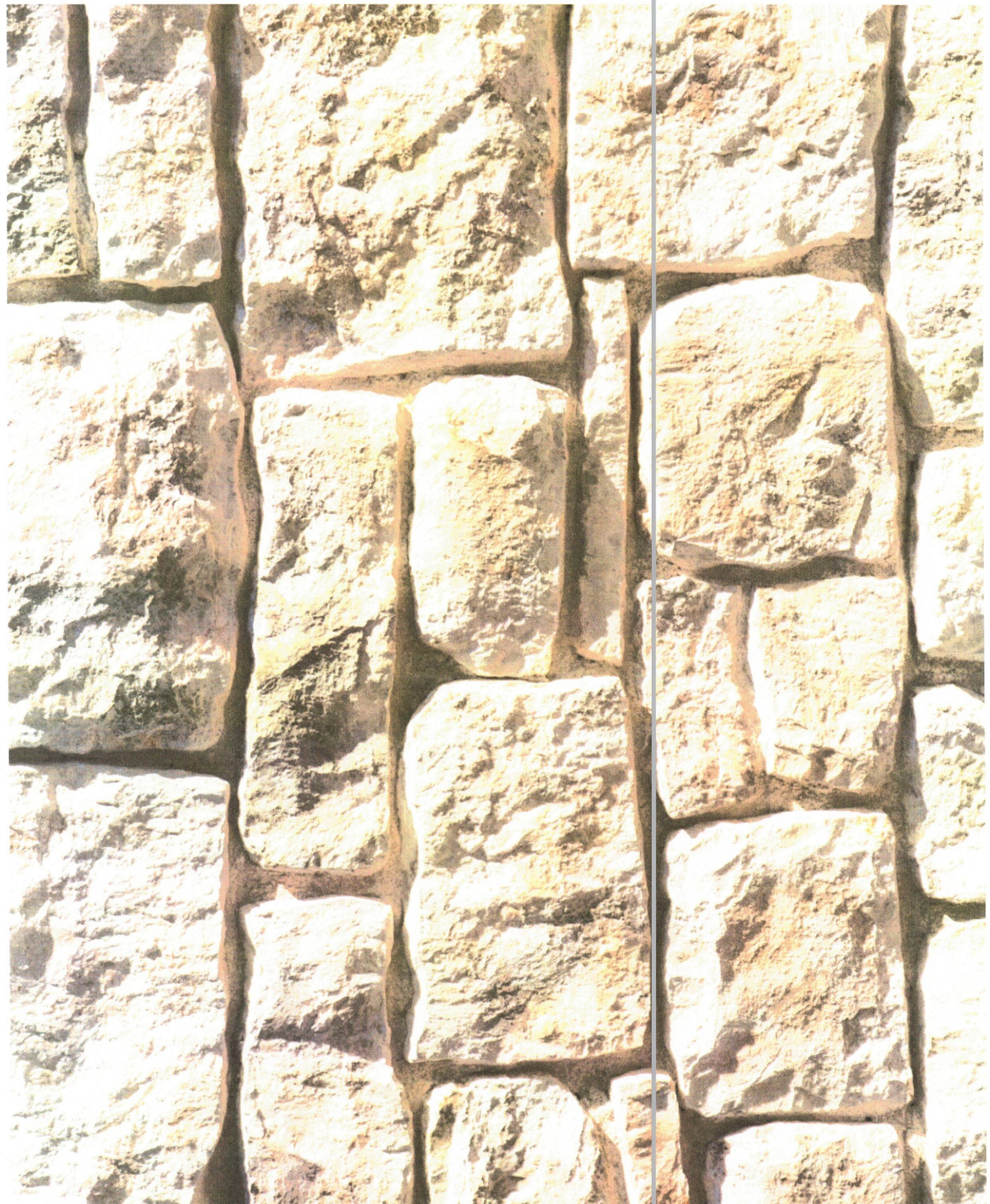
LOIRE VALLEY from EL DORADO Stone