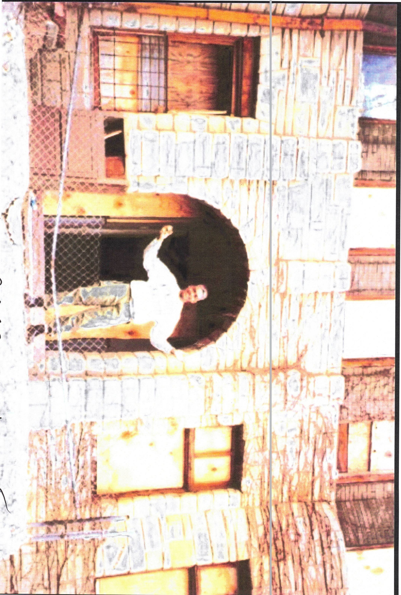
4120 GASS 500% STONE FACADE