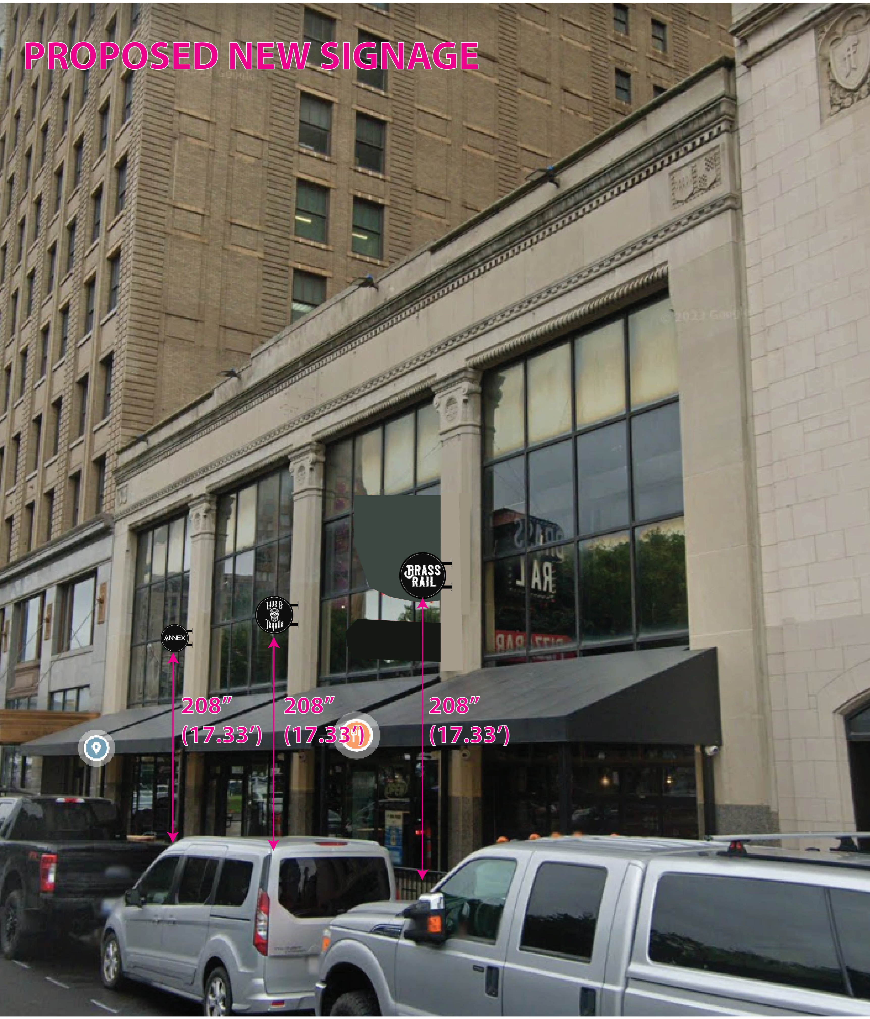
PROPOSED NEW SIGNAGE