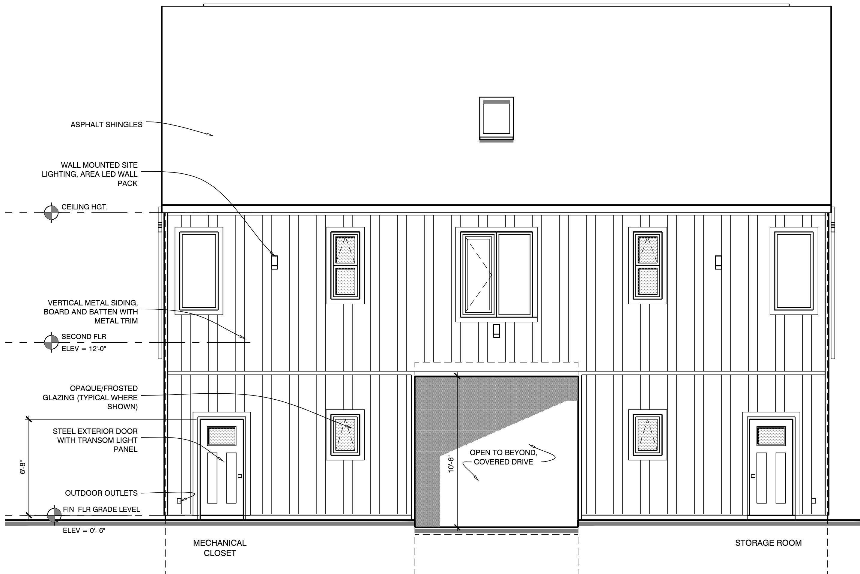
2 REAR ELEVATION - SOUTH SCALE: 1/4" = 1'-0" GATED PARKING LOT