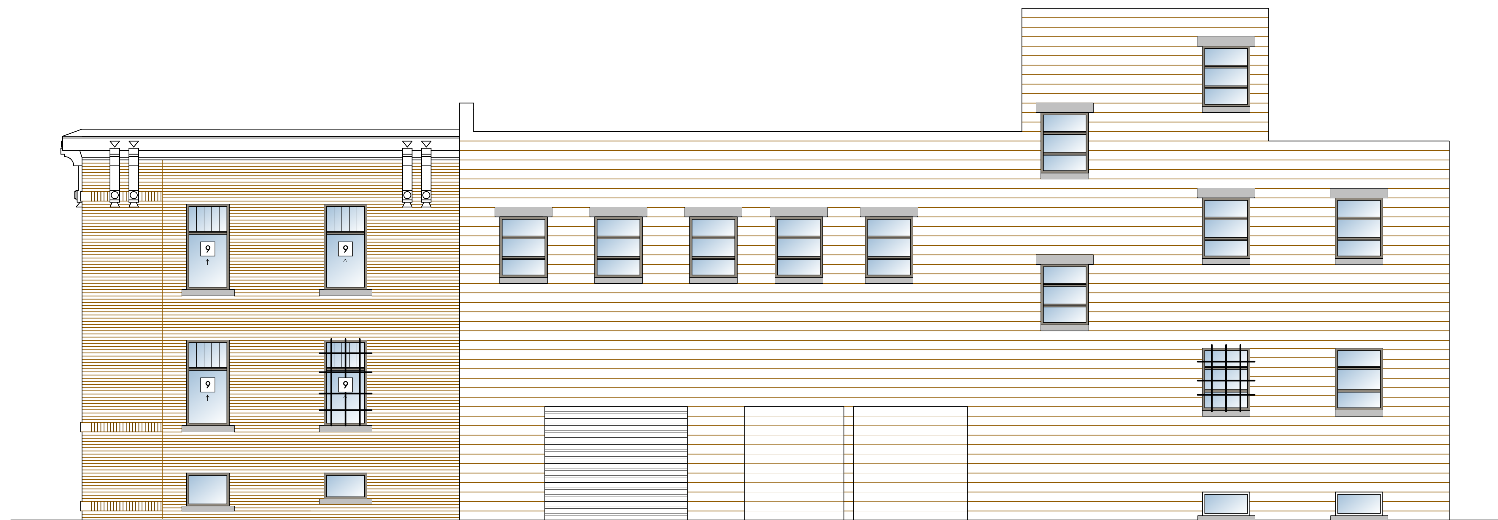
C EXISTING WEST ELEVATION