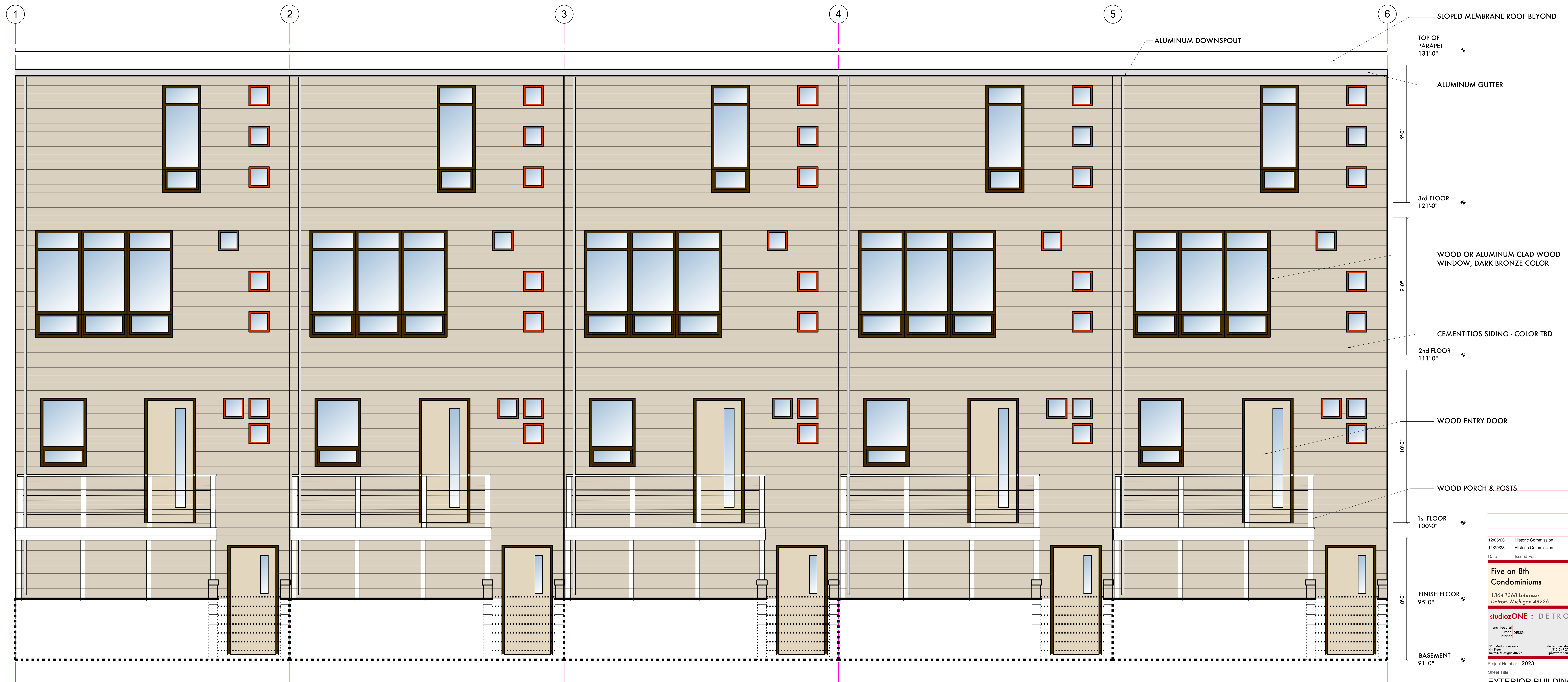
B EAST ELEVATION SCALE: 1/2" = 1'-0"