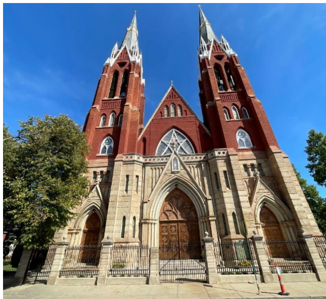
Front of Church (West)

4440 E Canfield Street, d/b/a 4440 Russell Street Detroit, Michigan 48207