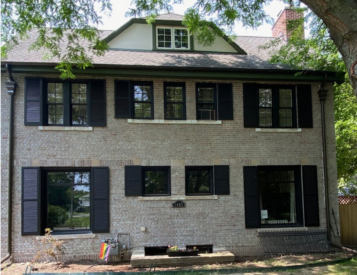
NE ELEVATION -First Floor(right to left) - 1.3 , 1.4 , 1.5 , 1.6 Second Floor - 2.3 , 2.4 , 2.5 , 2.6 , 2.7 , 2.8 , 2.9 Third Floor - 3.1