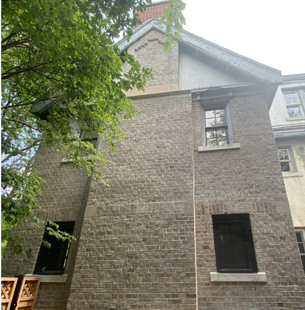
NW ELEVATION - First Floor - 1.1, 1.2 Second Floor - 2.1,2.2