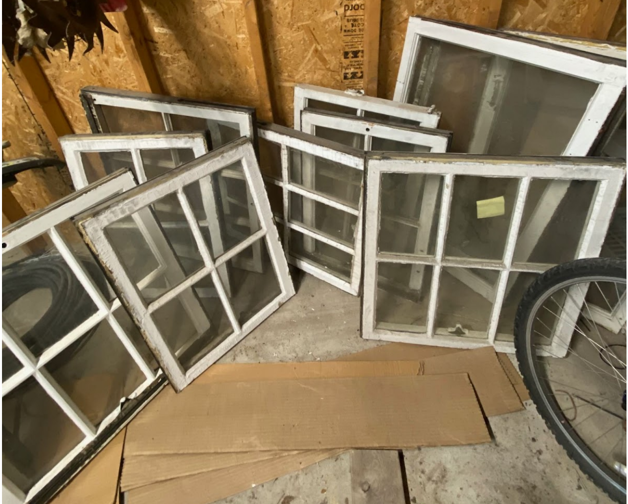
PICTURE ABOVE: Existing Sashes - These are all five window sets(that are not in place) that exist. They fit first and second floor windows found on the NW elevation (a scope of windows that would be done in a later phase).