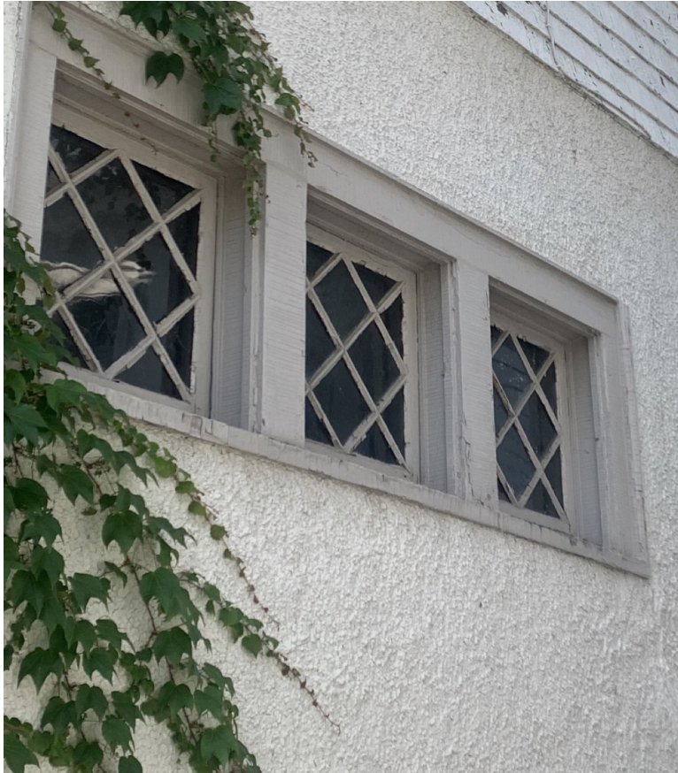
WINDOW#14#15#16. Exterior Frames. Fixed Single wood Sashes.