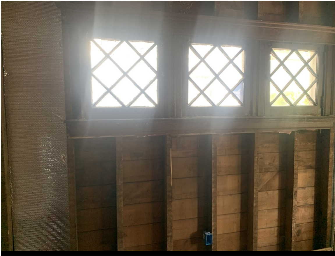
WINDOW#14#15#16. Fixed Single wood Sash with 36 diamond shape lites. (12 per sash).