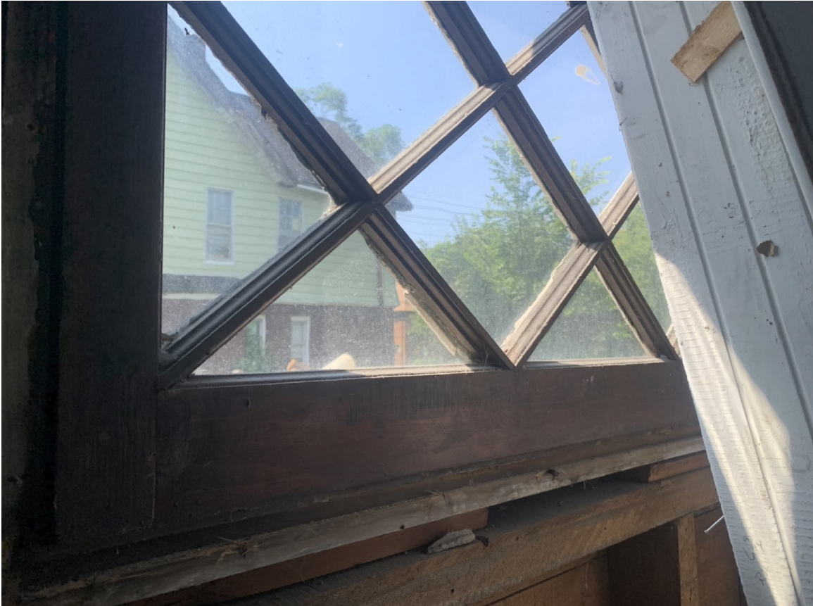
WINDOW#5. Fixed Single wood Sash with 17 diamond shape lites.