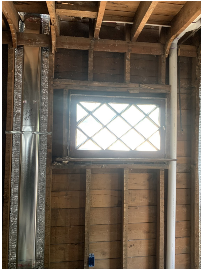
WINDOW#6. Fixed Single wood Sash with 17 diamond shape lites.