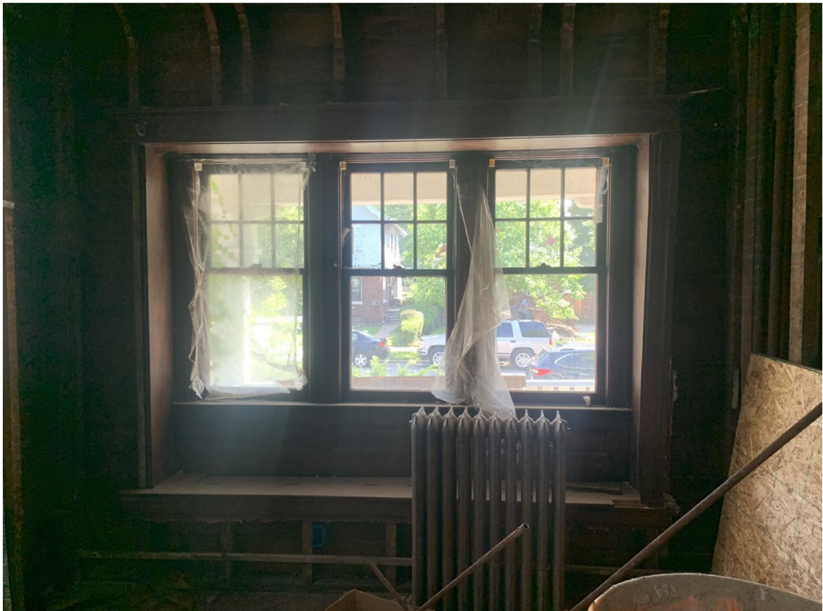
WINDOW#1#2#3. Interior view. 6-1.