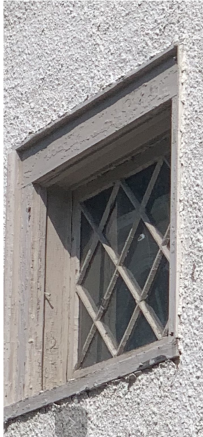
WINDOW#5#6. Exterior Framework. Fixed Single wood Sash with 17 diamond shape lites.