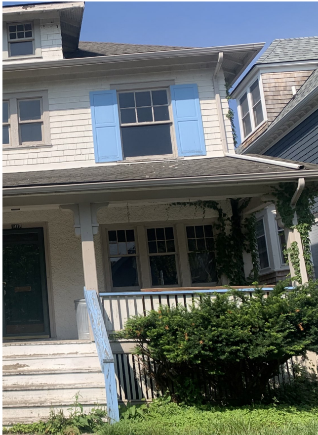
WINDOW#1#2#3. Double-Hung Windows with 21 lites (7 per sash)