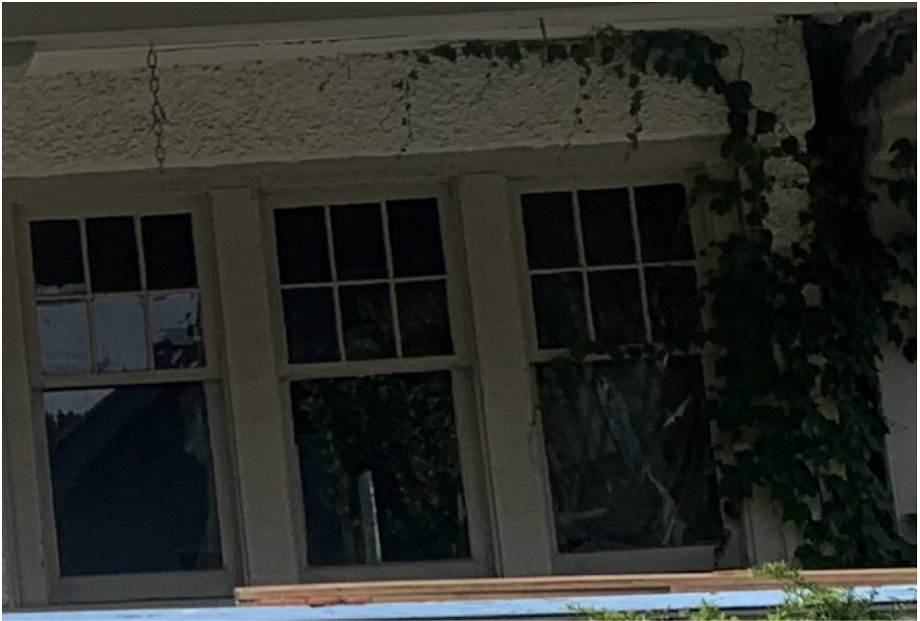
WINDOW#1#2#3. Exterior view.