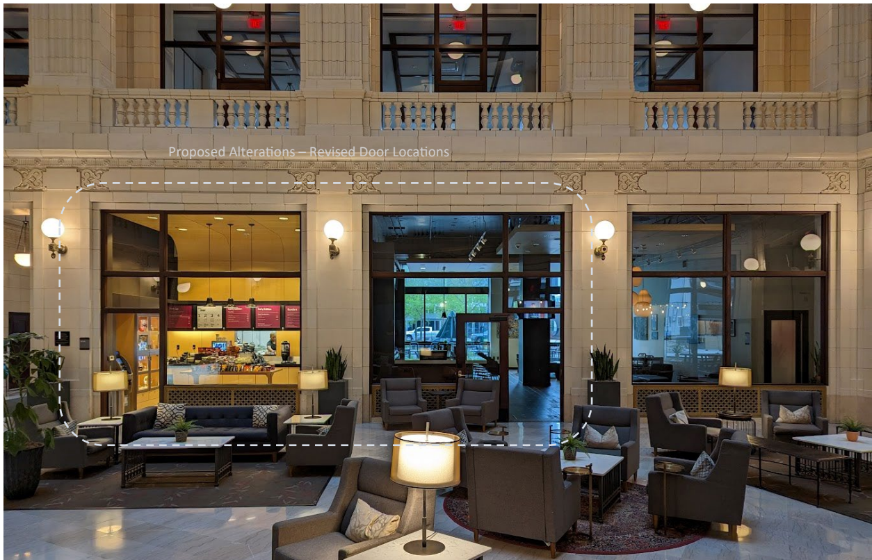
Interior Atrium – Storefront into Hotel Guest Services (Registration, Bar & Lounge)