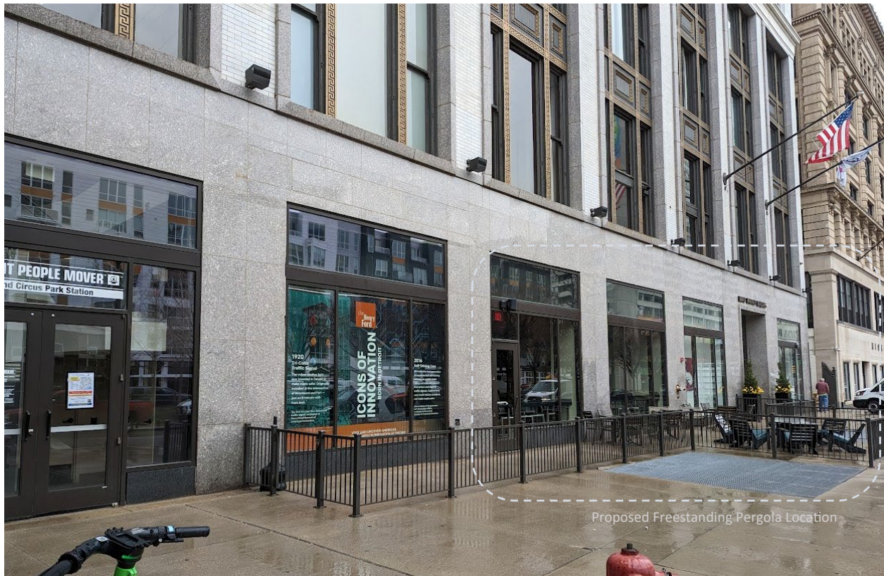
Northwest Corner – Looking South down Washington Ave