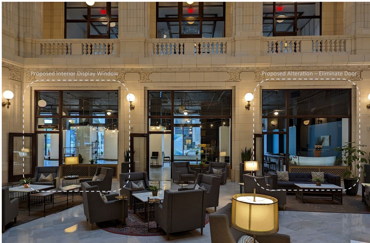
Interior Atrium – Storefront into Proposed New Restaurant