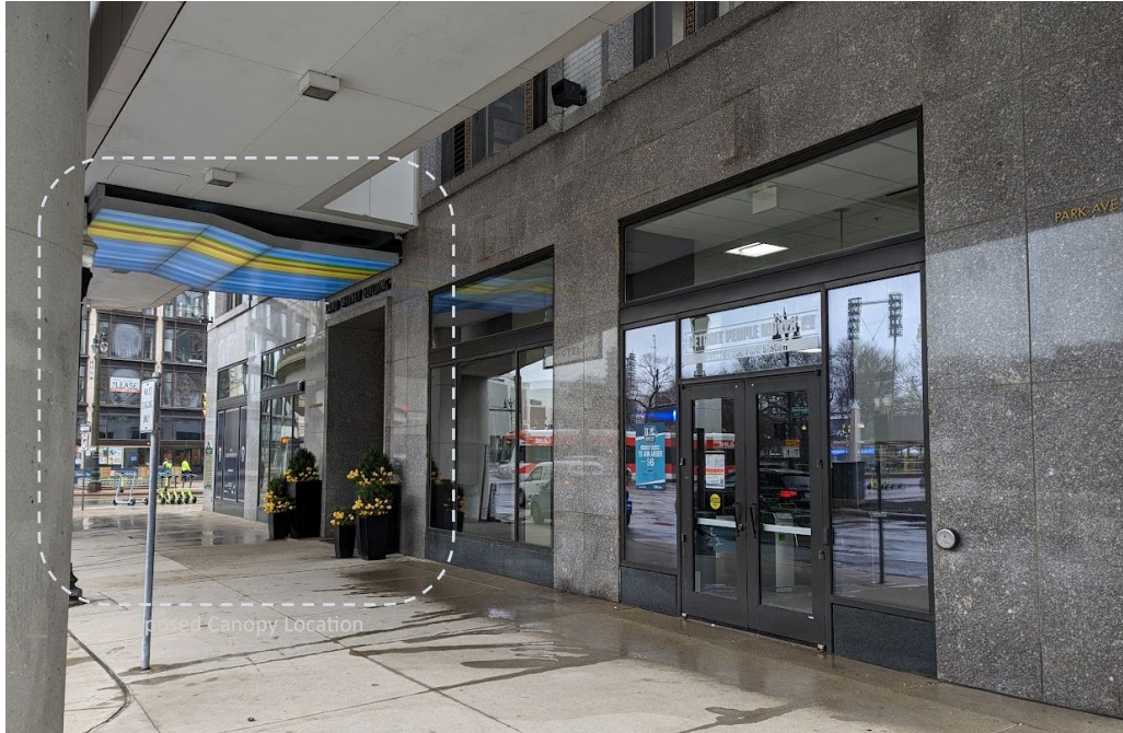
Northwest Corner of Building – Looking towards Woodward Ave.