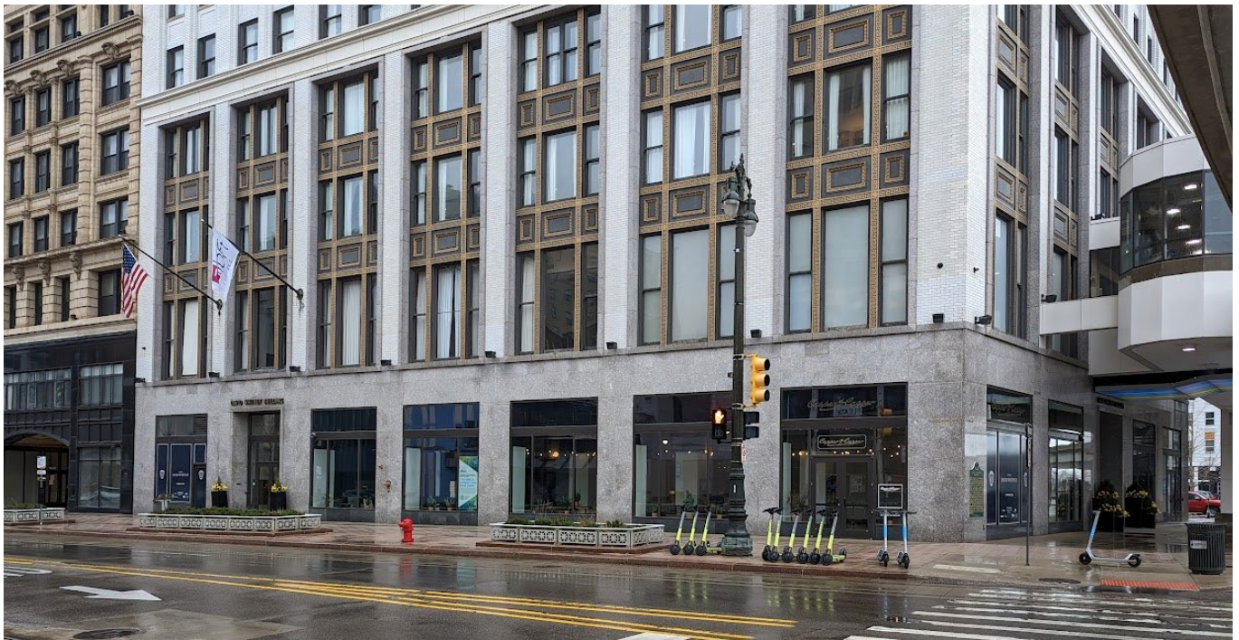
Northeast Corner of Building