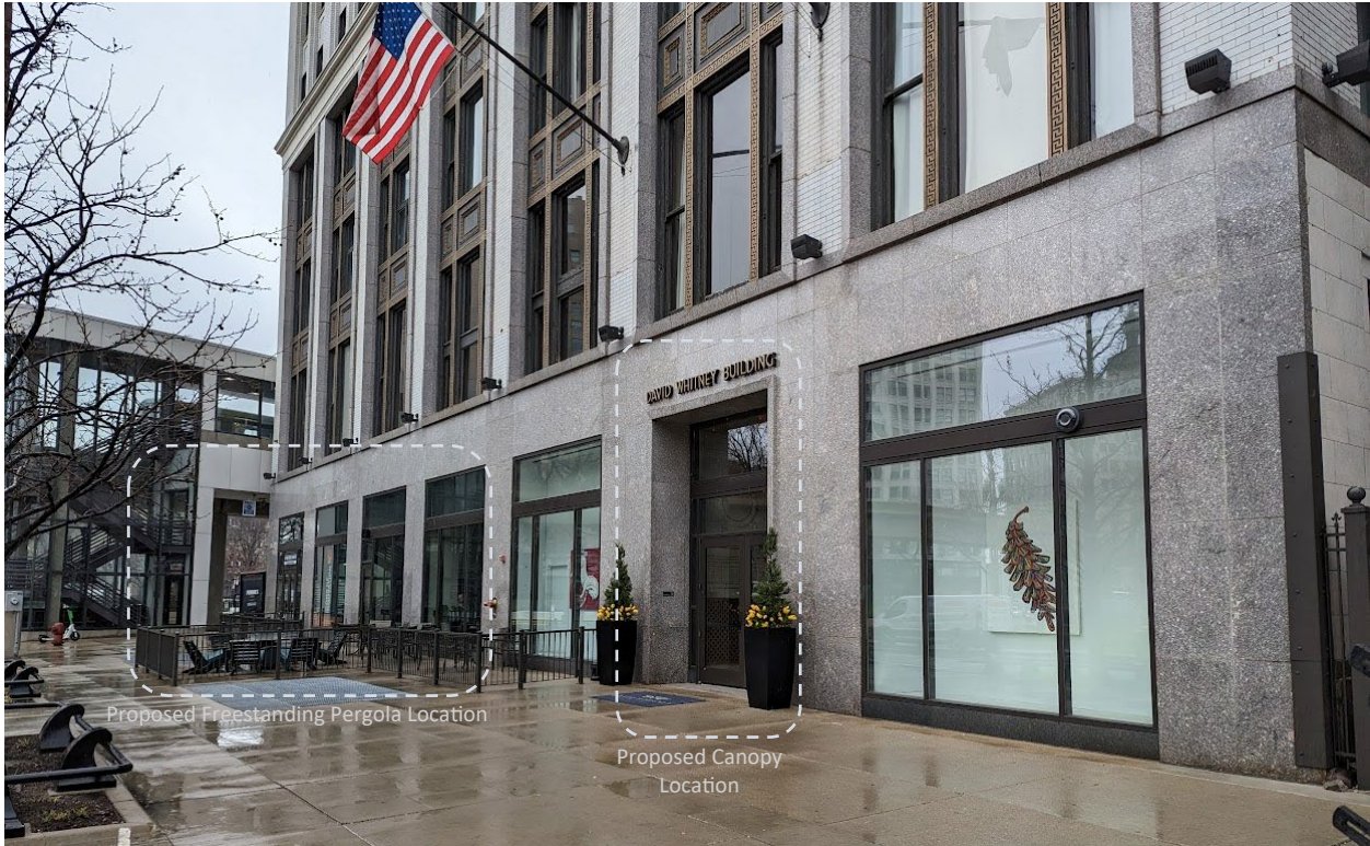
Southwest Corner – Looking North towards Grand Circus Park