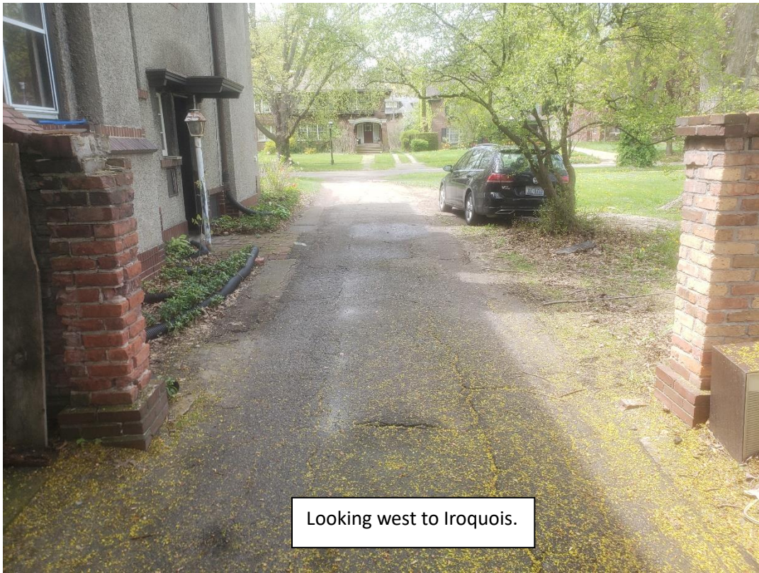
Looking west to Iroquois.