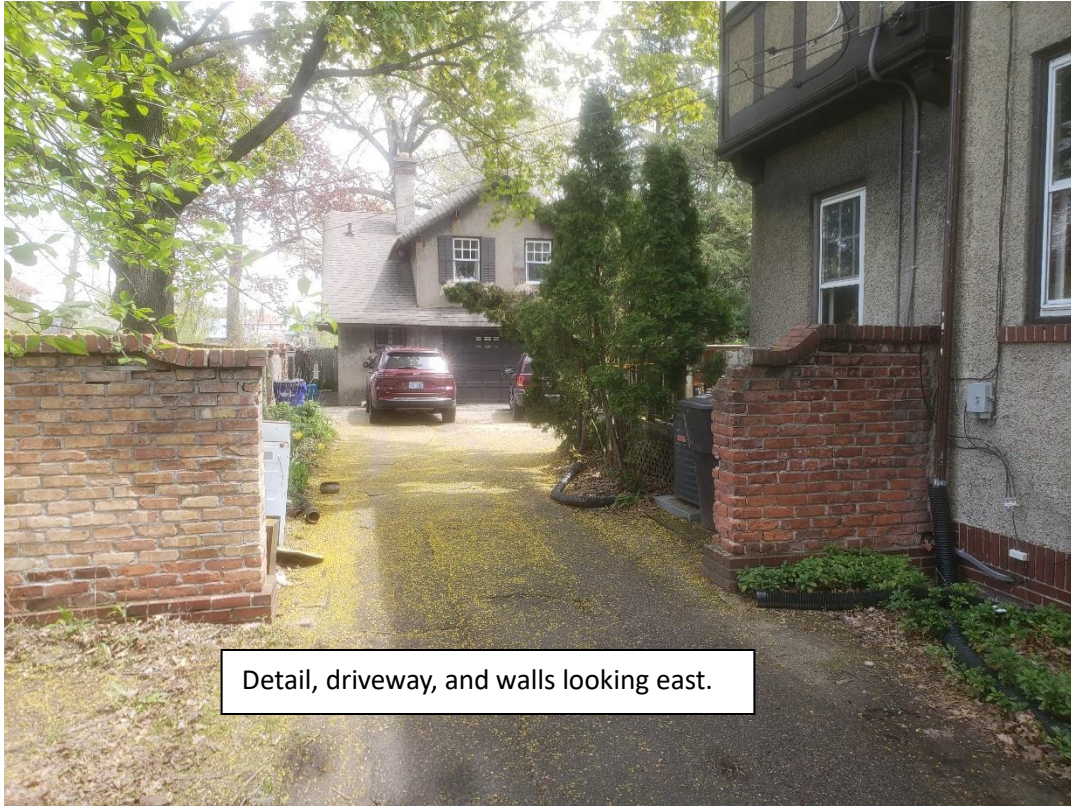
Detail, driveway, and walls looking east.