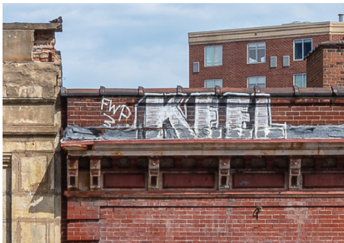
P-9 Metal panel water table in poor condition