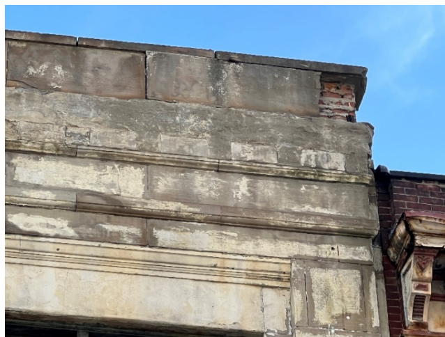
P-14 Loose limestone pieces above patched water table