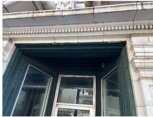
P-1 Mortar joints require tuck and re-pointing