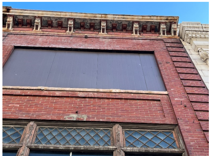
P-6 Red brick below water table