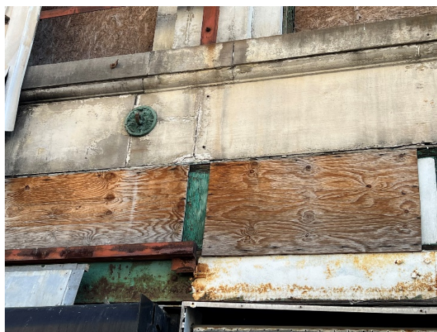
P-10 Cast-iron floret attached to stone