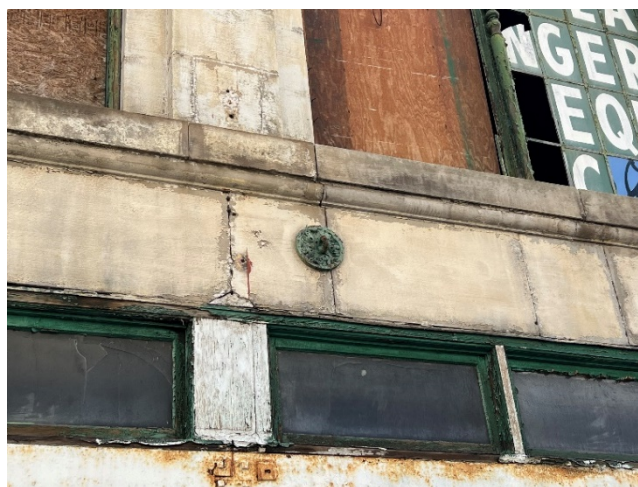
P-15 Cracked and damaged limestone due to steel corrosion and lack of lateral ties