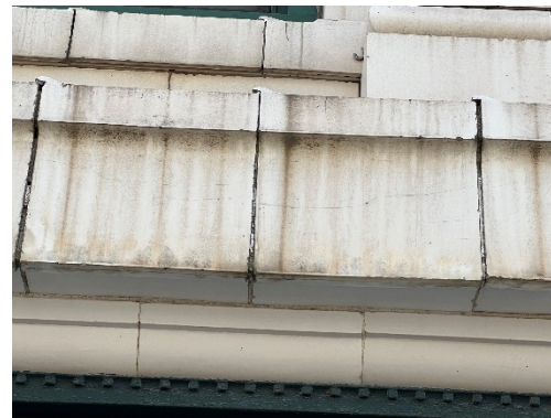
P-2 Face cracking due to water infiltration