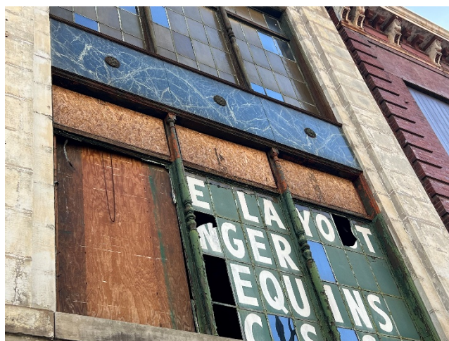
P-11 Cast-iron floret attached to marble. Cast-iron mullion posts