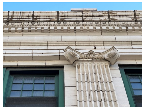
P-4 Delamination of glazing at upper water table