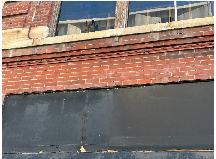
P-6 Metal panel above store front and second floor limestone sill