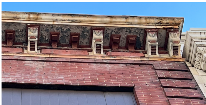
P-8 Metal panel water table in poor condition