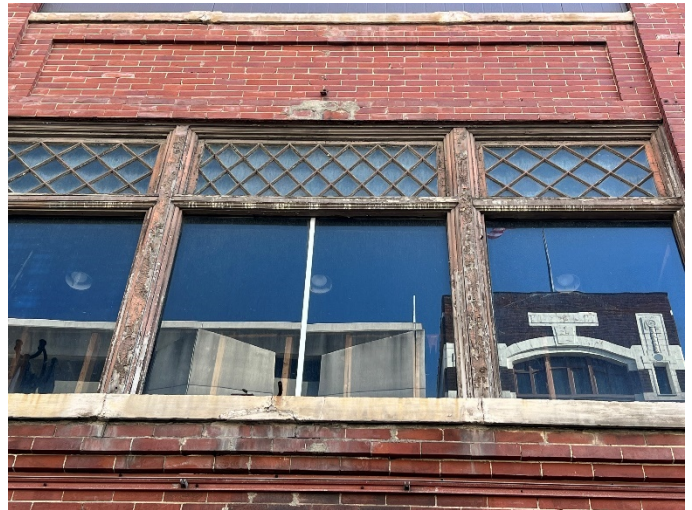
P-5 Red brick and limestone second floor and above