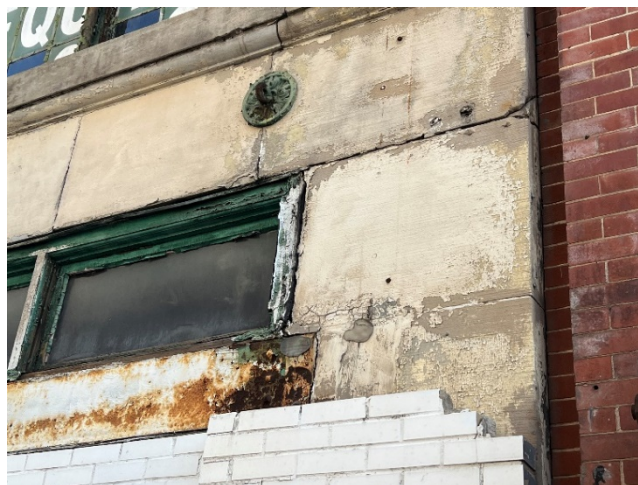
P-13 Damage to limestone and windows due to steel corrosion