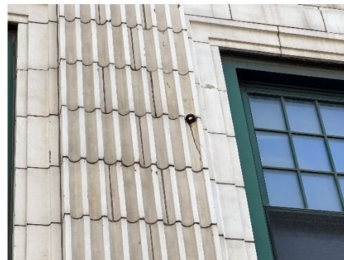
P-3 Spalling and cracking terra-cotta at steel embeds