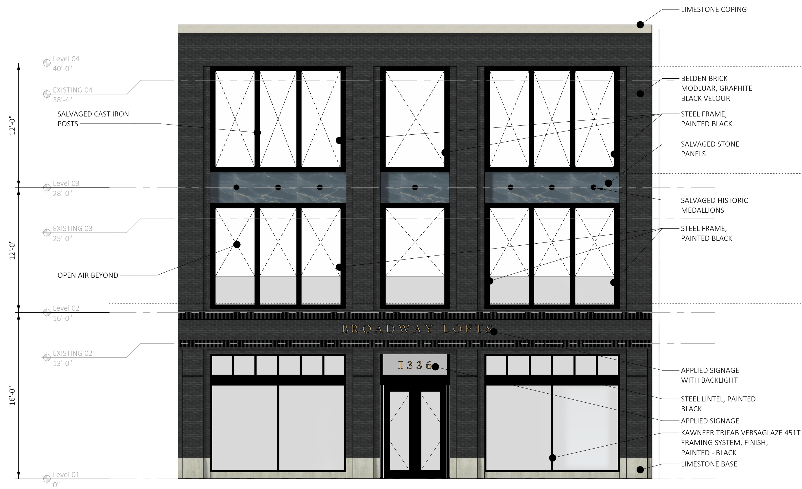
1336 PROPOSED ELEVATION SCALE: 3/16" = 1'-0"