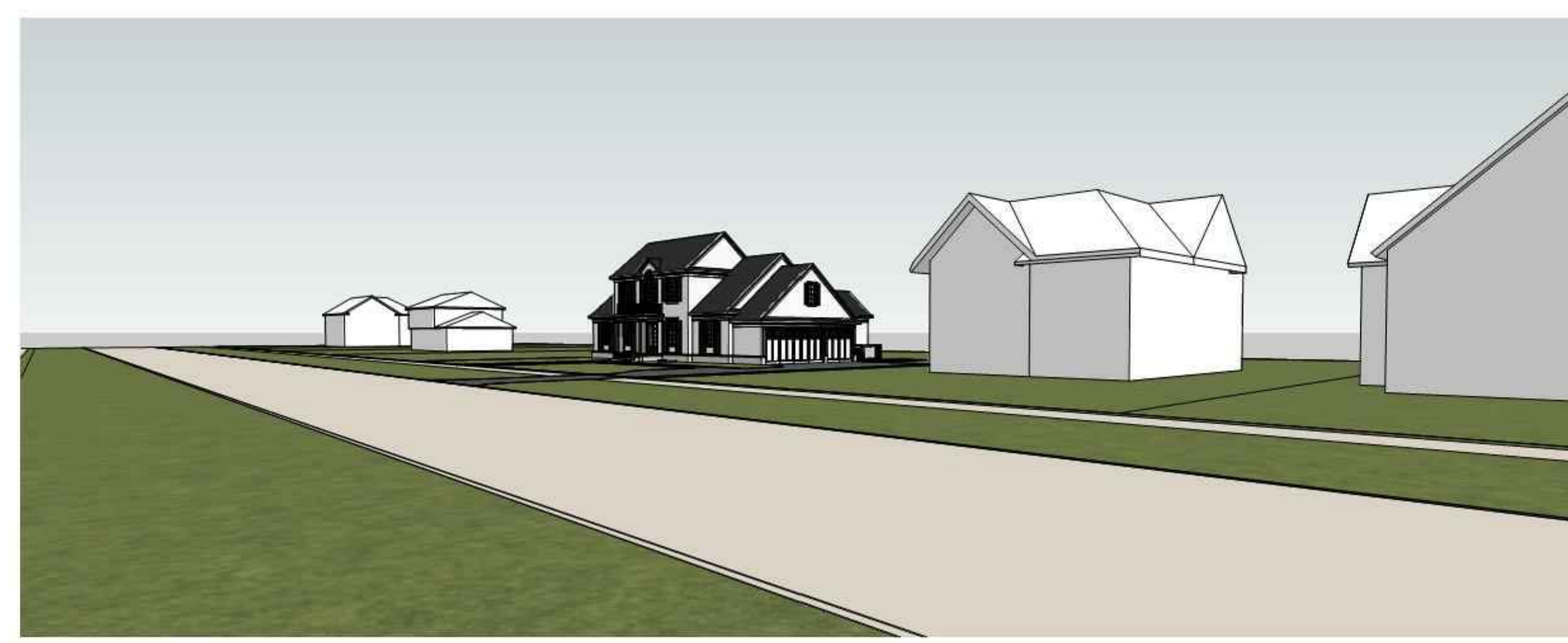
PERSPECTIVE VIEW - IROQUOIS AVE. TOWARDS GOETHE ST.