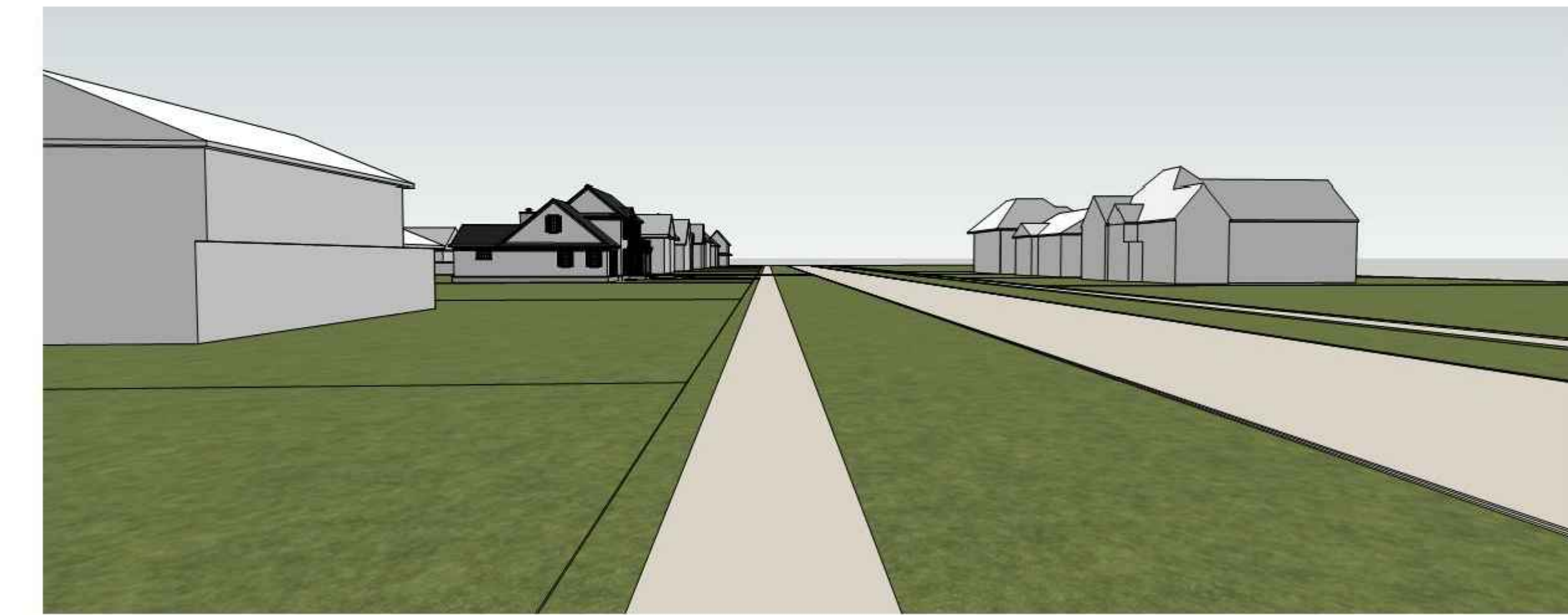
PERSPECTIVE VIEW - IROQUOIS AVE. TOWARDS CHARLEVOIX ST.