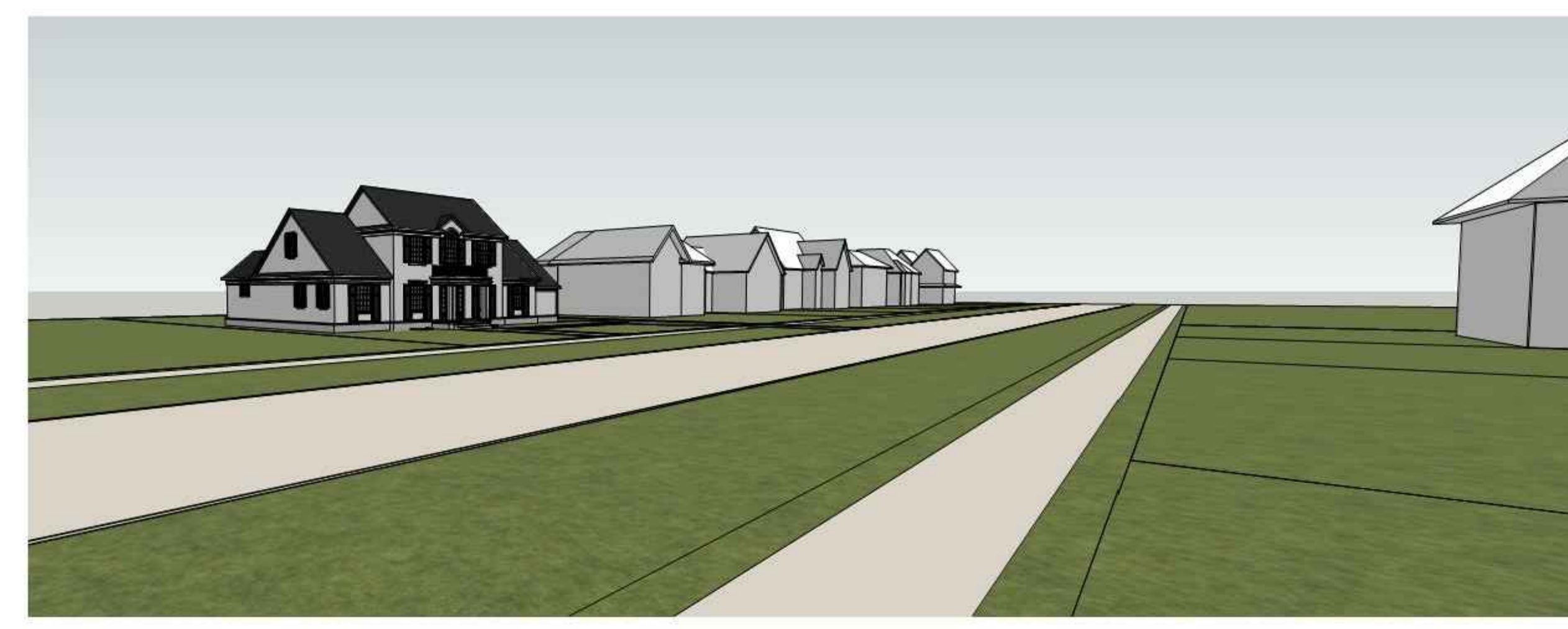
PERSPECTIVE VIEW - IROQUOIS AVE. TOWARDS CHARLEVOIX ST.