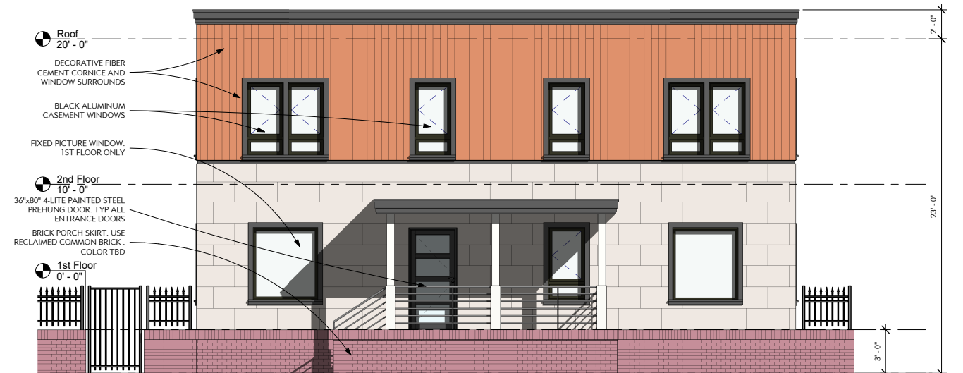
Proposed facade lacks visual interest, does not incorporate any architectural detail to provide context to the neighborhood