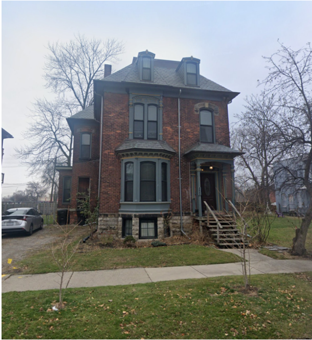
Buildings directly across from proposed development