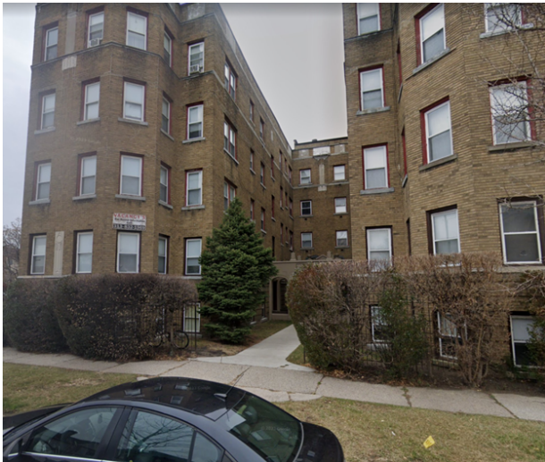
Buildings adjacent to proposed development