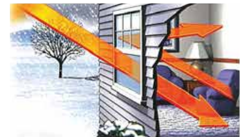
Winter Energy Savings: Low-E insulating glass reduces heat loss by reflecting warm air back into your home.