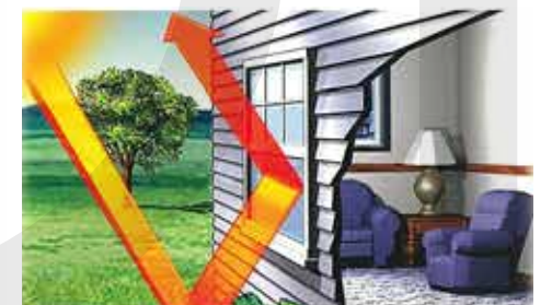
Summer Energy Savings: Low-E helps block unwanted solar heat penetration to help reduce air conditioning usage.

ClimaGuard insulated glass packages have proven to be far more effective than ordinary insulated glass units. Low-E glass also helps minimize UV rays that can cause furnishings to fade.