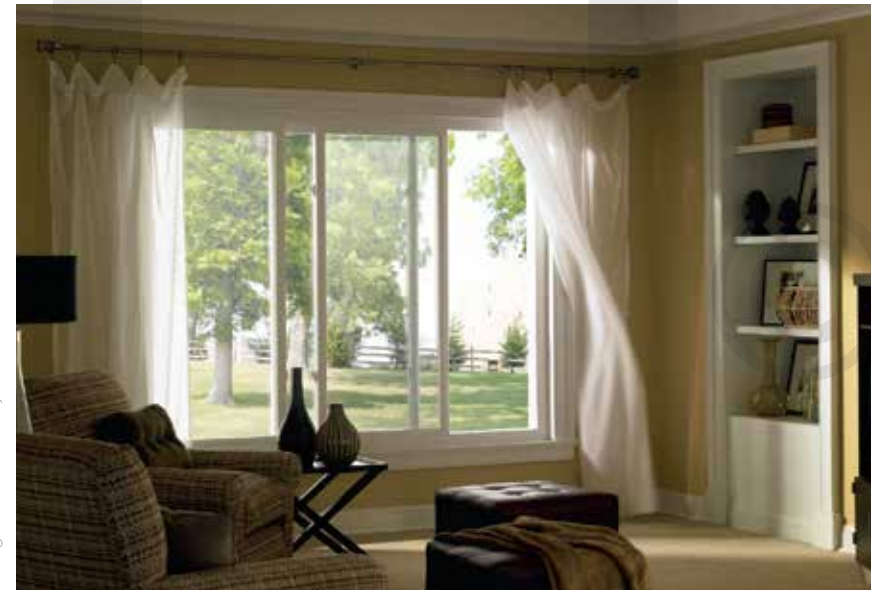
Above Top: Encore Double-Hung Windows feature a constant force balance system to ensure smooth operation; both sashes tilt for convenient cleaning from inside your home. Above: Encore Sliding Windows glide horizontally on a nylon-encased dual brass roller system, and the sashes lift out for easy cleaning.