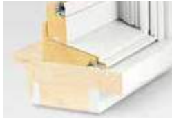
0° Sill Angle

Three sill angles are available — 0°, 8° and 14° — to closely match the existing sill in window replacement applications. See page 93 for details.