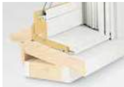
14° Sill Angle