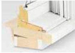
8° Sill Angle