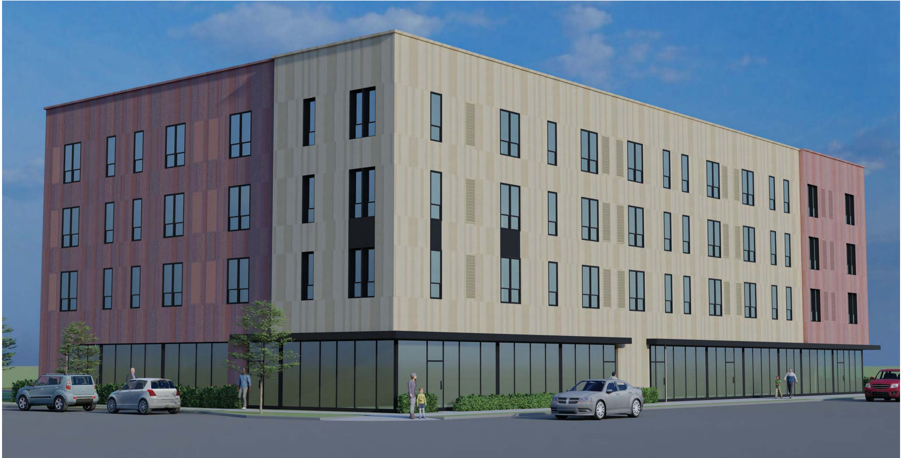
View from Winder and Brush