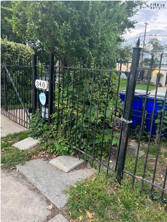
5 foot tall fence next to sidewalk at 340 Parkview Drive