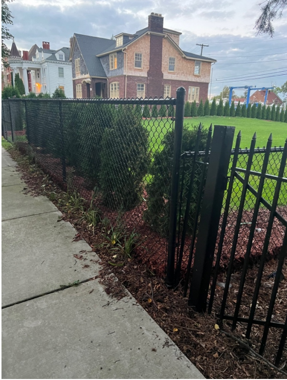
5 foot tall chain link fence installed 2 years ago at 470 Parkview