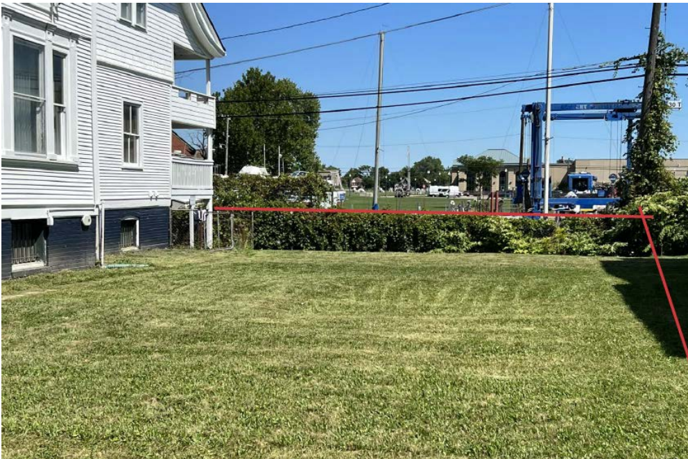
Rear of property