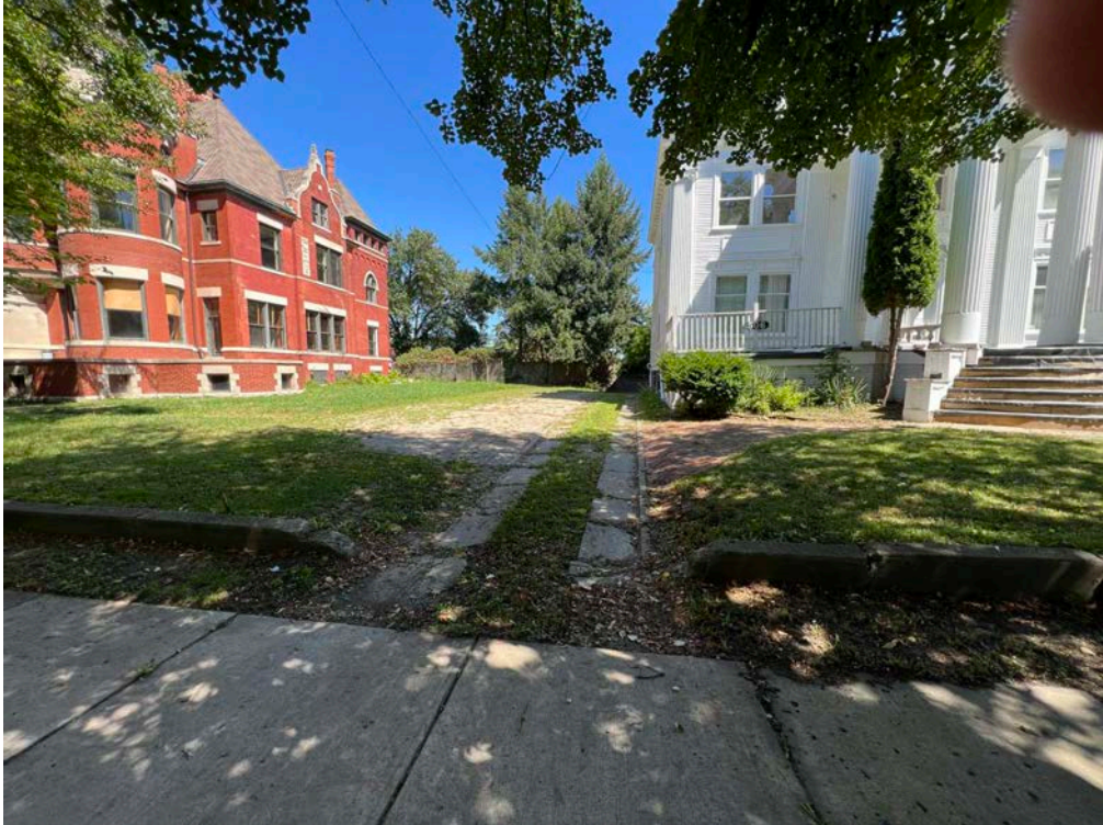
View of the north side