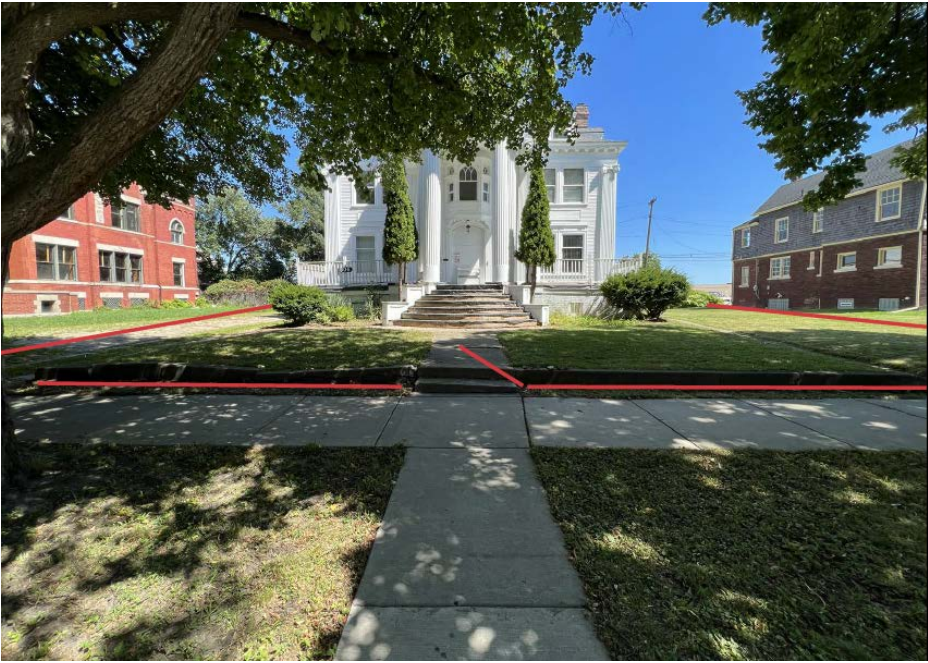
West side view showing proposed location of fence and gates

Photos showing location of proposed fencing and proposed fencing design