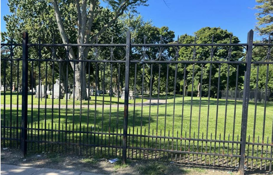
Mt. Elliott Cemetery Fence - new fence at 506 Parkview to be similar design and materials custom-fabricated

Brochure/cut sheets for proposed replacement material(s) and/or product(s), as applicable