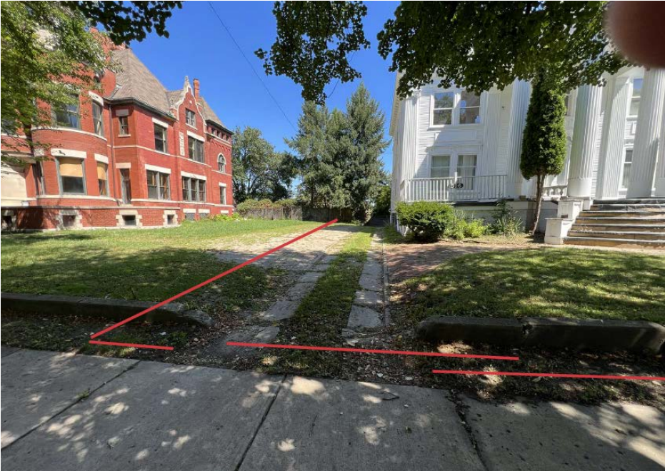
North Side showing proposed motorized sliding driveway gate