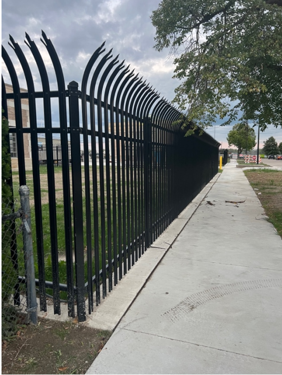
Newly installed 8 foot tall steel fence next to sidewalk at south end of the same block – Great Lakes Water Authority property.