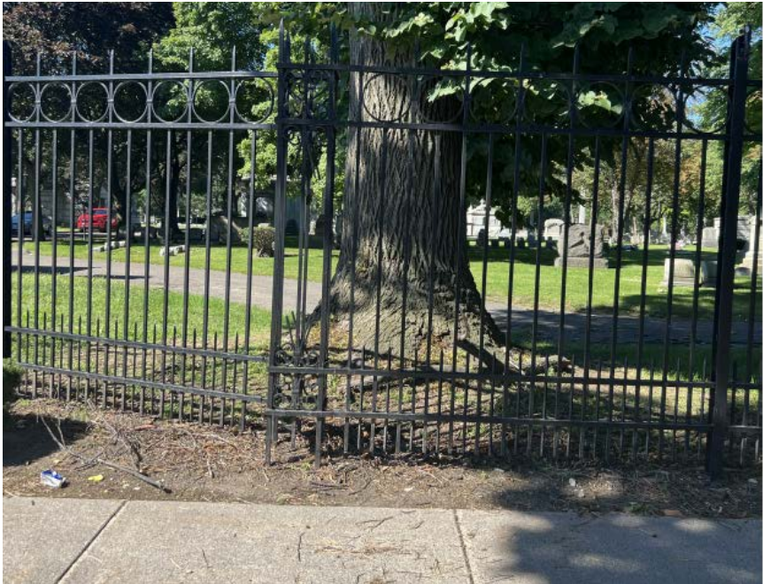
Mt. Elliott Fence second view with four sided support post