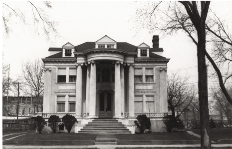
Historic view of 506 Parkview with fence at north side.