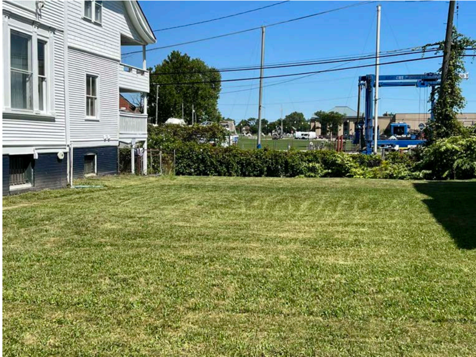
View of rear of property adjoining Stanton canal