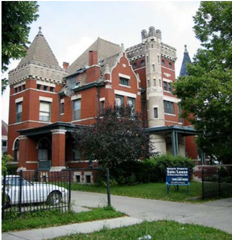
House next door at 530 Parkview with 5 ft fence at edge of sidewalk circa 2010

Detailed photographs of location of proposed work (photographs to show existing condition(s), design, color, & material)