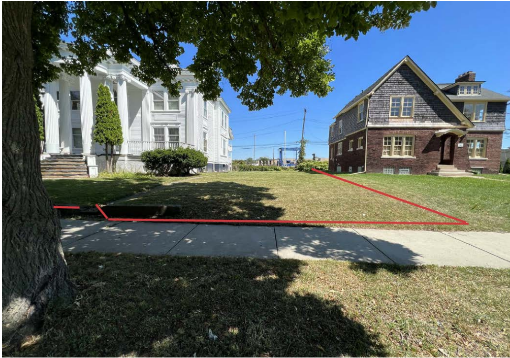
South side showing proposed fence and side path gate