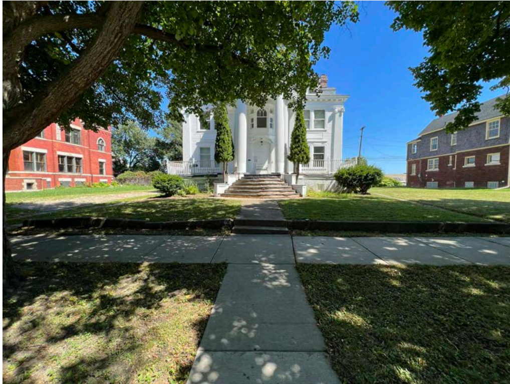
View of west side at street