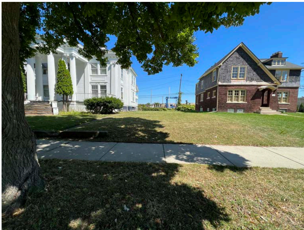
View of south side