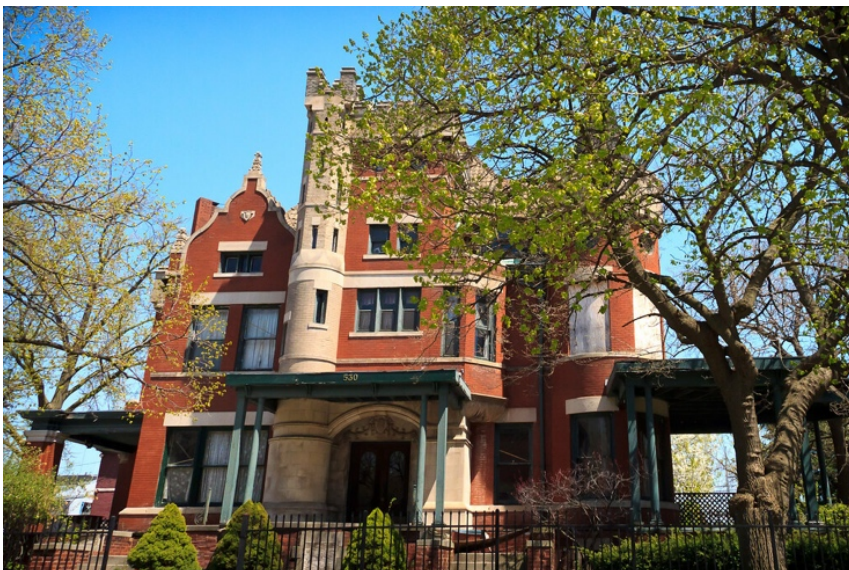
Another view of 2010 fence at 530 Parkview