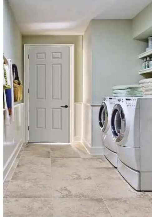
Hover Image to Zoom