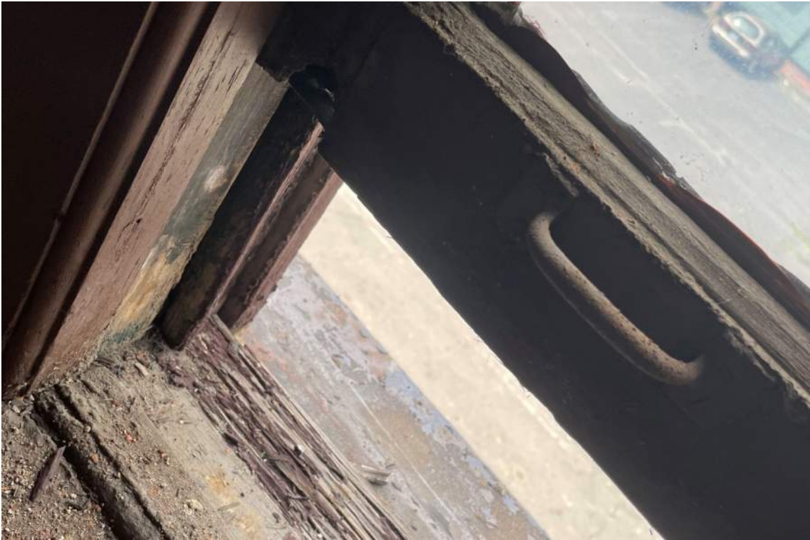
Figure #19: Interior, Typical sash and sill condition, Looking West. 06-08-22.