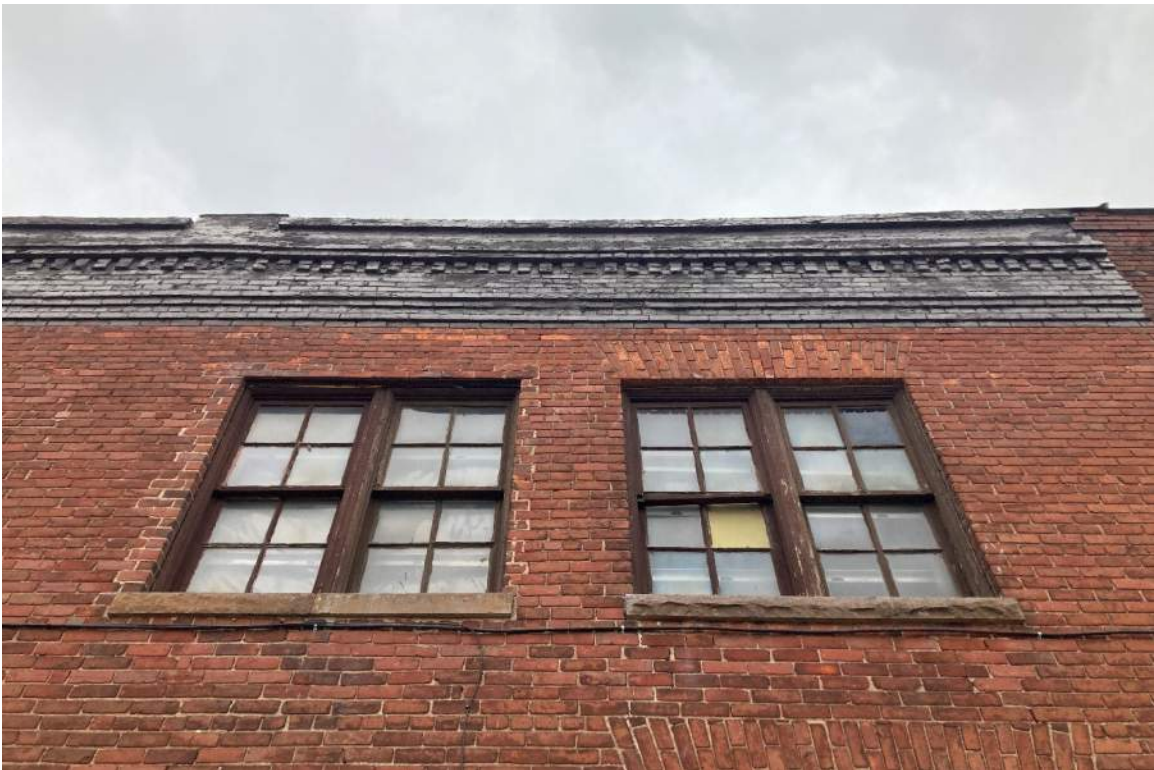
Figure #10: Exterior, Window Detail, Looking East. 01-17-22.