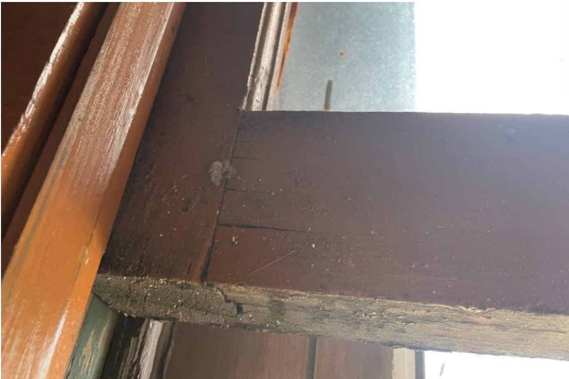
Figure #12: Interior, Typical sash joinery detail on window, Looking North. 06-08-22.