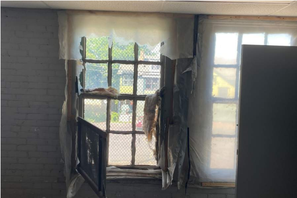
Figure #15: Interior, Typical Window on West elevation, Looking West. 06-08-22.