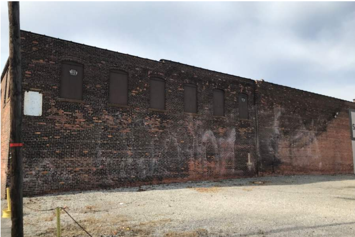
Figure #04: Exterior, East elevation, Looking West. 01-17-22