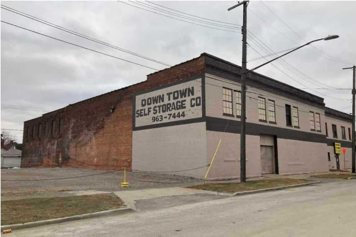
Figure #05: Exterior, North and East elevations, Looking southwest. 01-17-22.