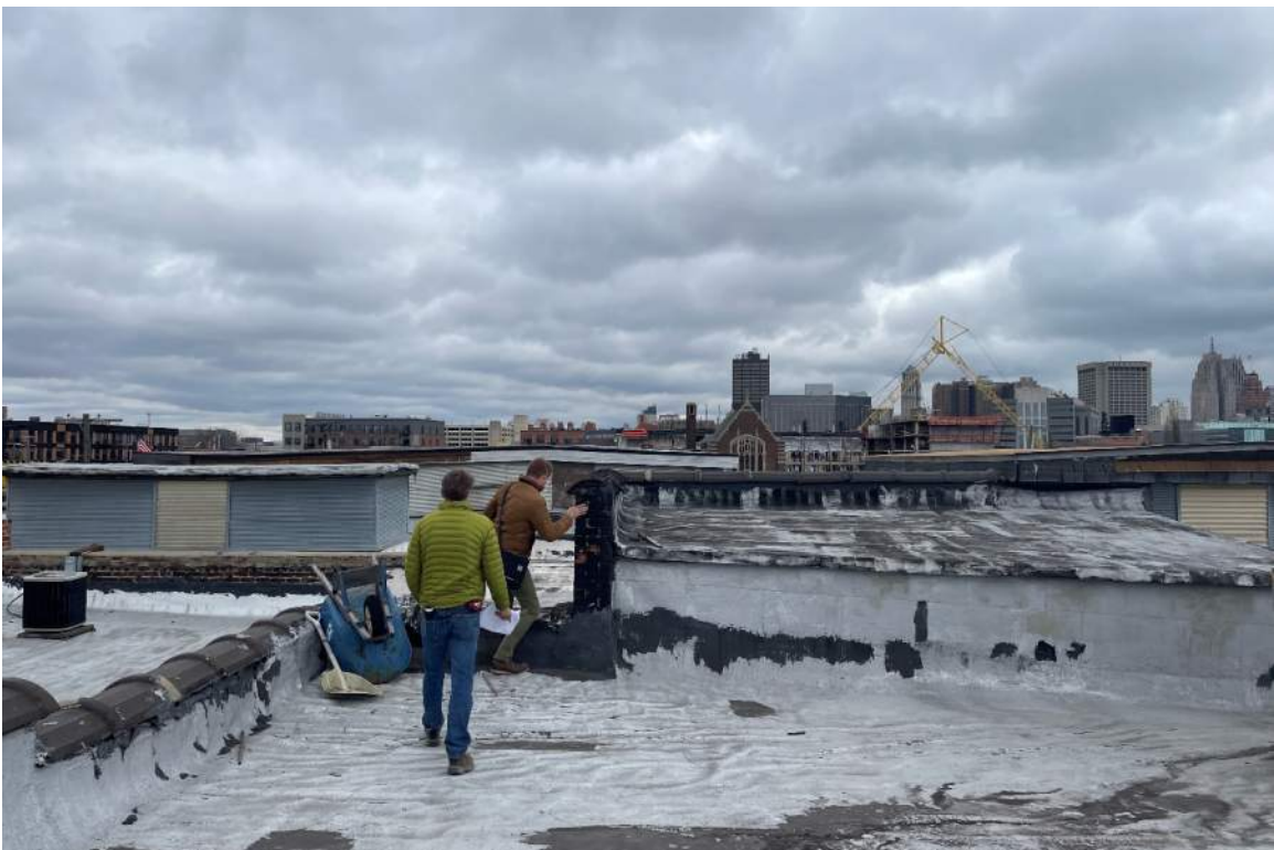
Figure #08: Exterior, Typical Roof Condition, Looking East. 03-31-22.