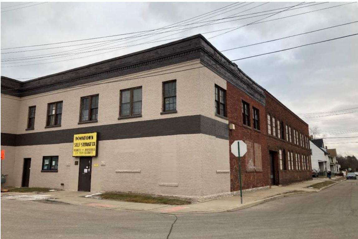
Figure #06: Exterior, North and West elevations, Looking southeast. 01-17-22.