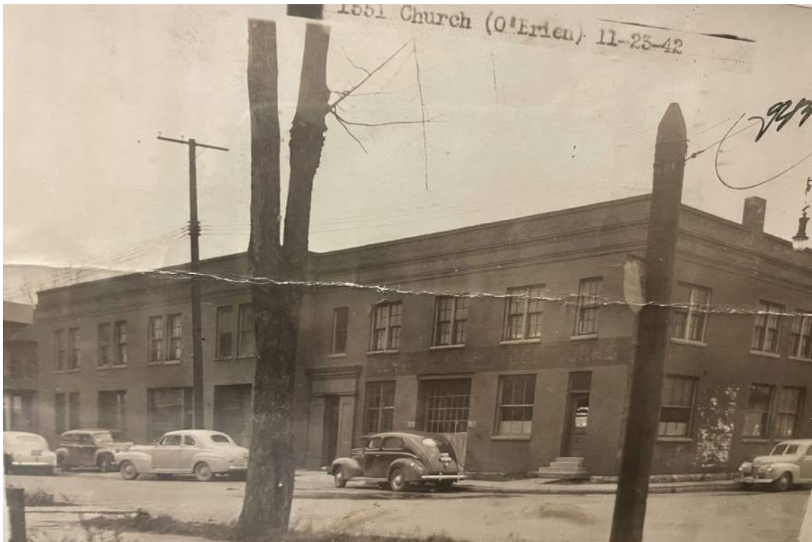
Figure #25: Exterior, Historic Image, Looking southeast. 11-23-1942.