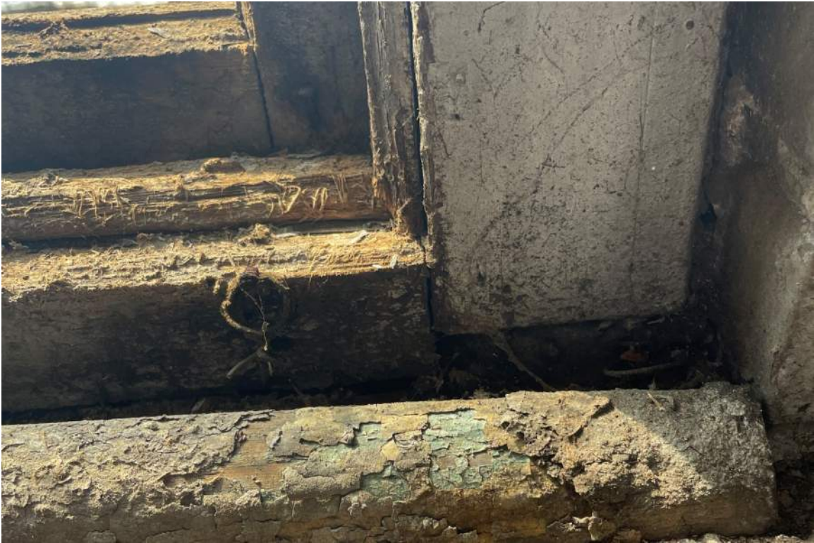
Figure #13: Interior, Typical sill and sash condition on South elevation windows, Looking South. 06-08-22.