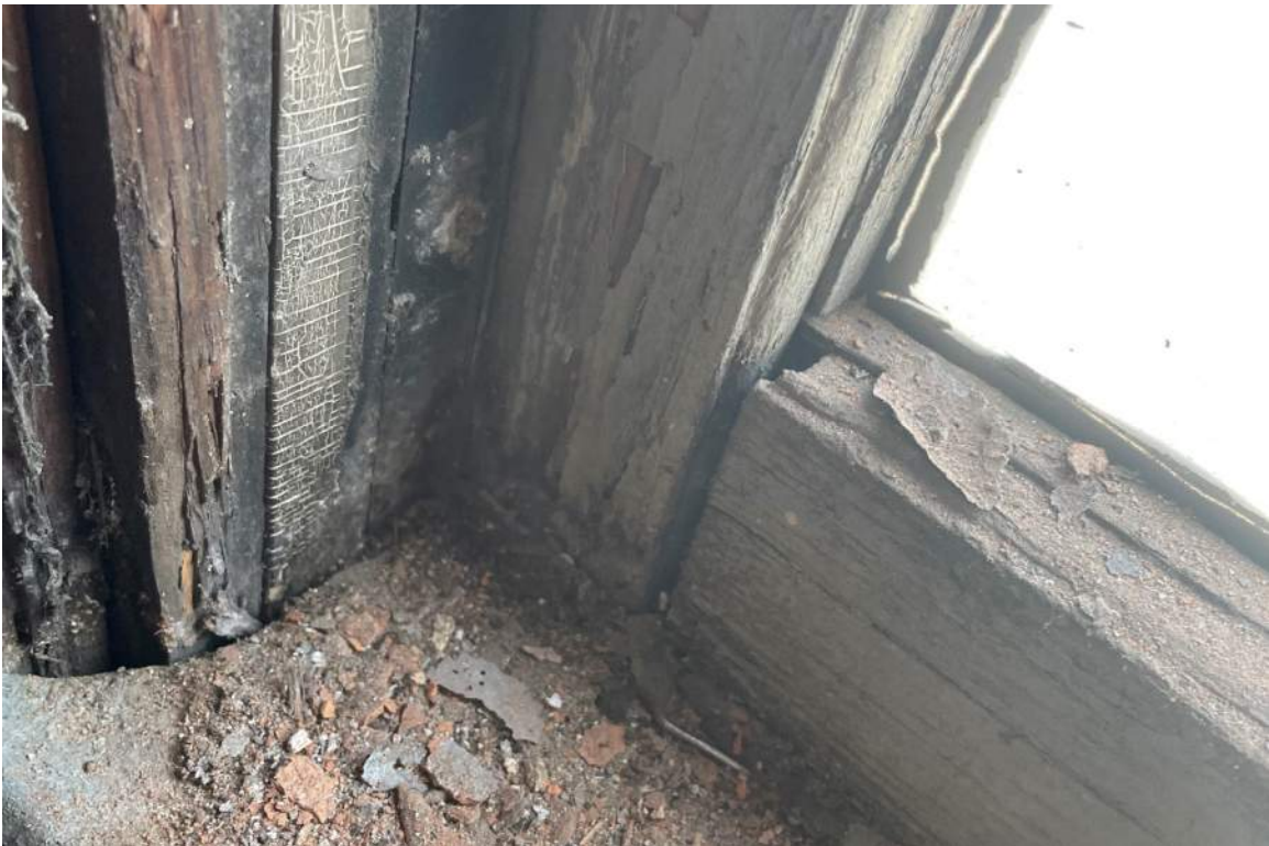
Figure #16: Interior, Typical sash joinery condition on West elevation, Looking West. 06-08-22.