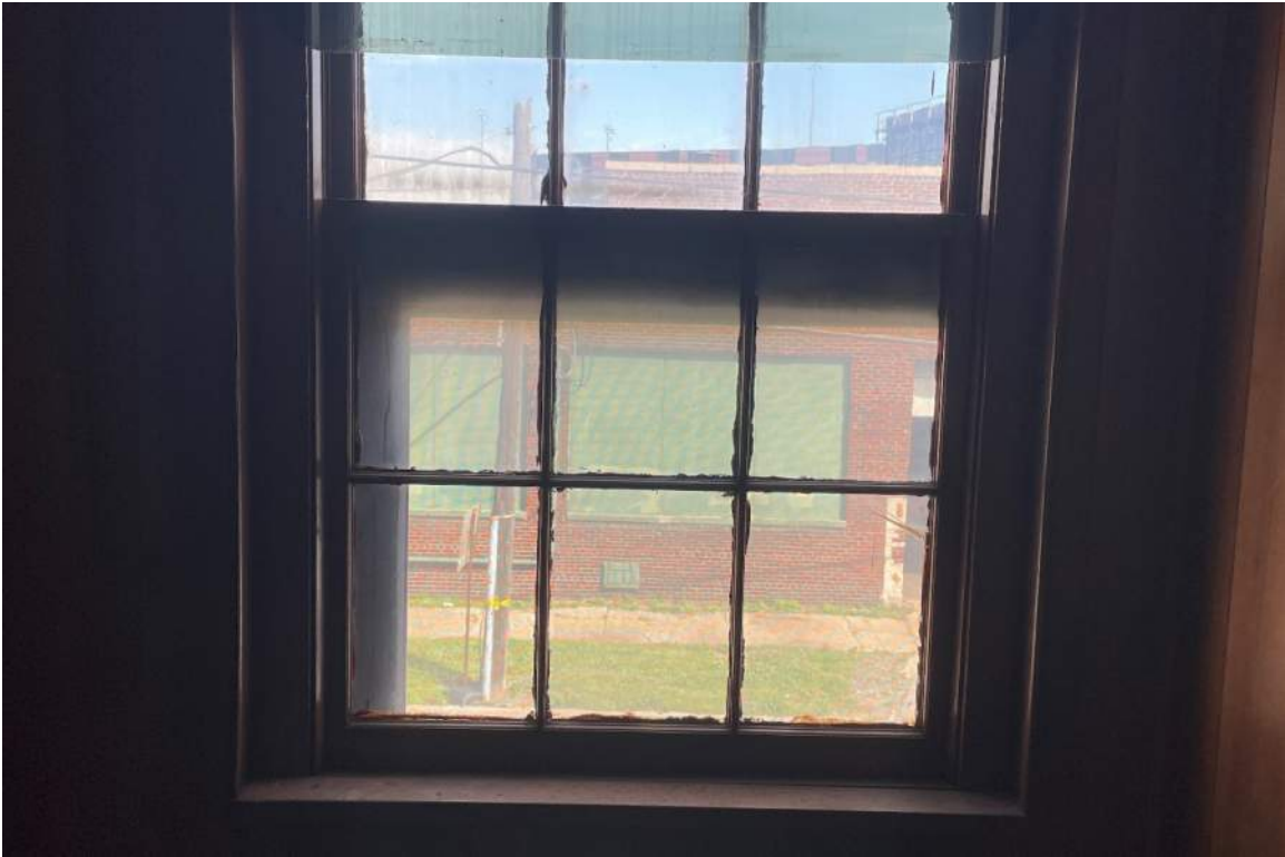
Figure #11: Interior, Typical Window on North elevation, Looking North. 06-08-22.