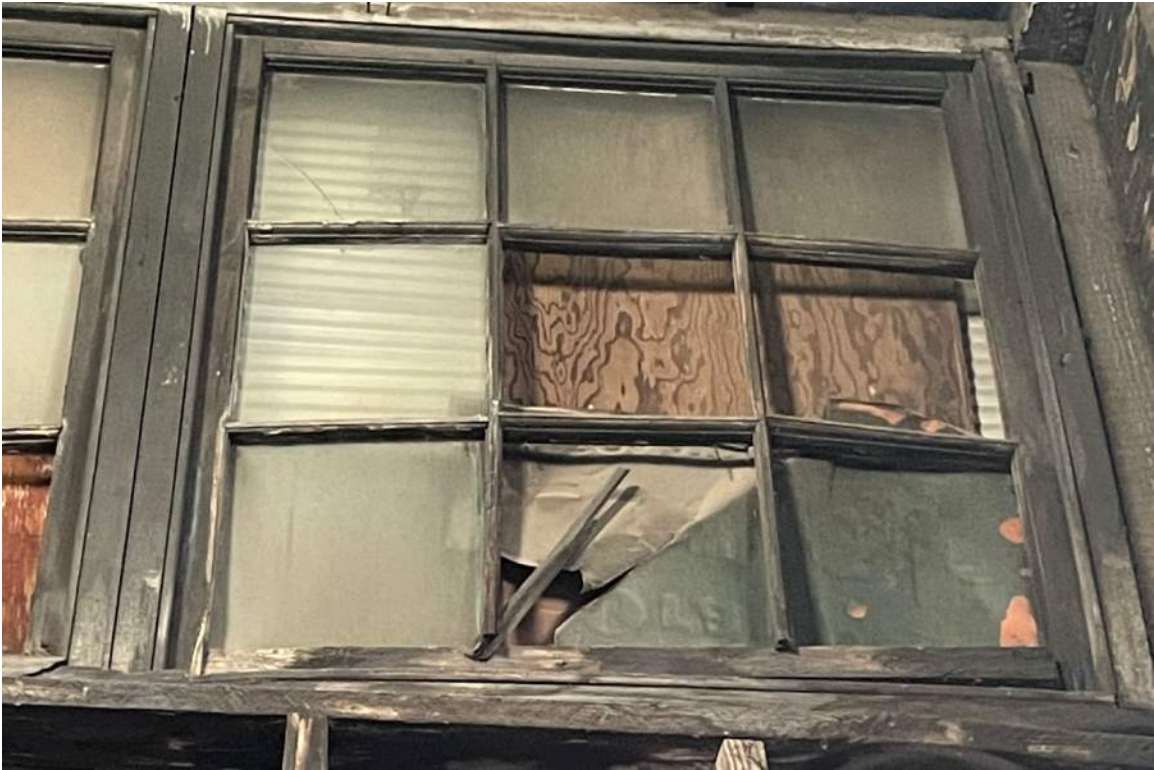
Figure #21: Interior, Detail of Roof Monitor Window Condition, Looking West and Up. 06-08-22.