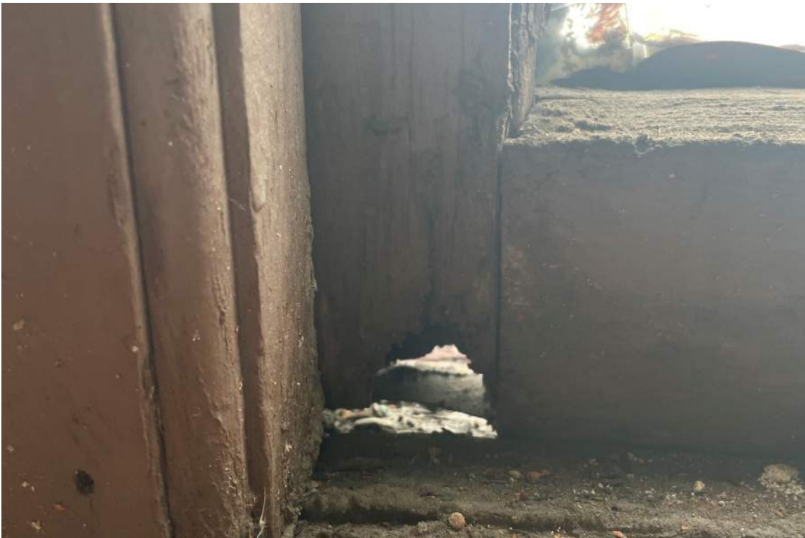
Figure #18: Interior, Typical sash joinery condition on West elevation, Looking West. 06-08-22.

Red Arrow Lofts 1567 Church, Detroit, MI