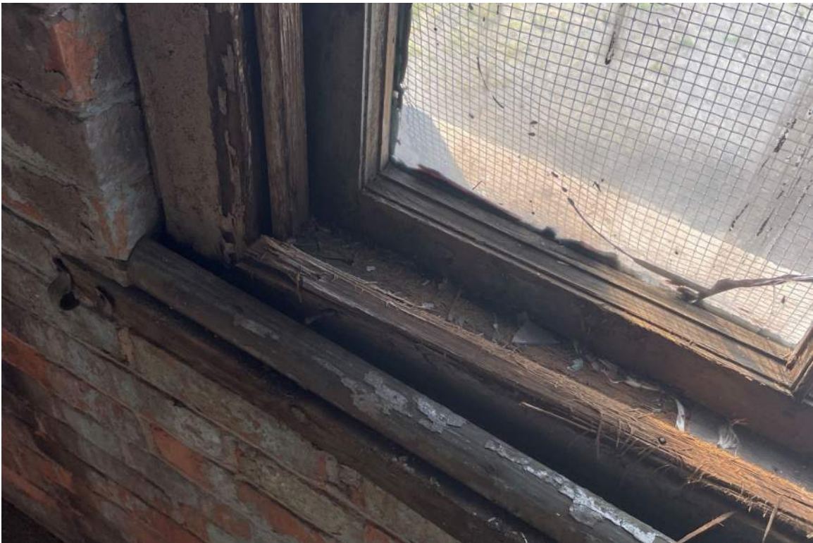
Figure #14: Interior, Typical sill and sash condition on South elevation windows, Looking South. 06-08-22.