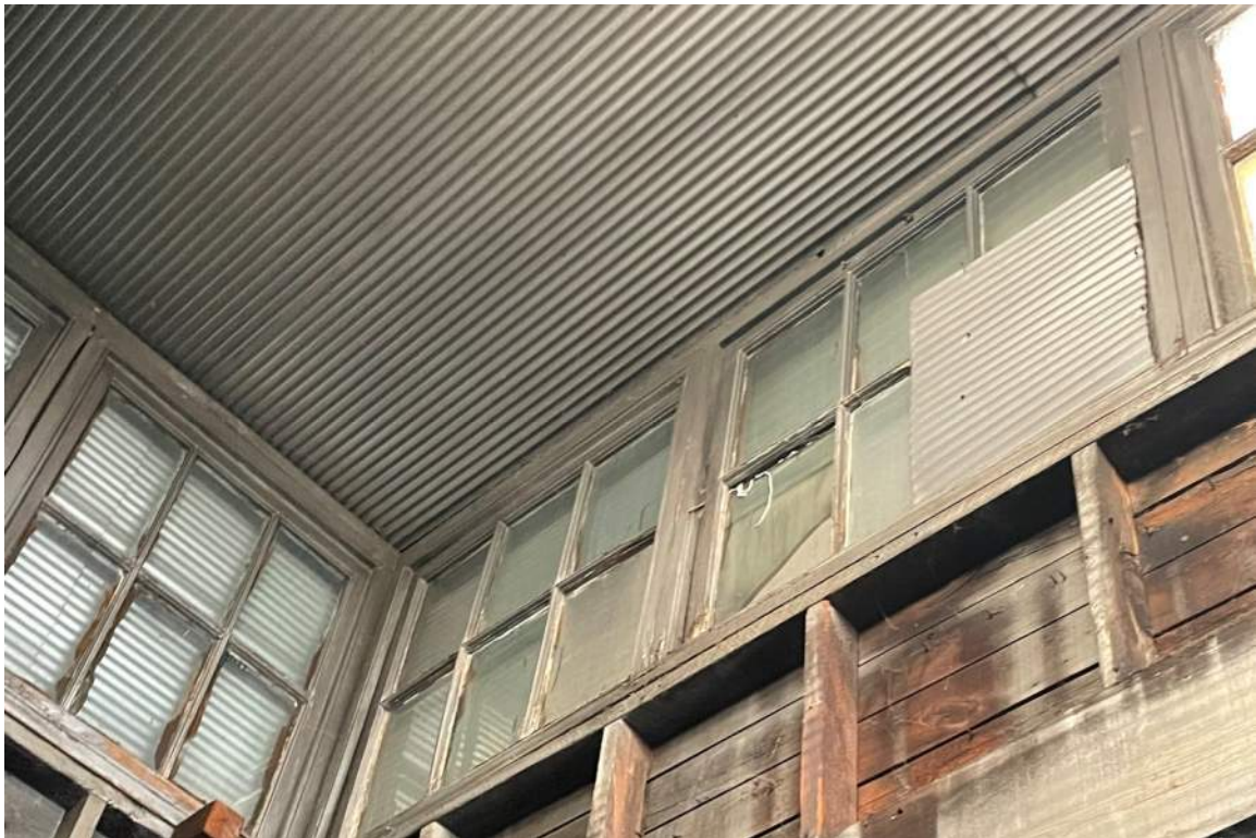
Figure #22: Interior, Roof Monitor Windows, Looking Southwest and Up. 06-08-22.