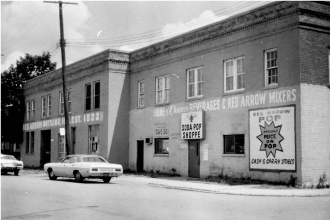
Figure #27: Exterior, Historic Image, Looking southeast. 1976.