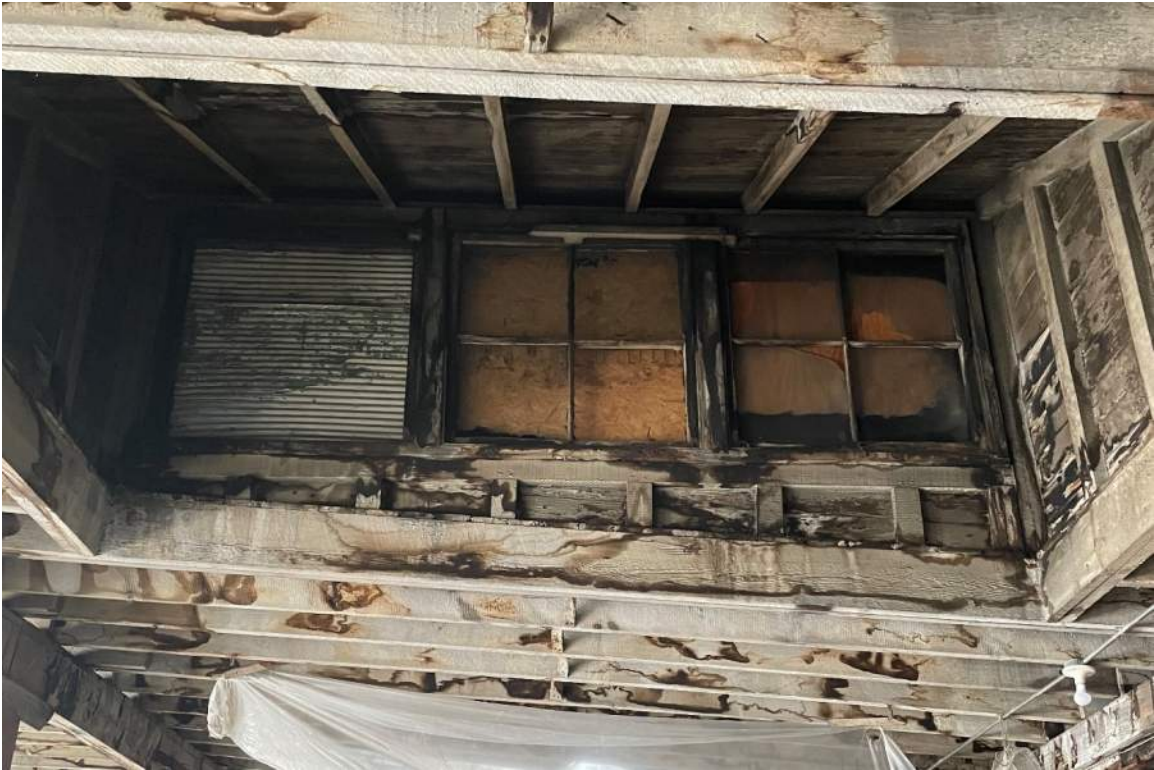
Figure #23: Interior, Typical Sawtooth Skylight Windows, Looking North and Up. 06-08-22.