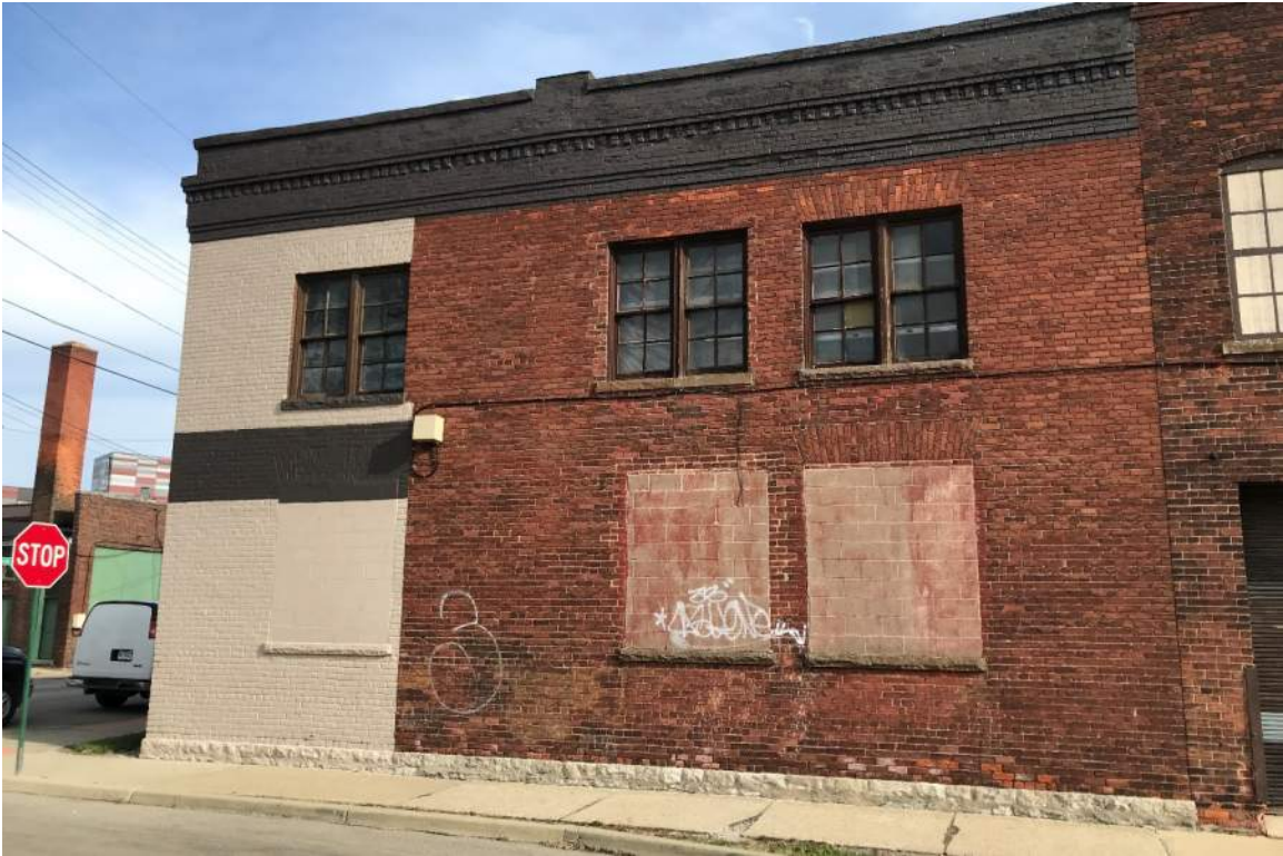
Figure #09: Exterior, Window Detail, Looking East. 01-17-22.