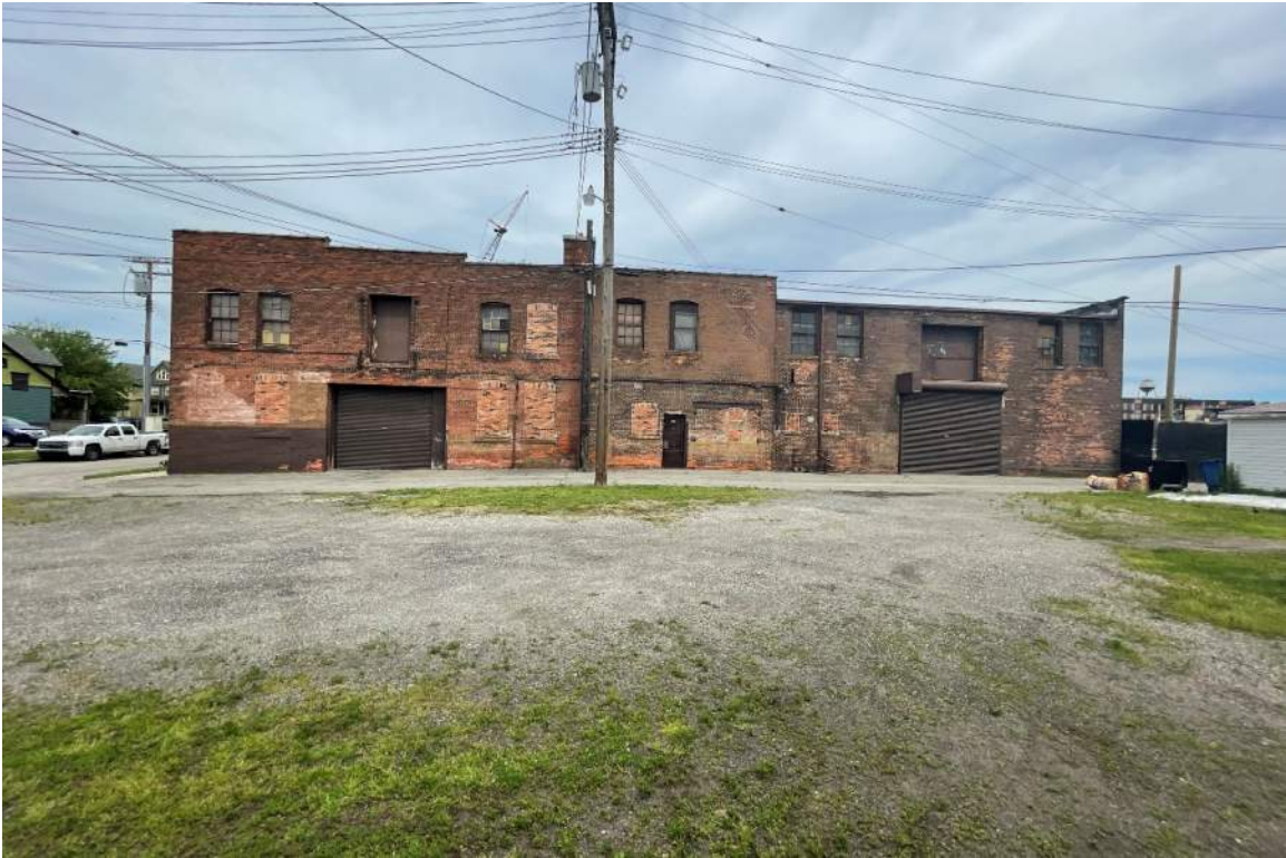
Figure #03: Exterior, South elevation, Looking North. 06-08-22.