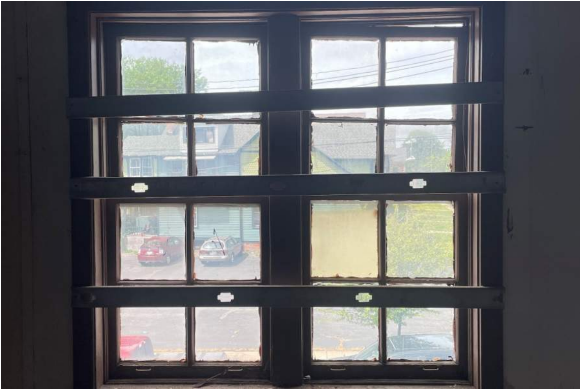
Figure #17: Interior, Typical Windows on West elevation, Looking West. 06-08-22.