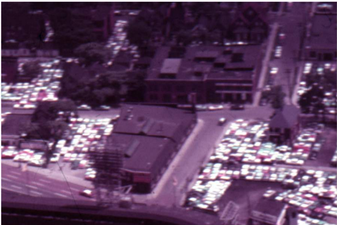
Figure #26: Exterior, Historic Image, Aerial Looking South. 1959.