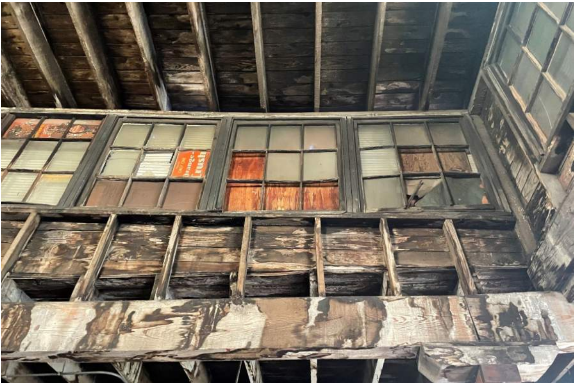
Figure #20: Interior, Roof Monitor Windows, Looking West and Up. 06-08-22.