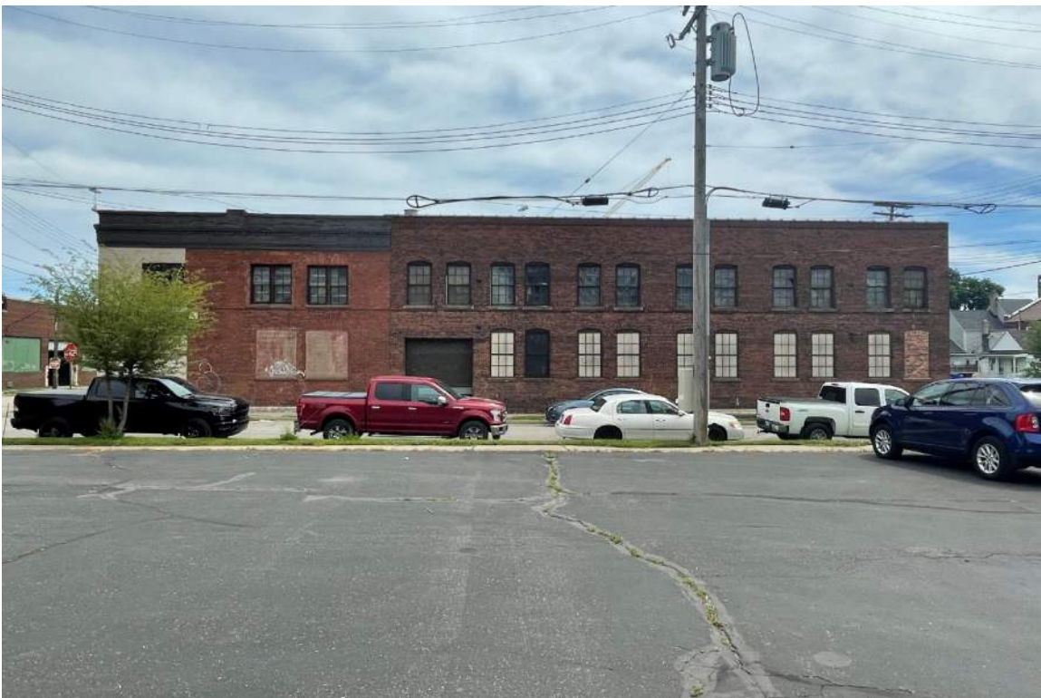
Figure #02: Exterior, West elevation, Looking East. 06-08-22.