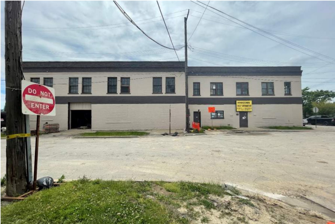
Figure #01: Exterior, North elevation, Looking South. 06-08-22.