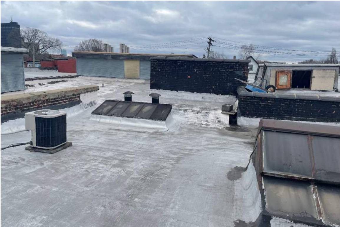
Figure #07: Exterior, Typical Roof Condition, Looking East. 03-31-22.