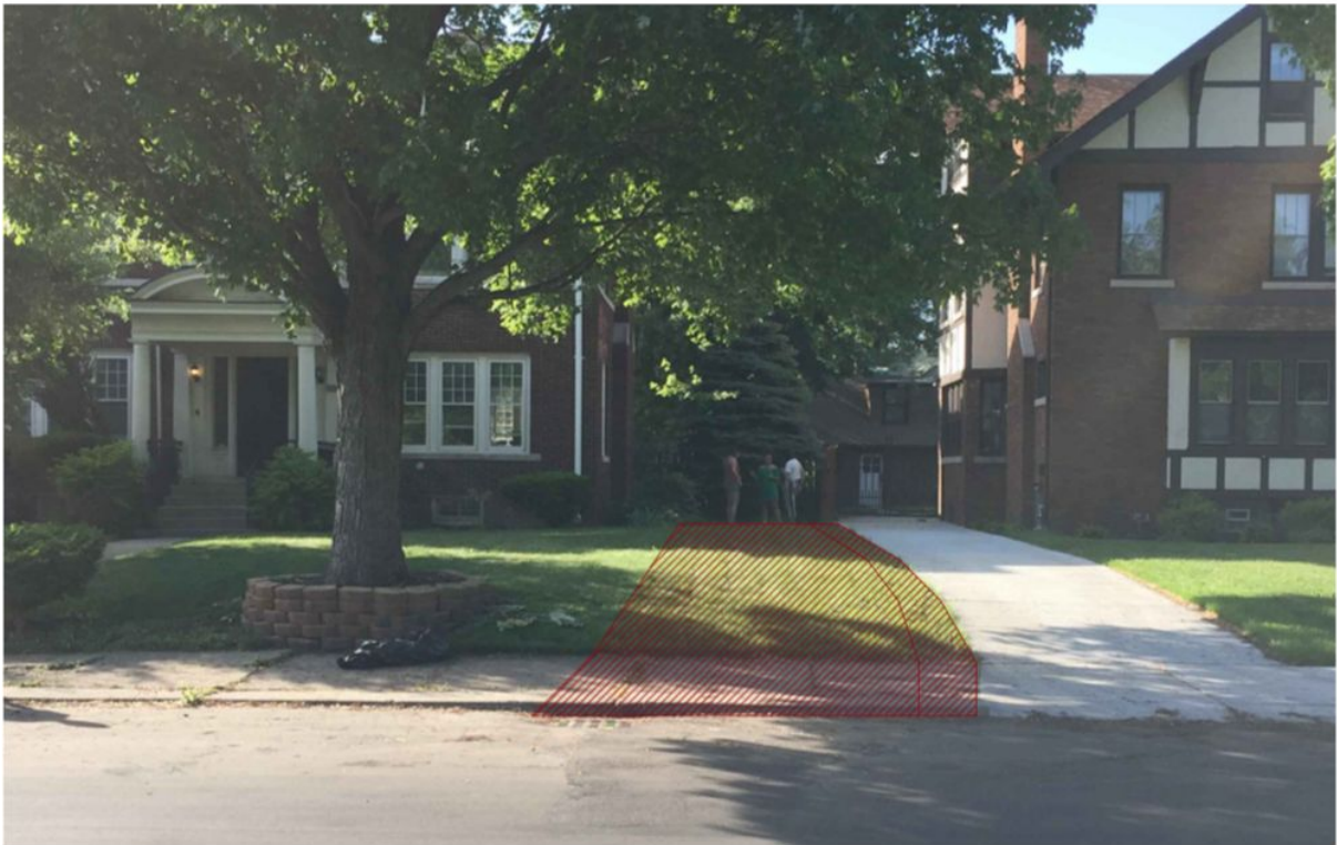
3 PROPOSED AREA OF WORK AS.101