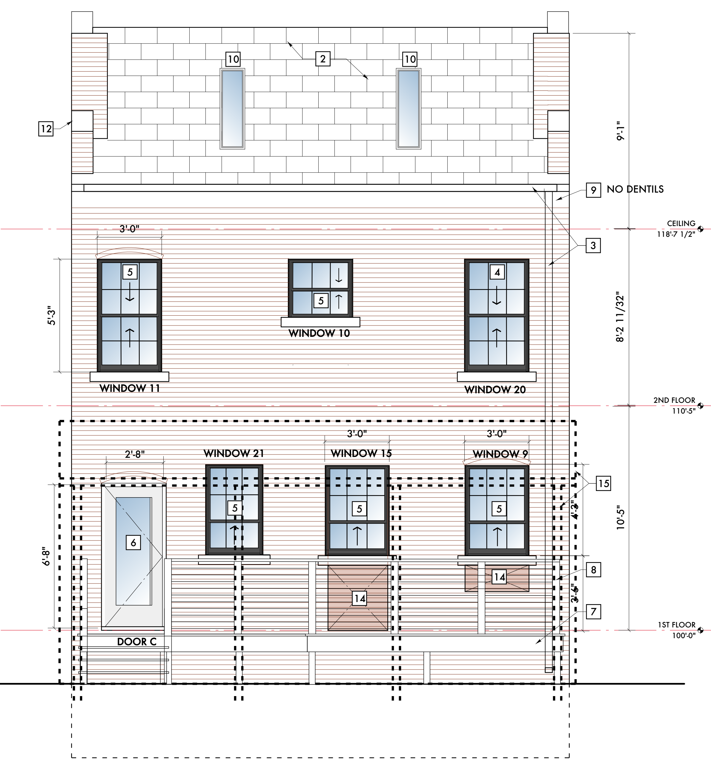
C PROPOSED NORTH ELEVATION SCALE: 3/8" = 1 - 0"