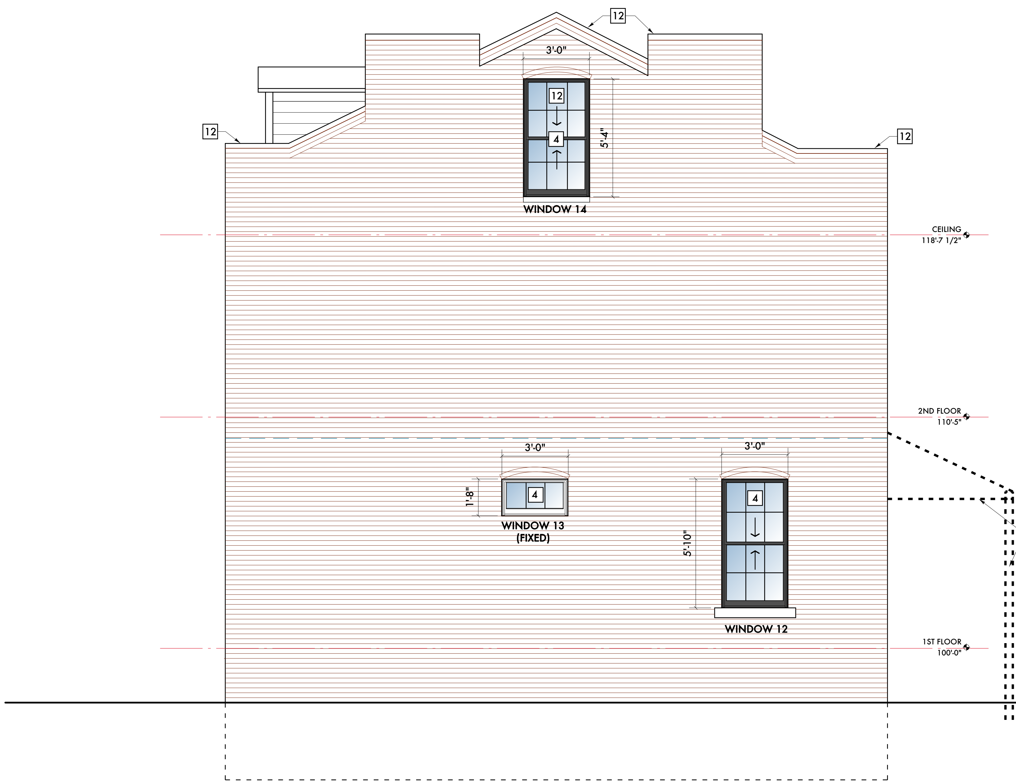
D PROPOSED EAST ELEVATION SCALE: 3/8" = 1 - 0"