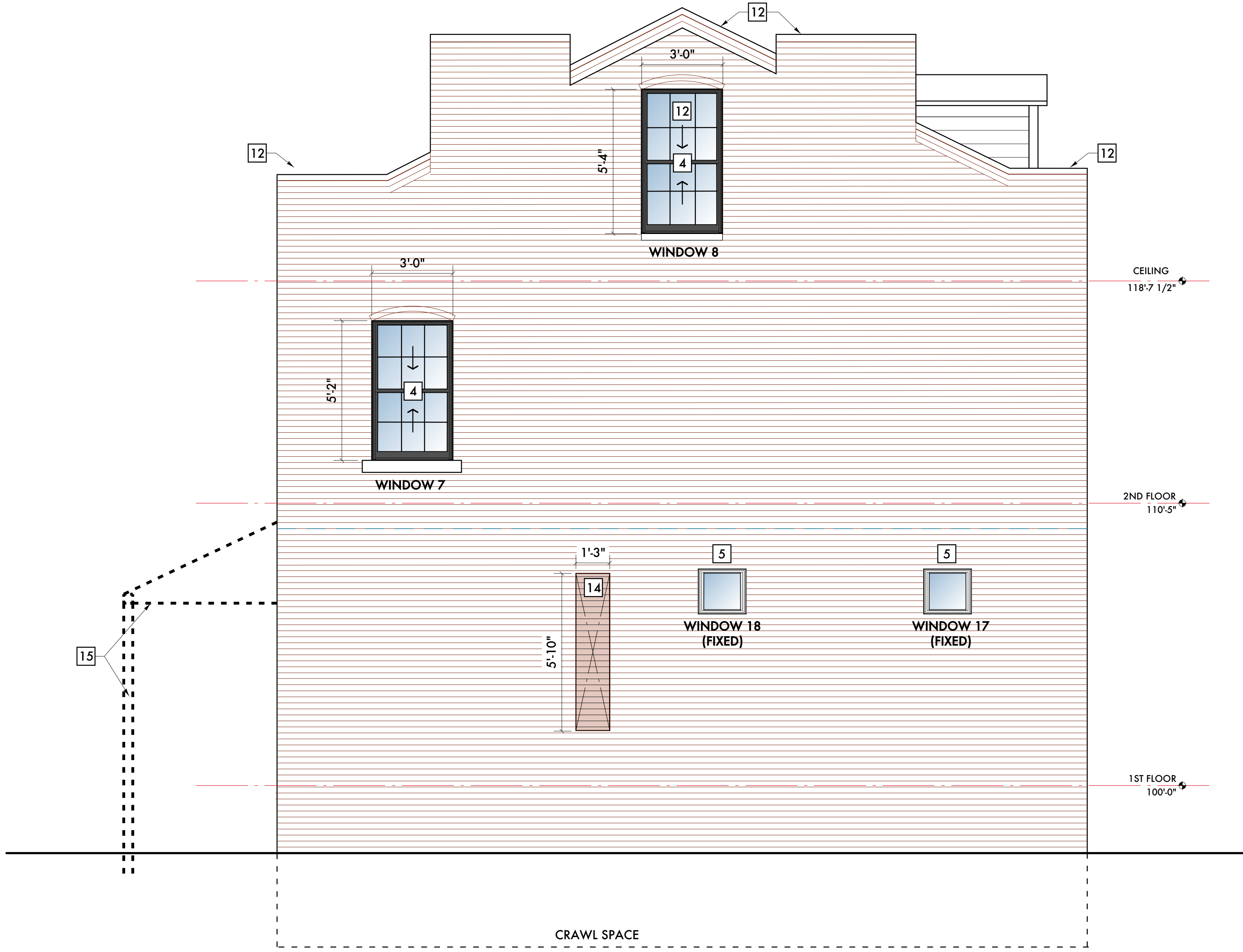
B PROPOSED WEST ELEVATION SCALE: 3/8" = 1 - 0"