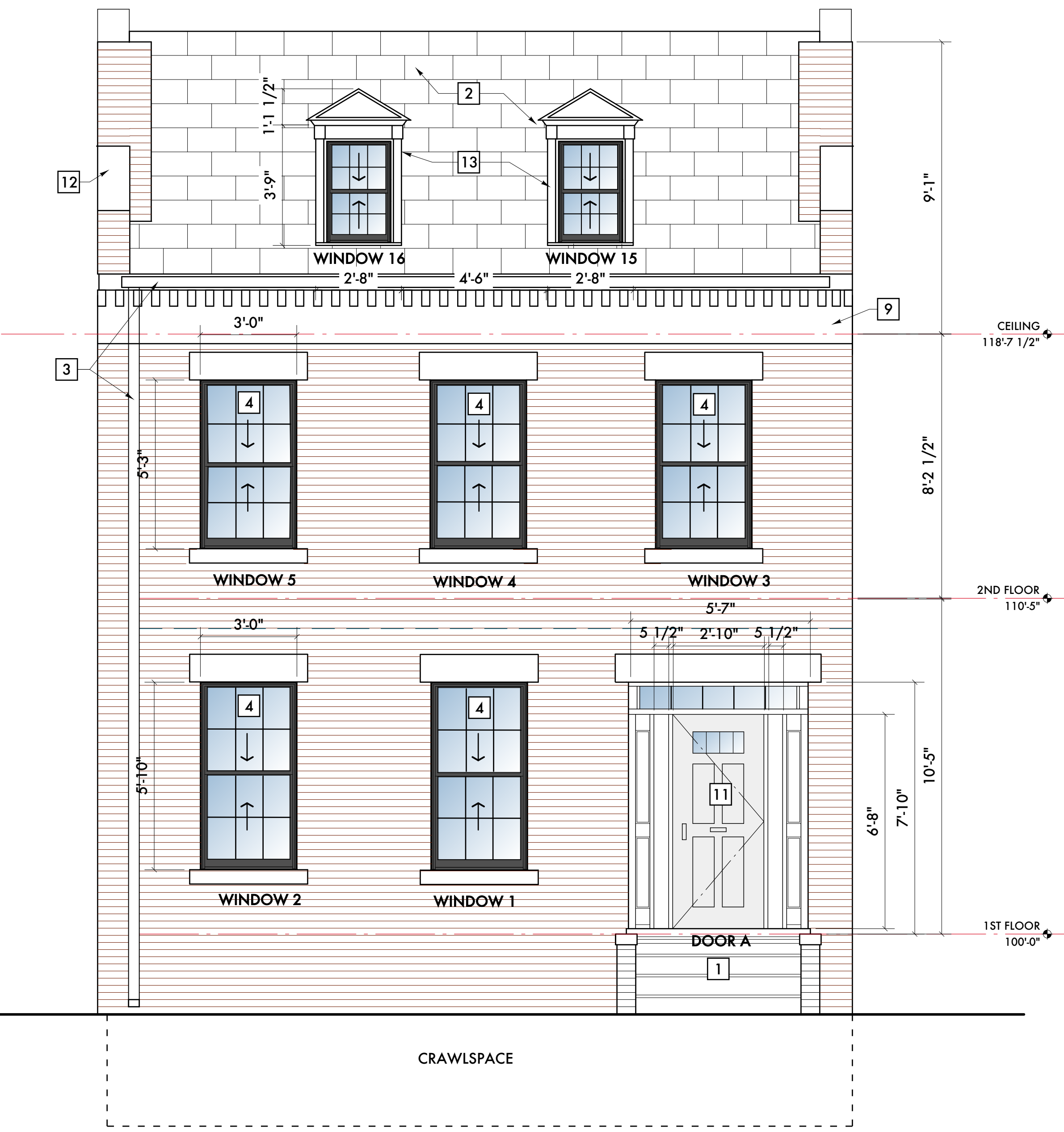
A PROPOSED LABROSSE ELEVATION (SOUTH) SCALE: 3/8" = 1 - 0"