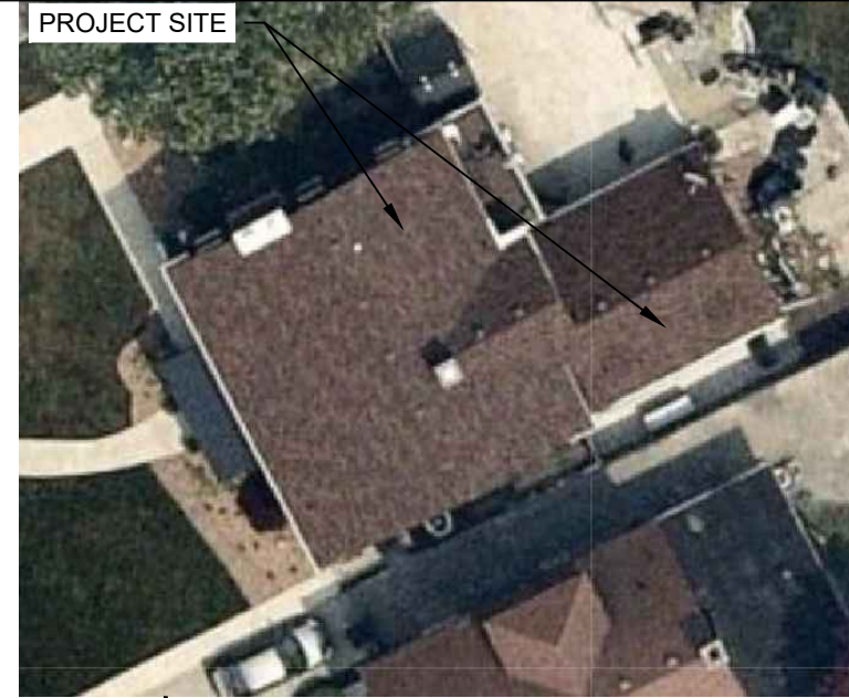
2 HOUSE PHOTO PV-1 | SCALE: NTS

OCCUPANCY : II CONSTRUCTION : SINGLE-FAMILY ZONING : RESIDENTIAL GROUND SNOW LOAD : SEE STRUCTURAL LETTER WIND EXPOSURE : SEE STRUCTURAL LETTER WIND SPEED : SEE STRUCTURAL LETTER