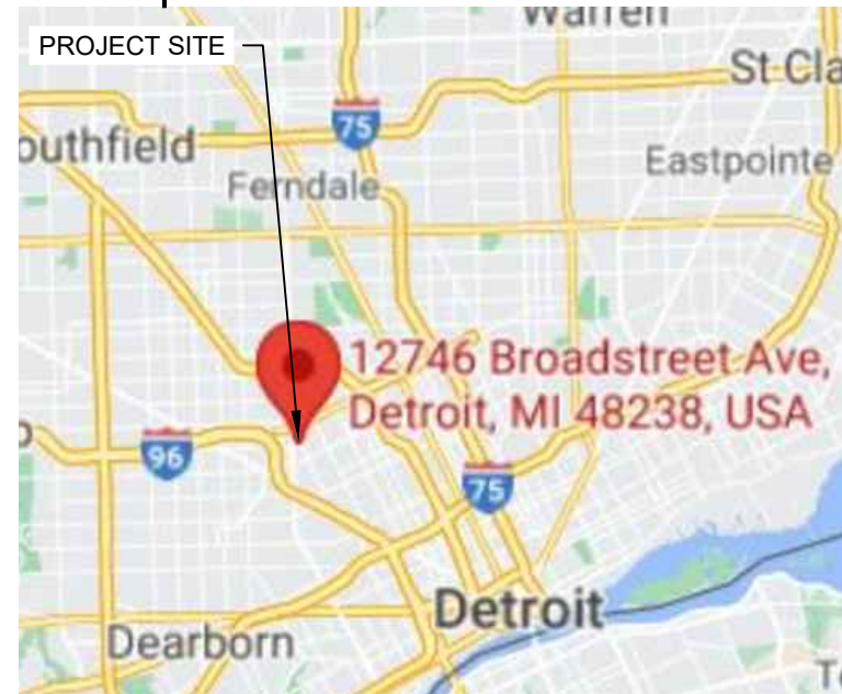
3 VICINITY MAP PV-1 | SCALE: NTS