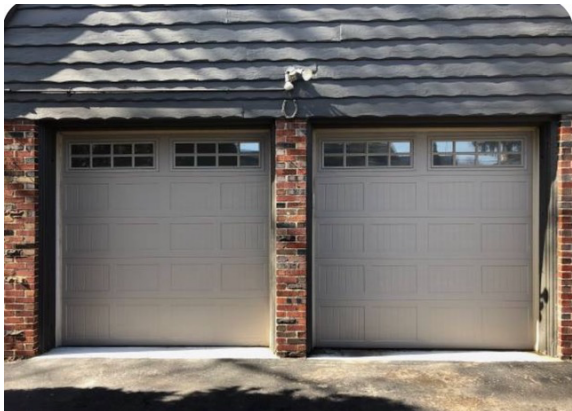
Figure 1 8x8 Carriage doors proposed.