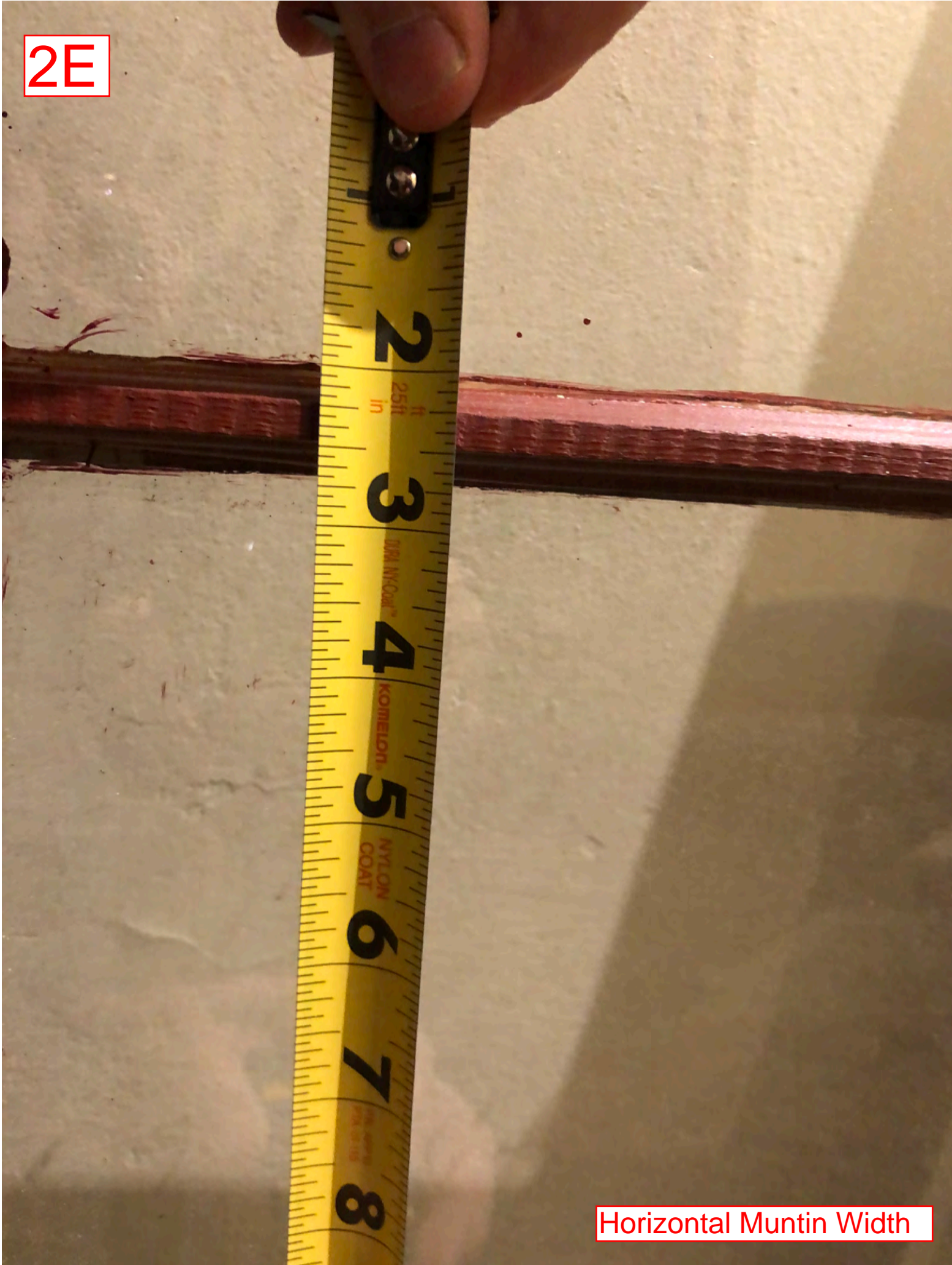
Horizontal Muntin Width