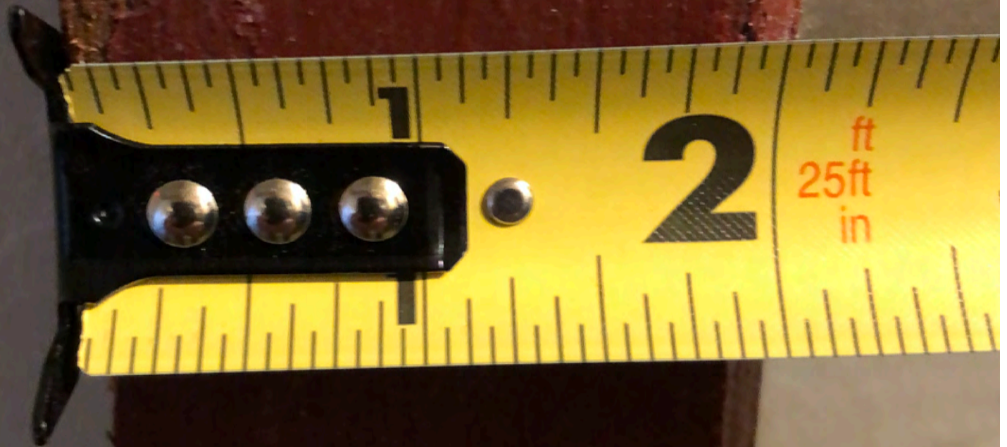
Width of Left Side of Sash