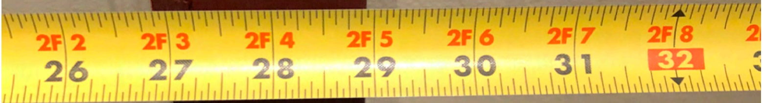
Width of Right Side of Sash