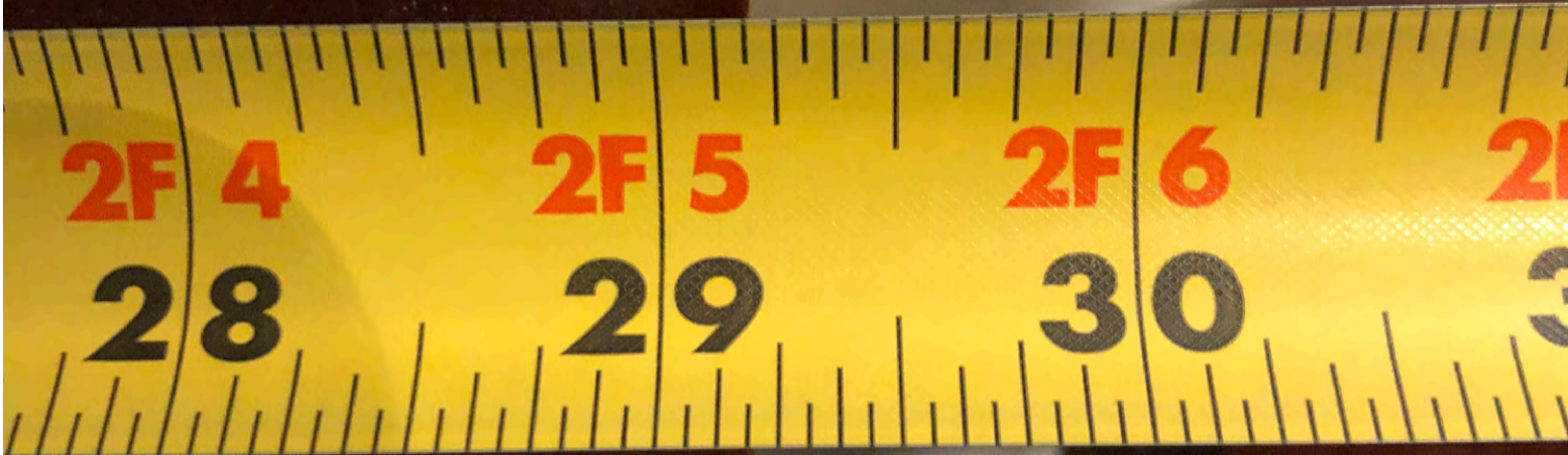
Window Sash Width Close-Up