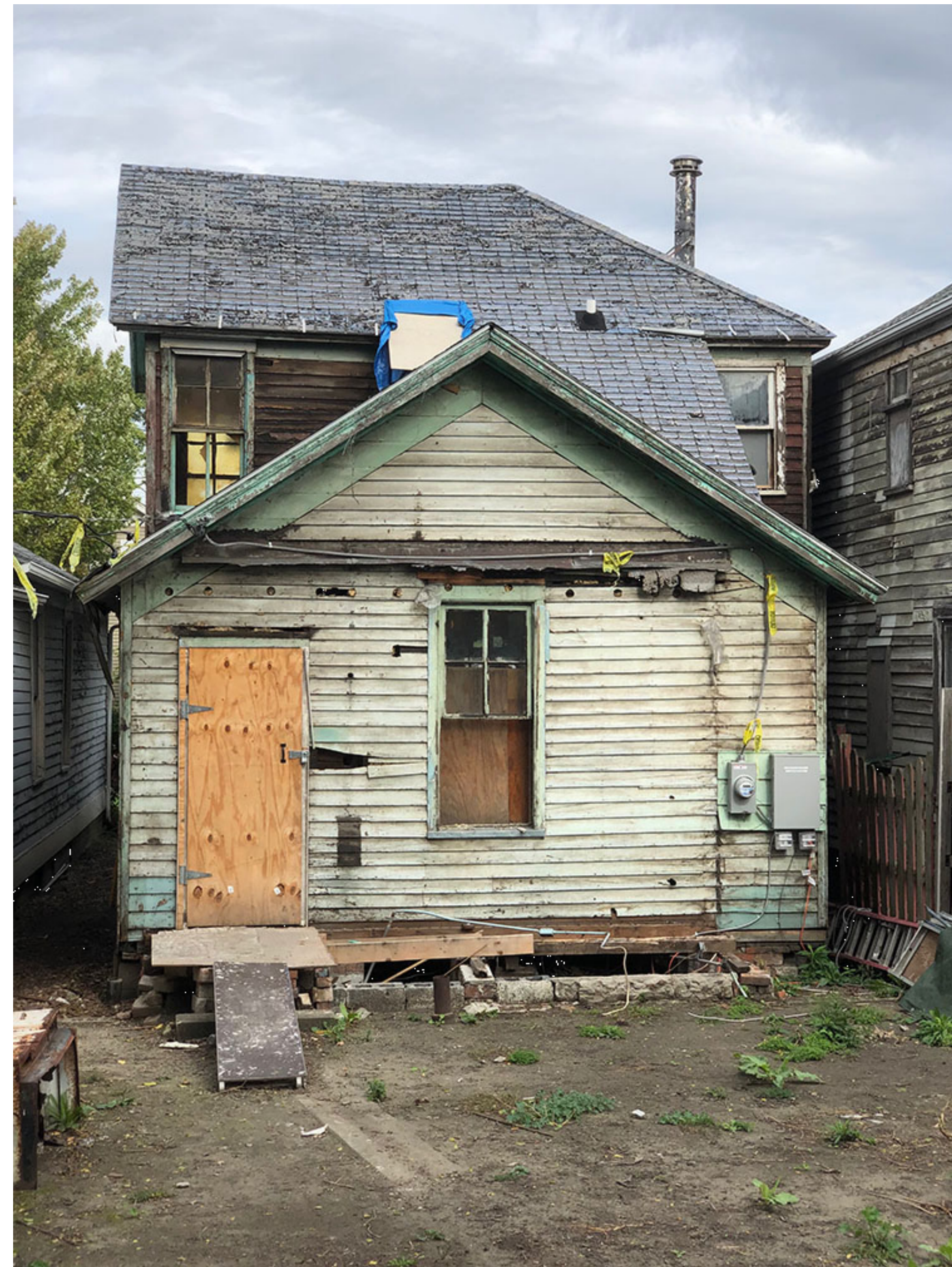
D EXISTING REAR ELEVATION SCALE: 1/2" = 1'-0"