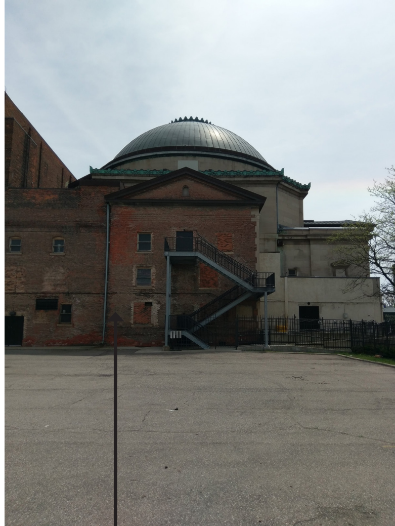
BRICK FACADE TO BE CLEANED