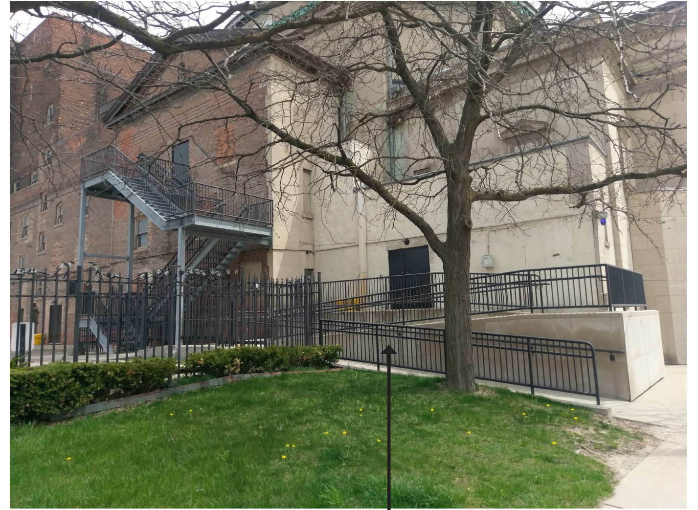
RAMP TO BE REMOVED AND REPLACED BY LIFT