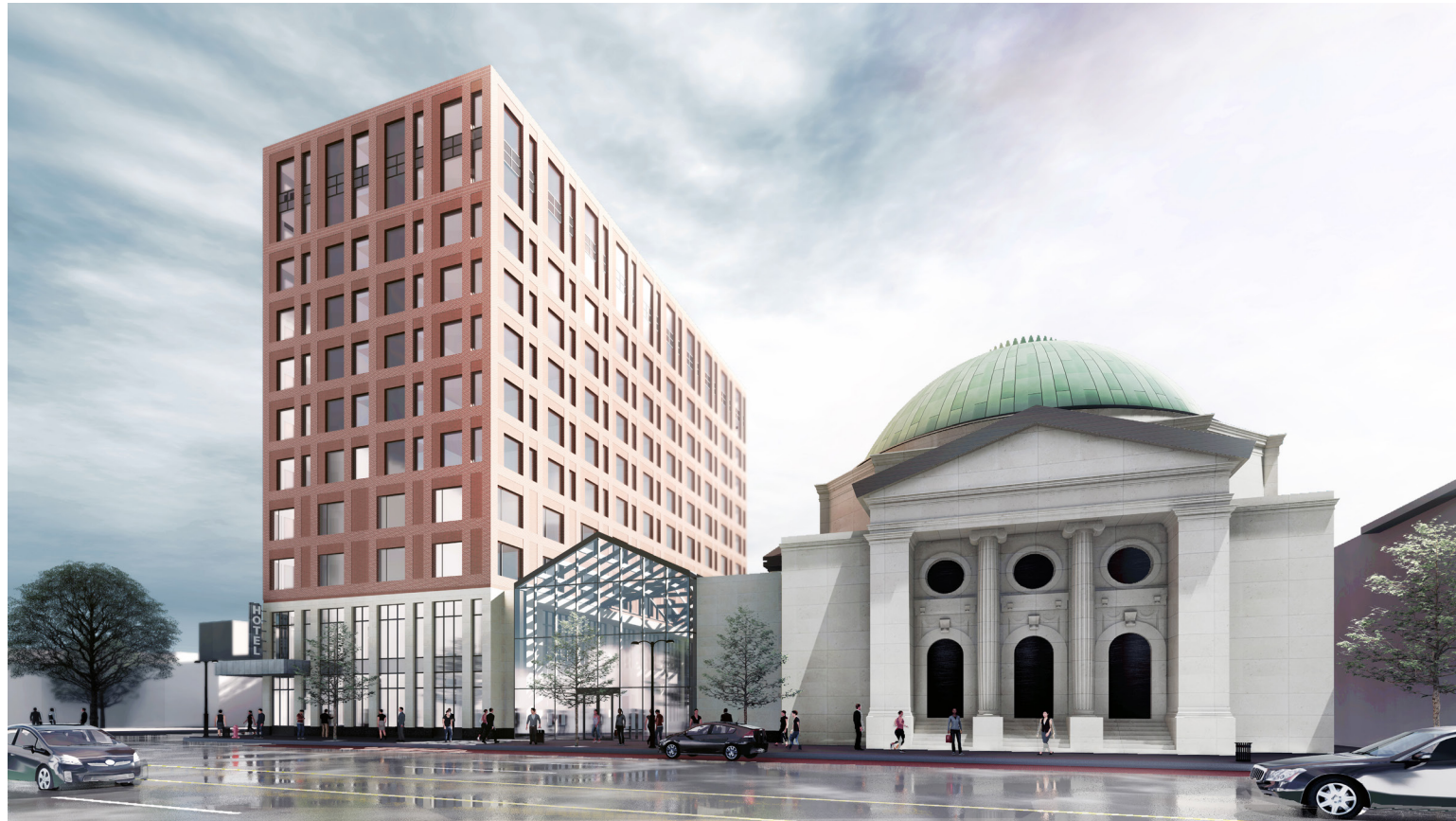
Schematic Design - West Elevation