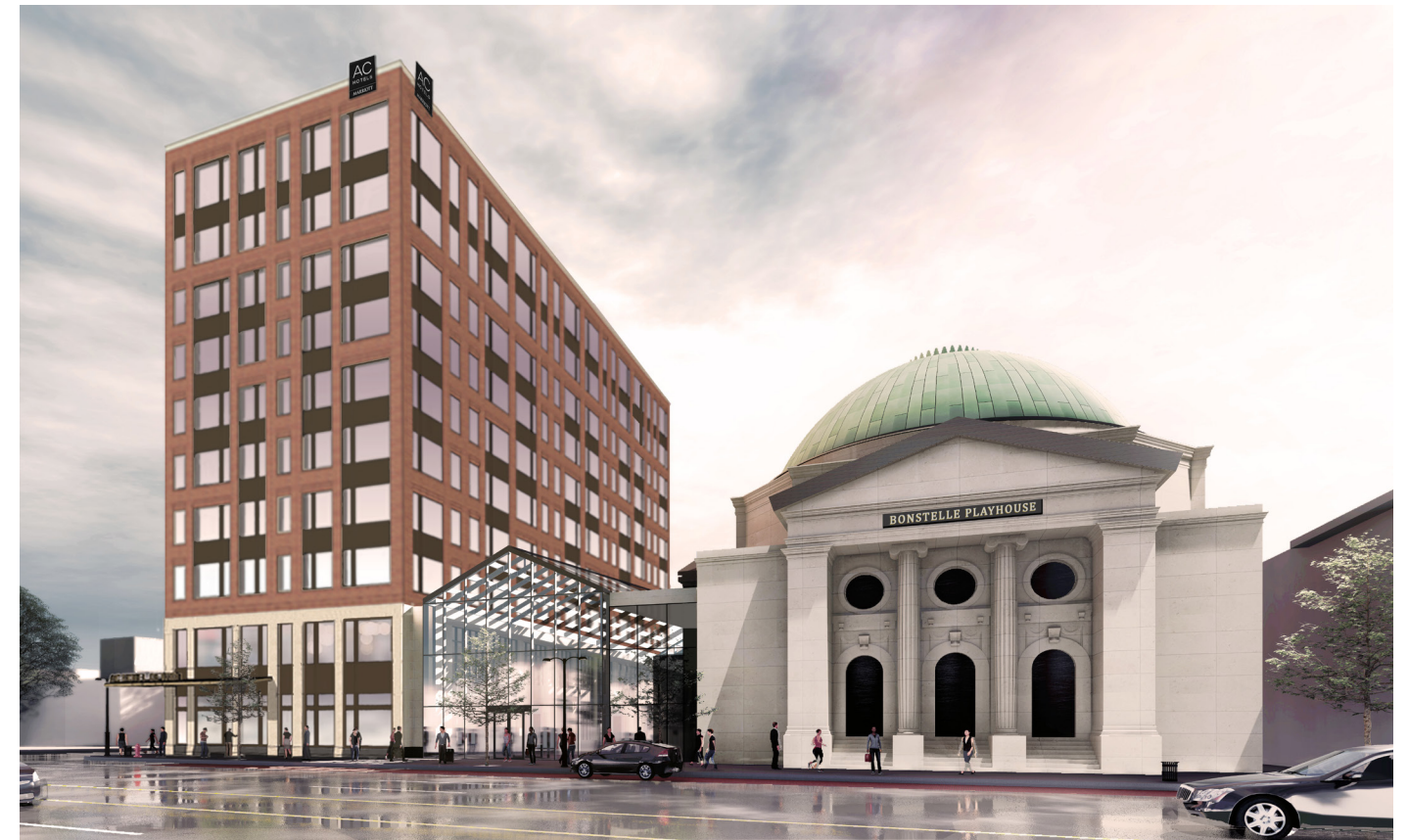
Permit Set - West Elevation