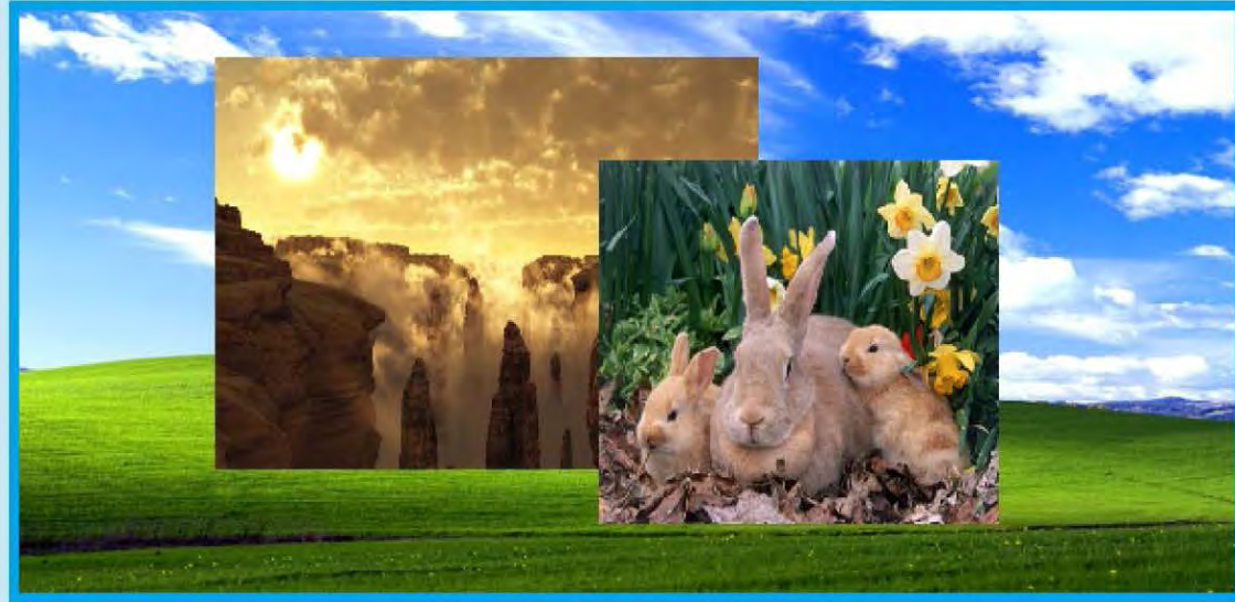
LED DISPLAY SCREEN