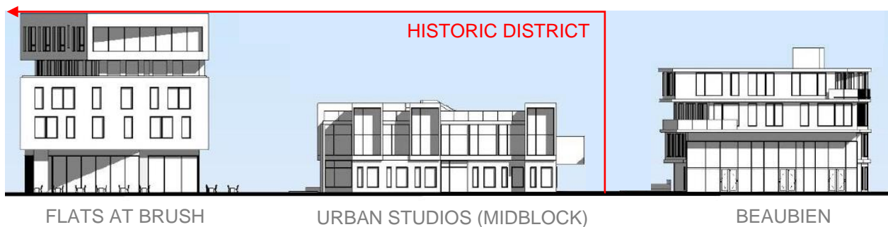
SOUTH ELEVATION (as approved by HDC)

On September 18, 2018, the Historic District Commission (“HDC”) issued a Certificate of Appropriateness for The Flats at Brush and Urban Studios (Midblok). On the same date, the HDC also issued an advisory opinion on the third building known as Beaubien stating that the HDC “determined that the proposed development will have the potential to be beneficial and have a positive effect on the adjacent Brush Park Historic District.”