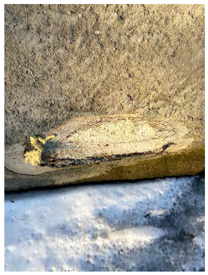
STUCCO DETERIORATION AT SOUTH ELEVATION