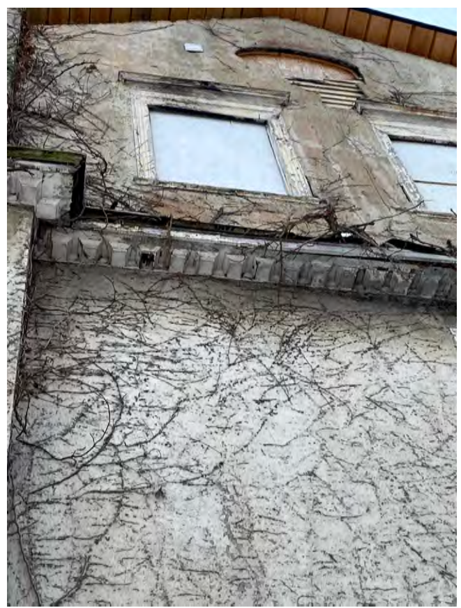
STUCCO DETERIORATION AT NORTH FACCADE