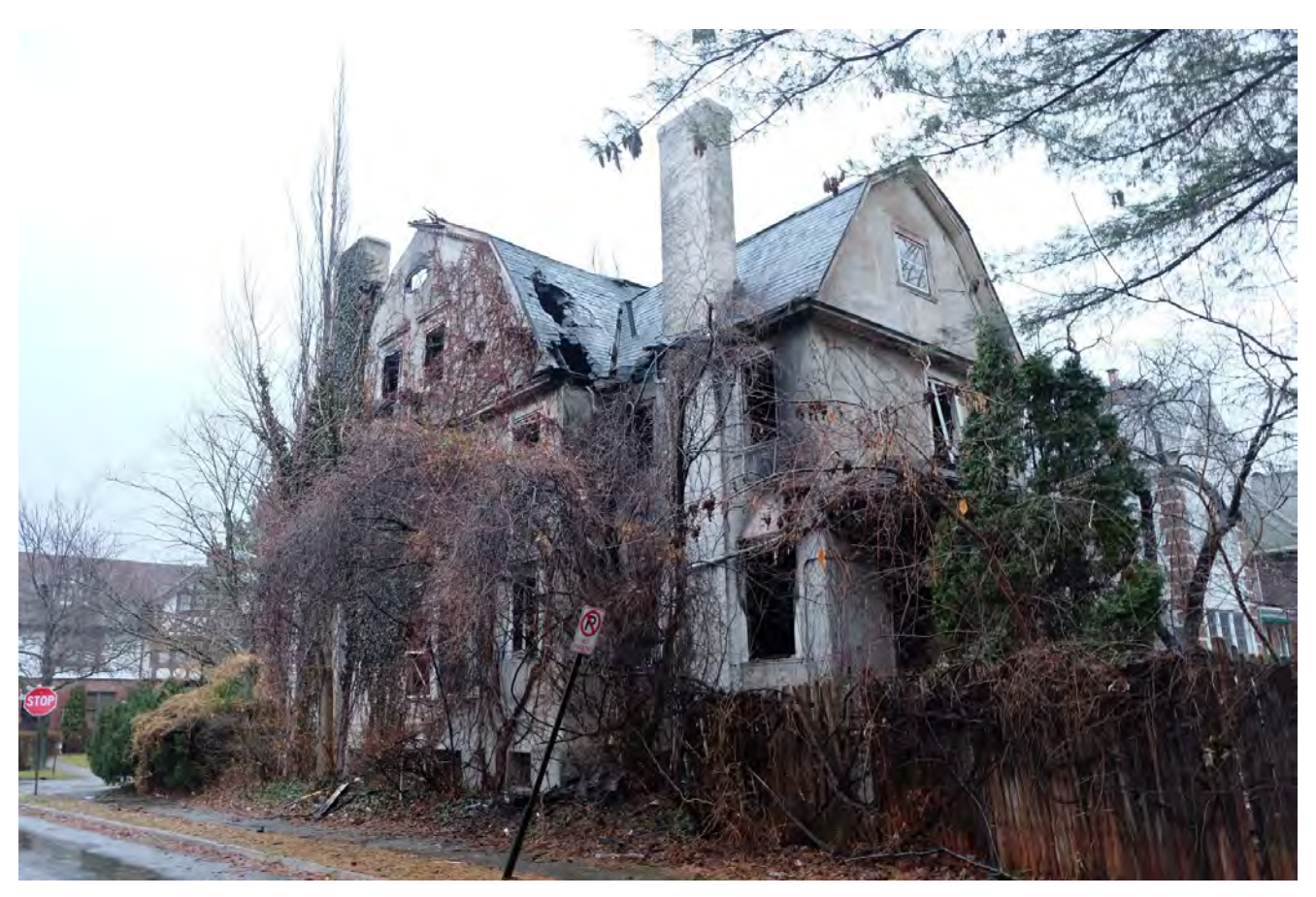
FEBRUARY 21, 2018