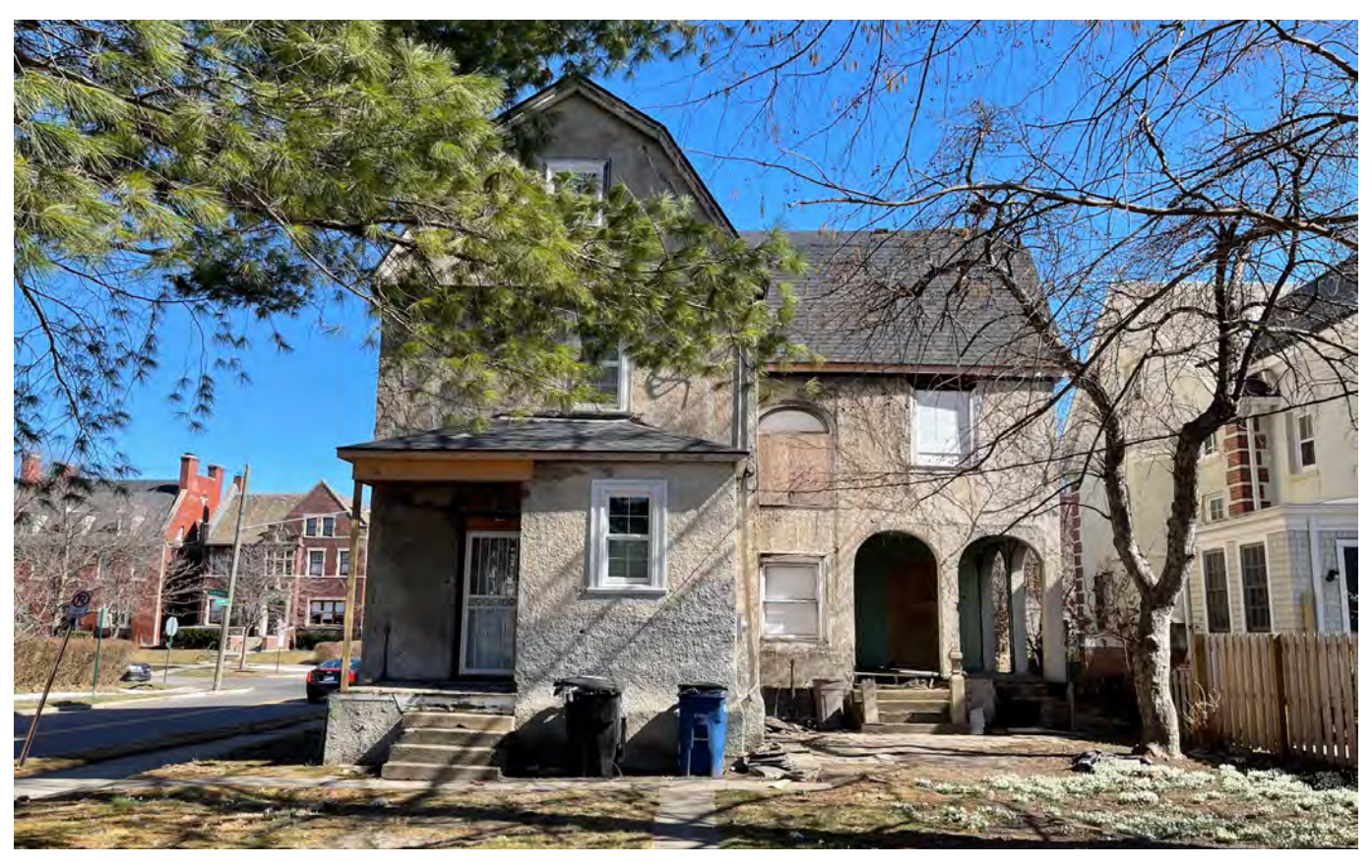
WEST ELEVATION (ALLEY SIDE)