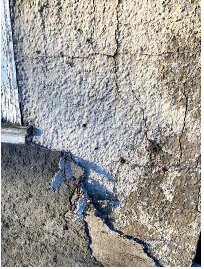
STUCCO DETERIORATION AT EAST FACADE