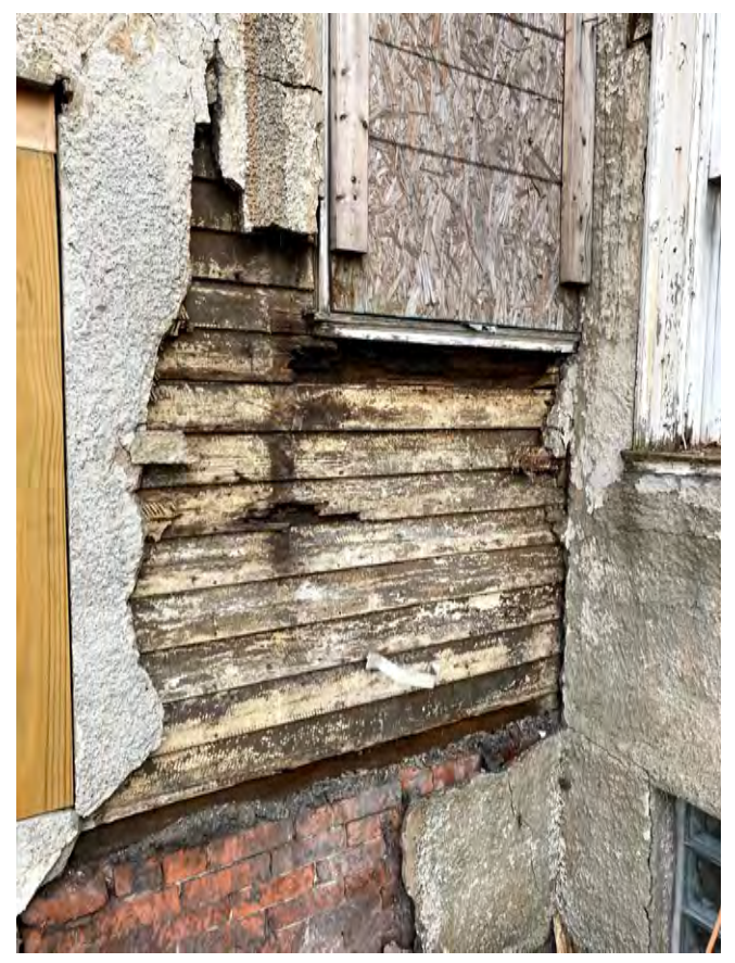
STUCCO DETERIORATION AT WEST ELEVATION, FIRST FLOOR