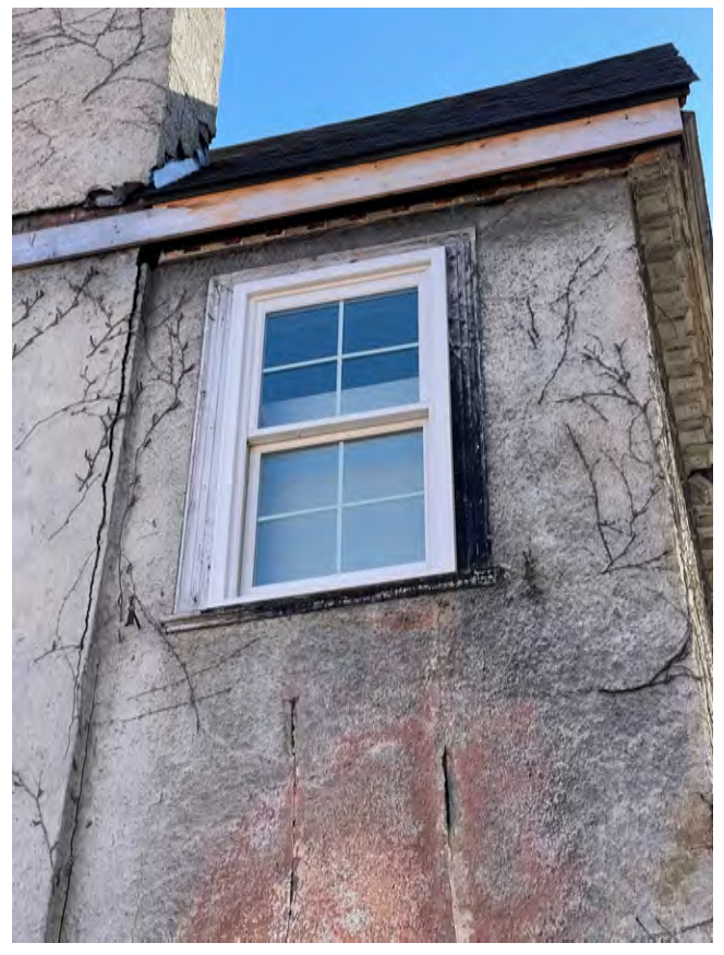
STUCCO DETERIORATION AT NORTH FACADE