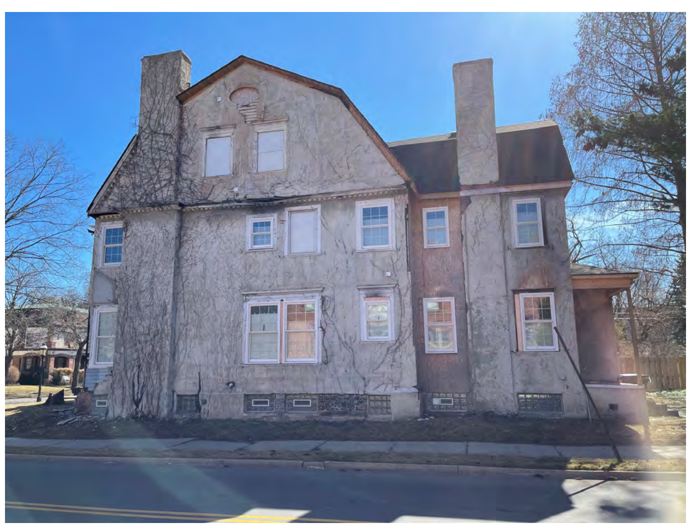
NORTH ELEVATION (EAST LAFAYETTE BLVD)