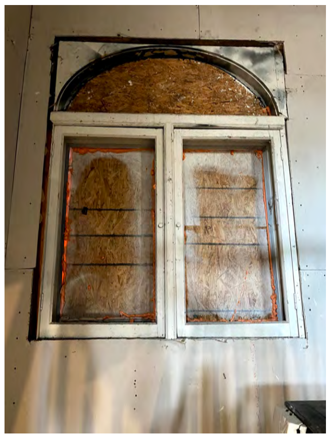
WINDOW #33, 34, & 35