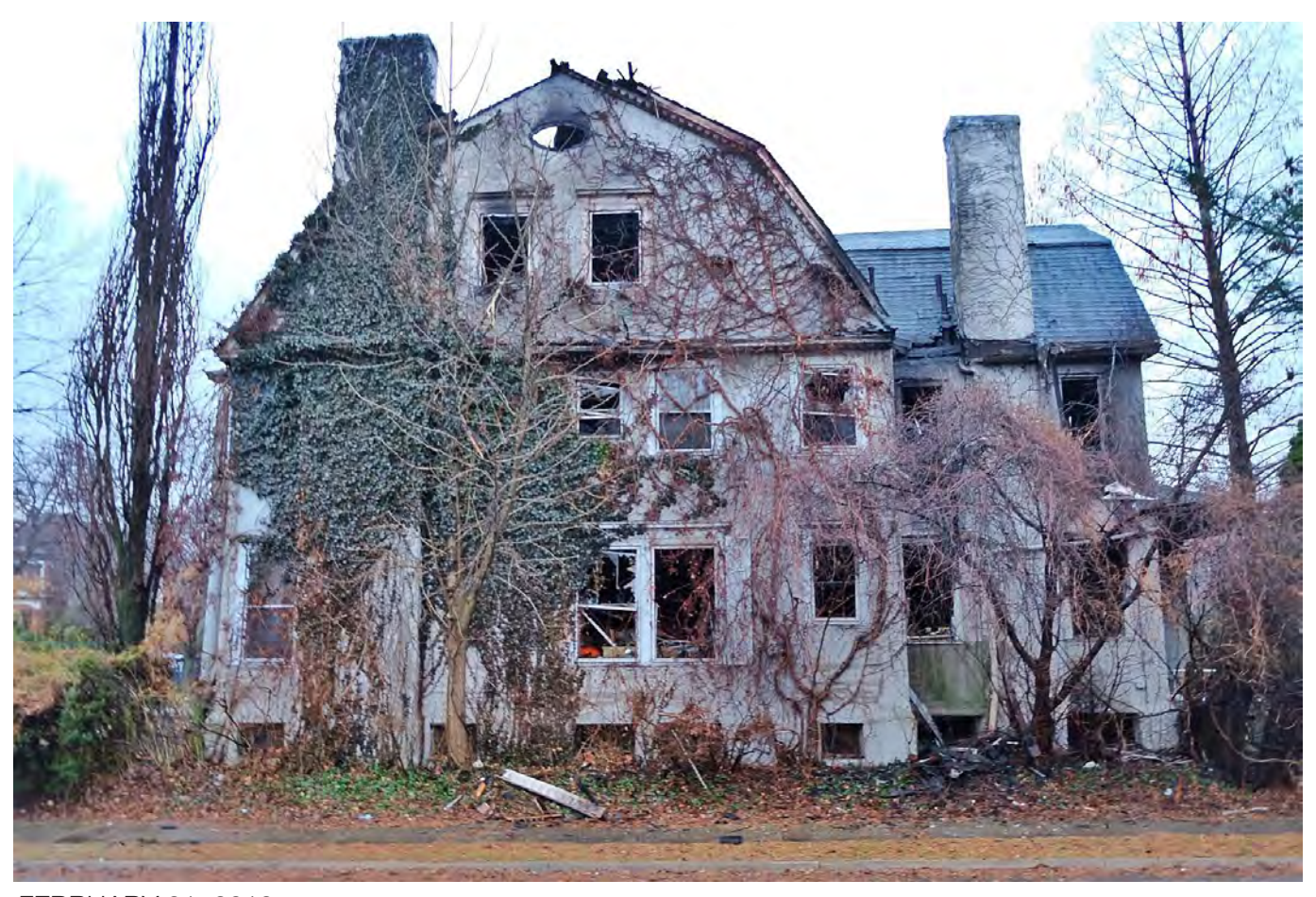
FEBRUARY 21, 2018