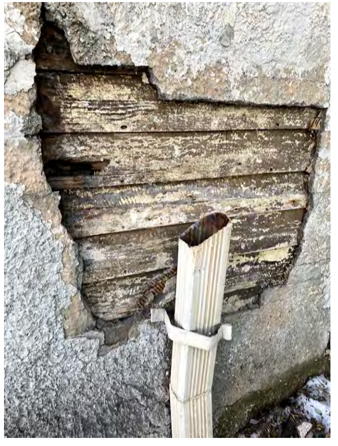
STUCCO DETERIORATION AT SW CORNER OF BUILDING