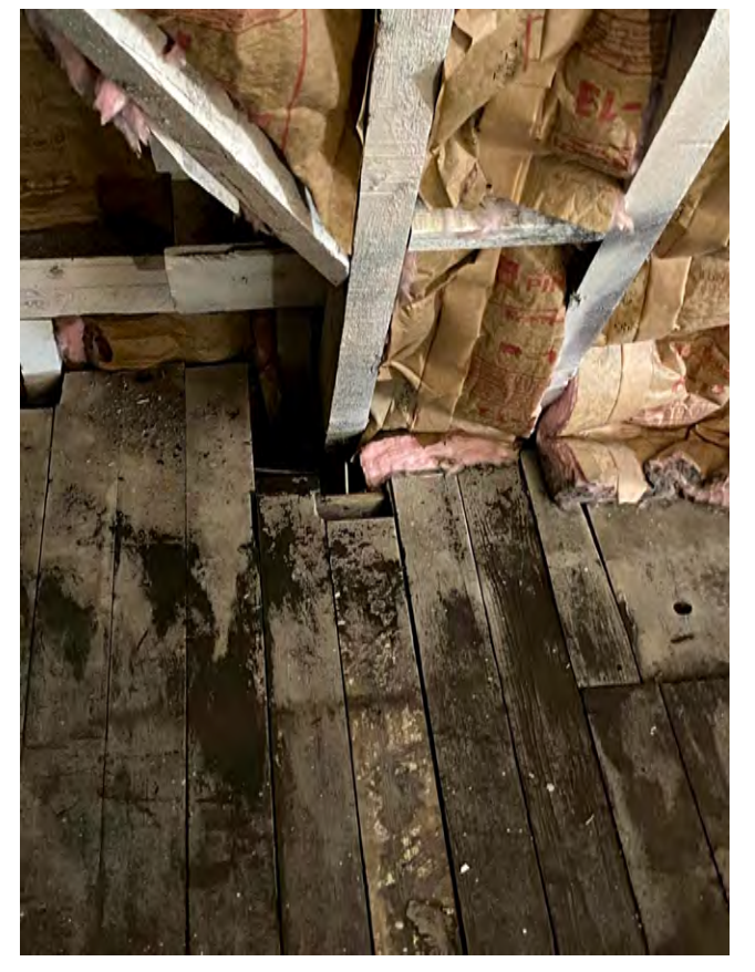
GAPS IN STRUCTURE CAUSED BY STUCCO WEIGHT