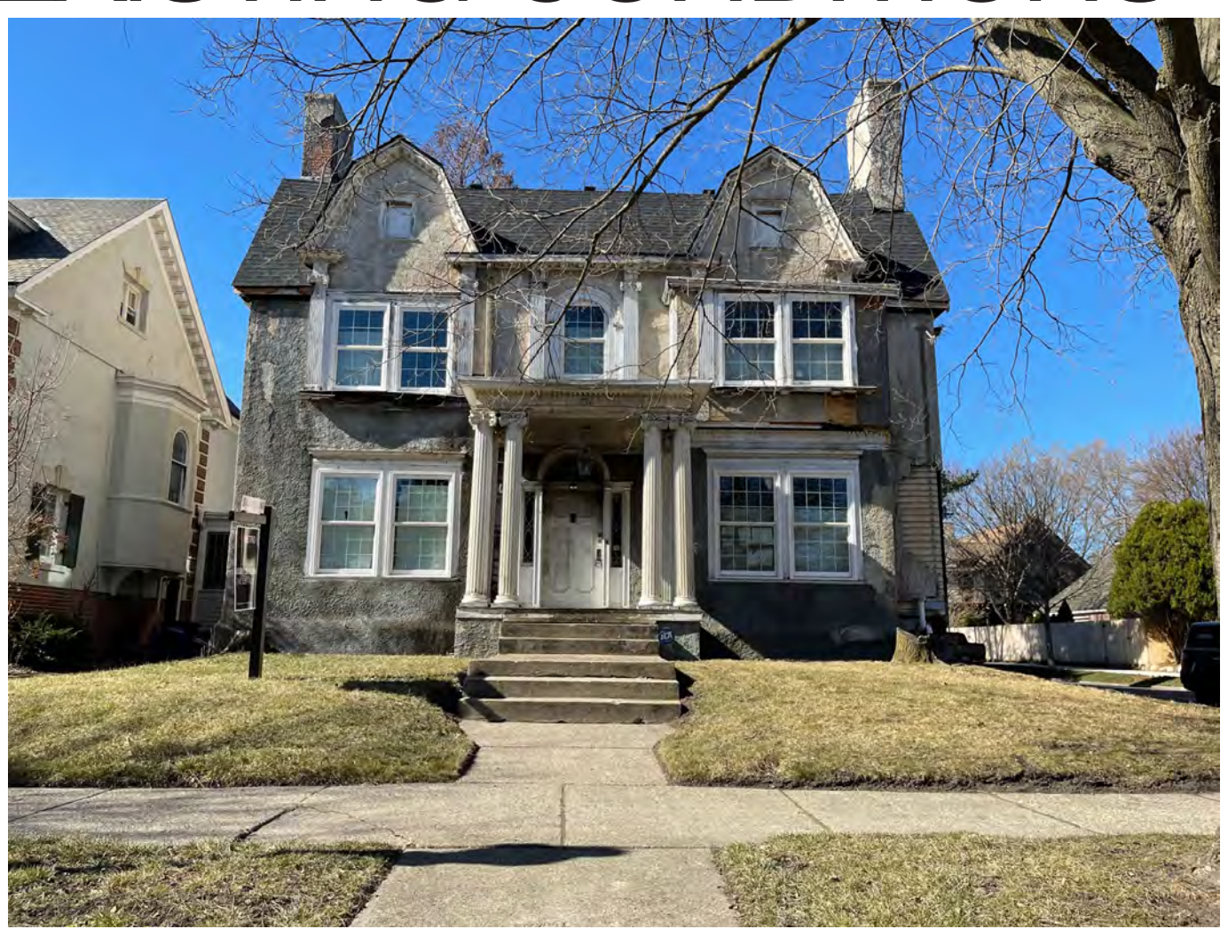
EAST ELEVATION (SEMINOLE AVENUE)