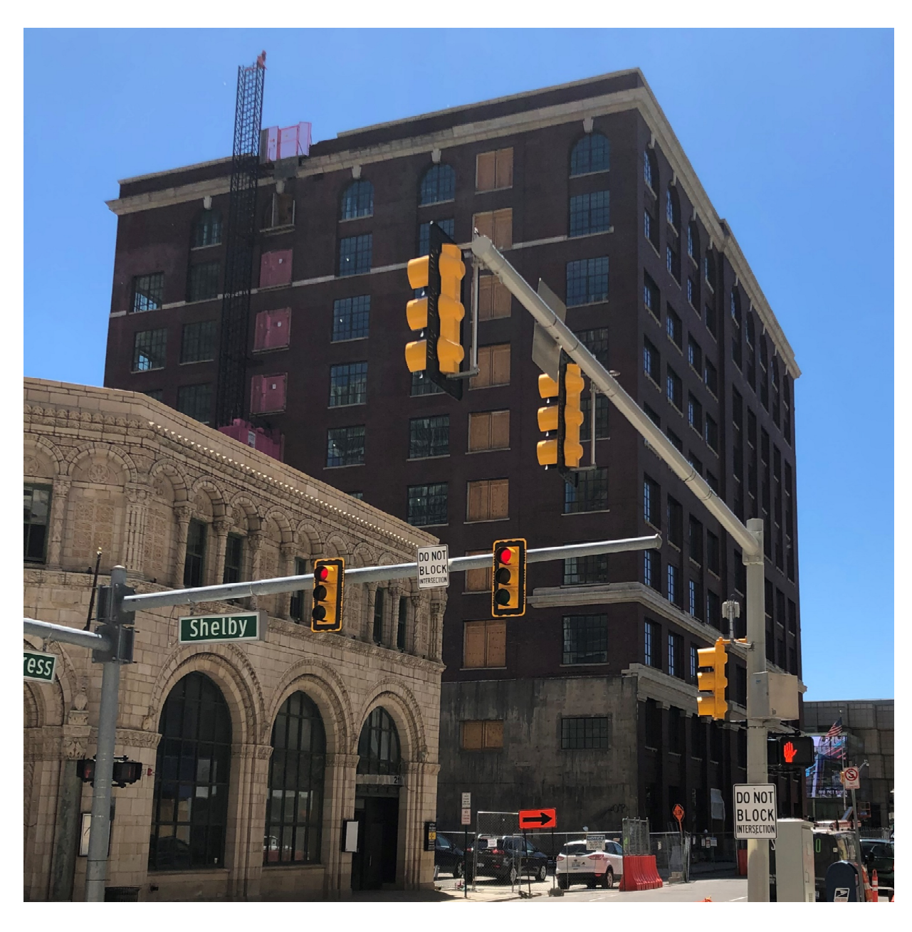
East and North Elevations looking sw (during construction)