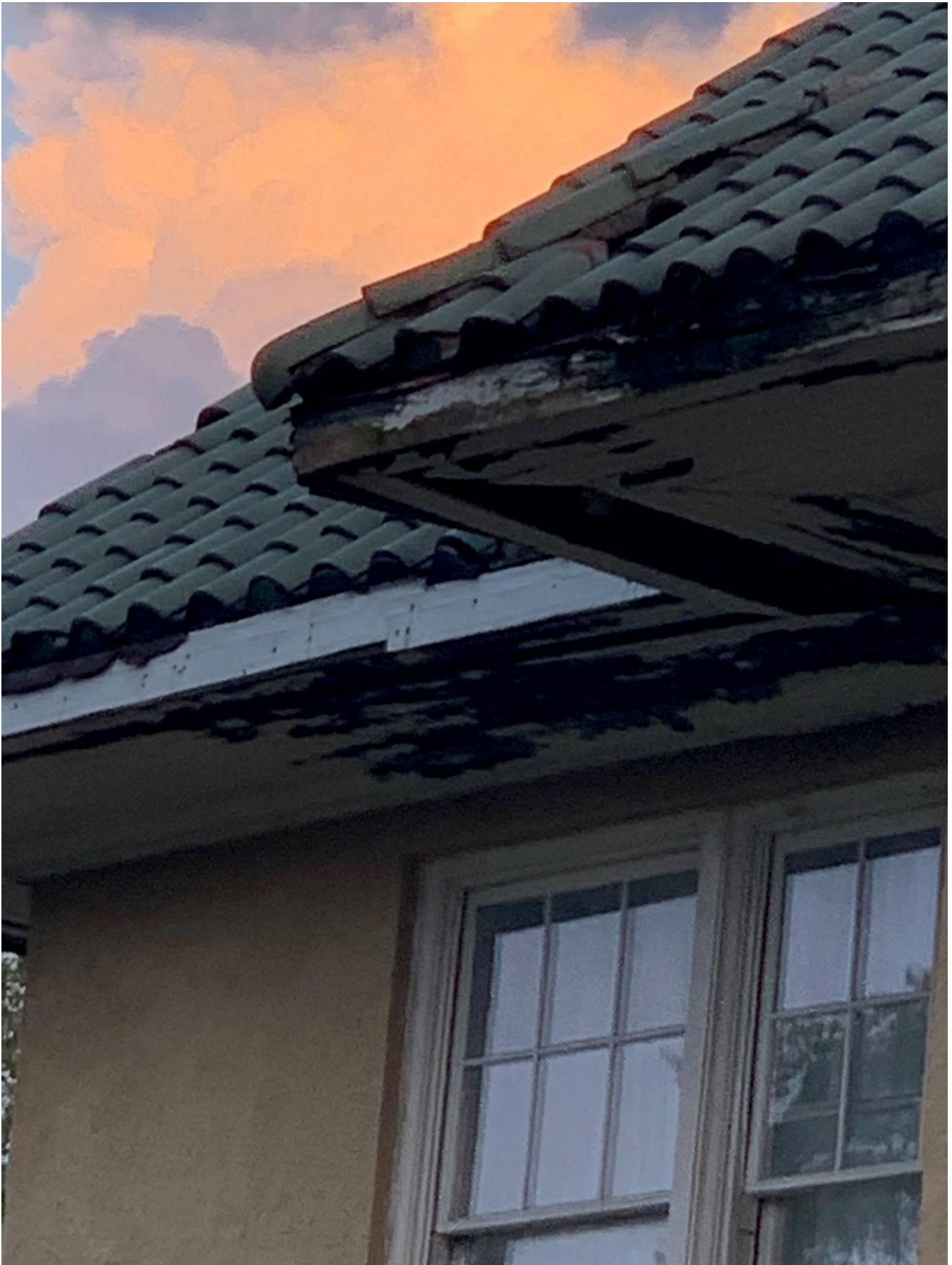
Roof 2 9-10