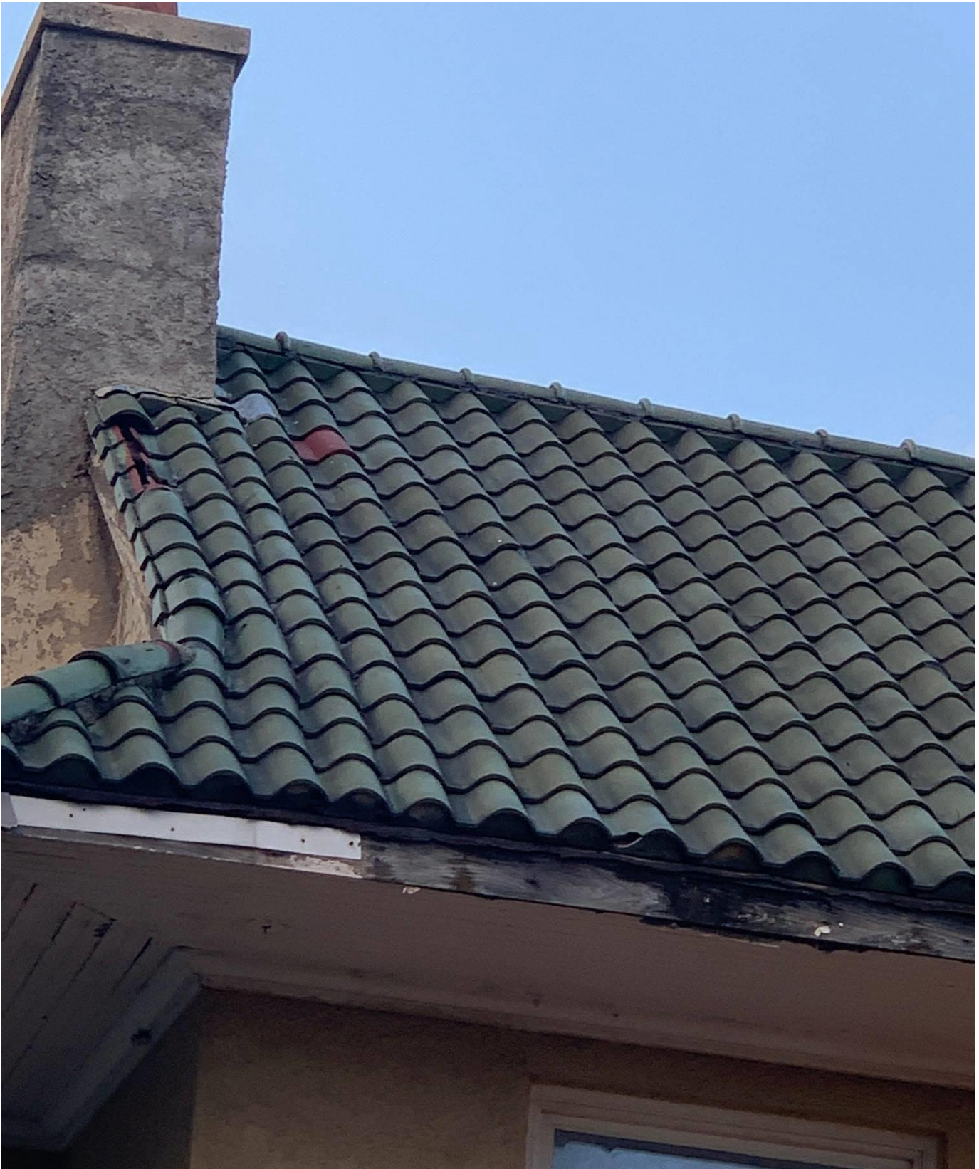
Soffit Chimney 9-10