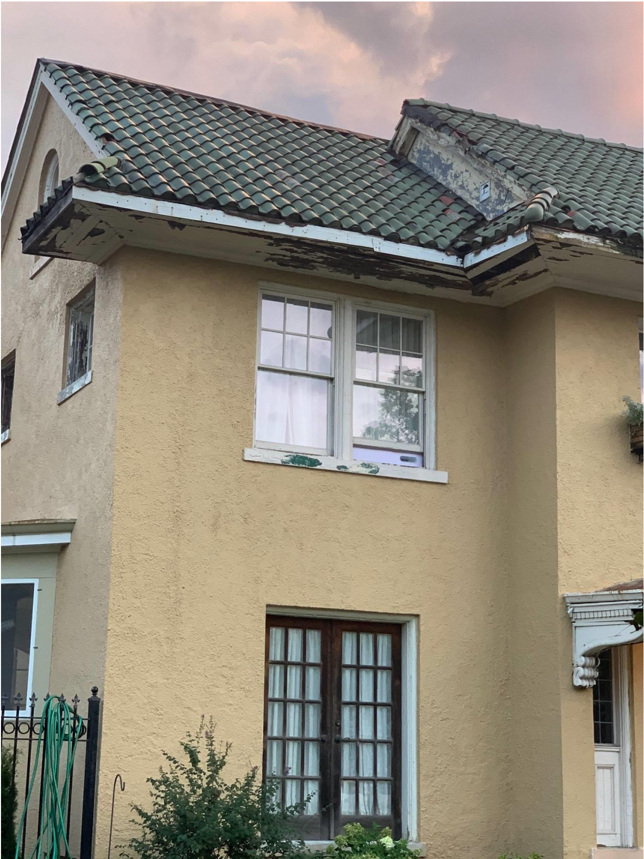
Front 3 9-10