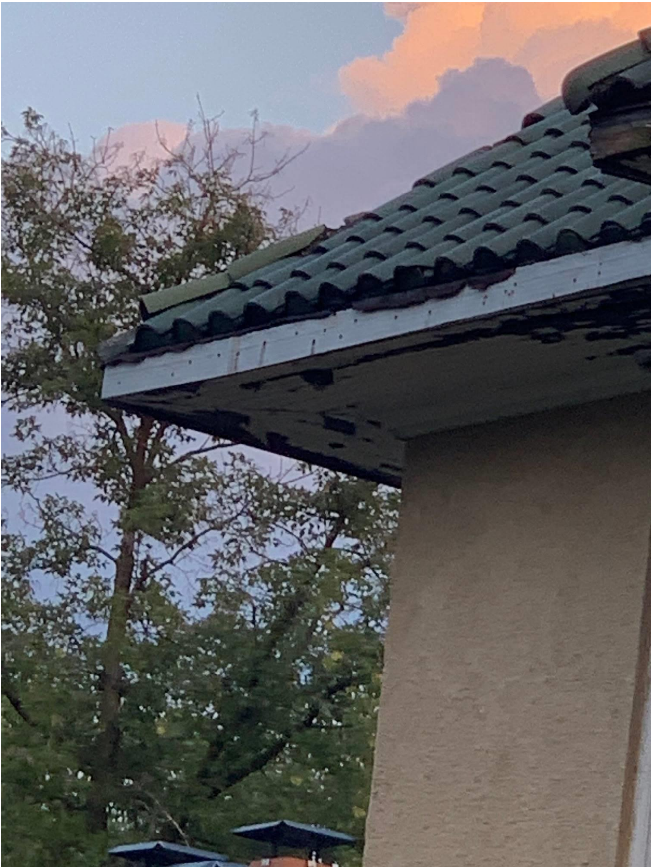
Roof Overhang 9-10