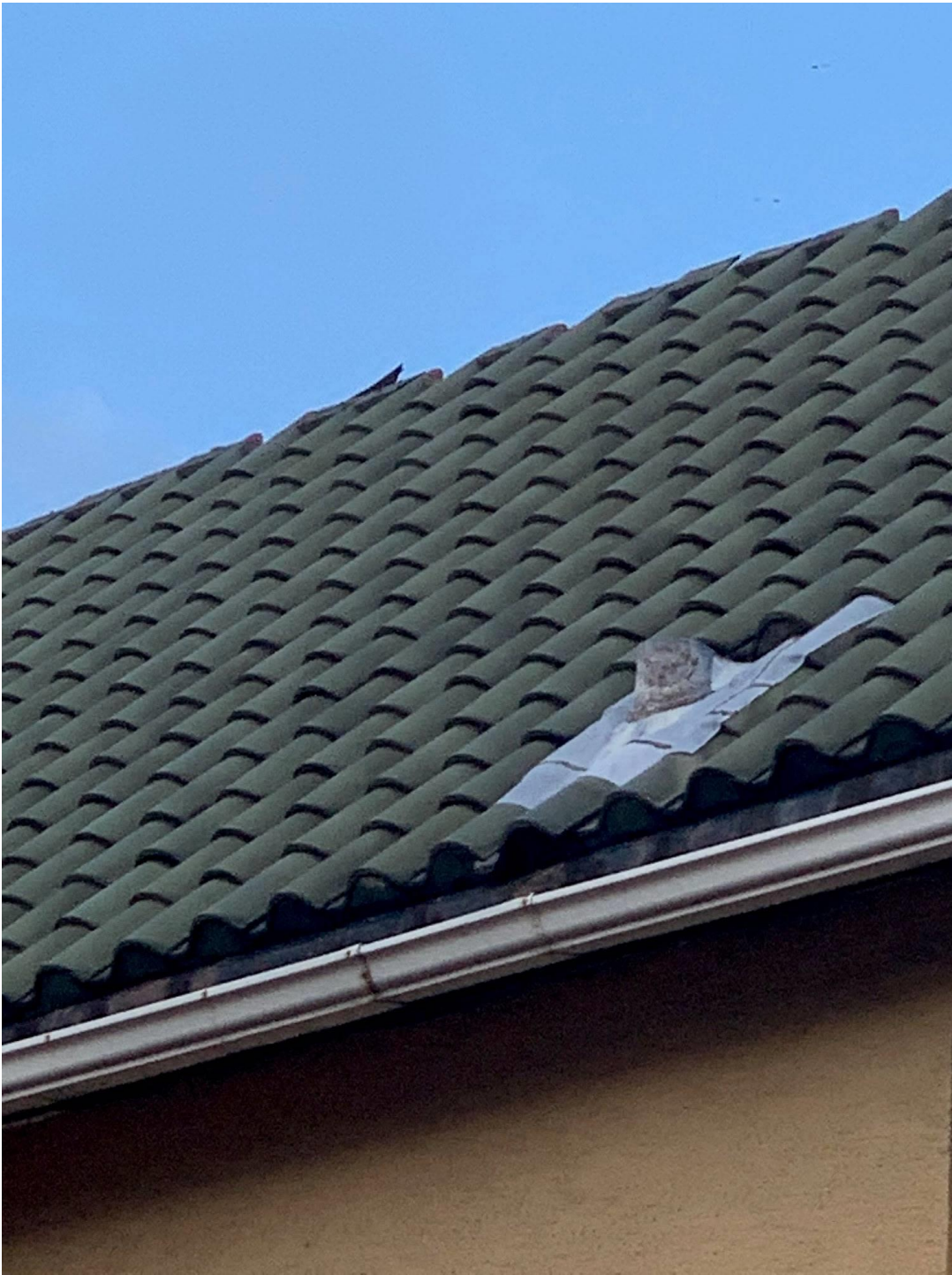
Missing Tile 9-10