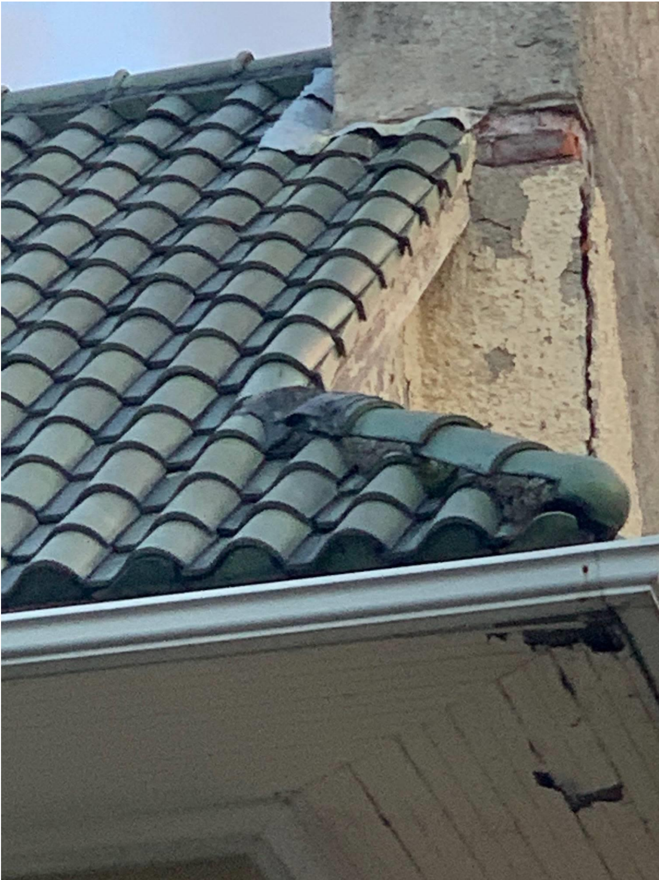
Missing Tile Detail 3 9-10