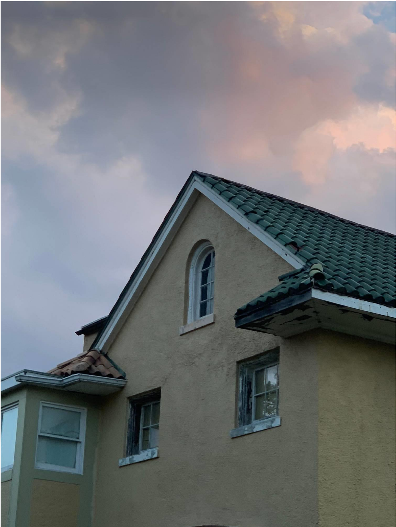
Gable Side 9-10