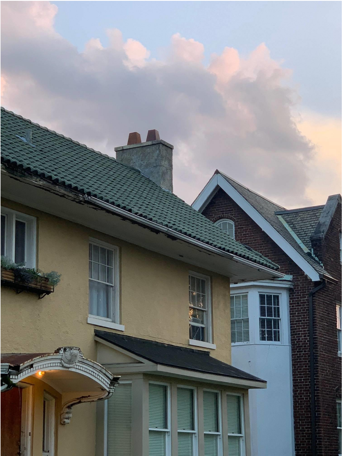
Front Angle 9-10