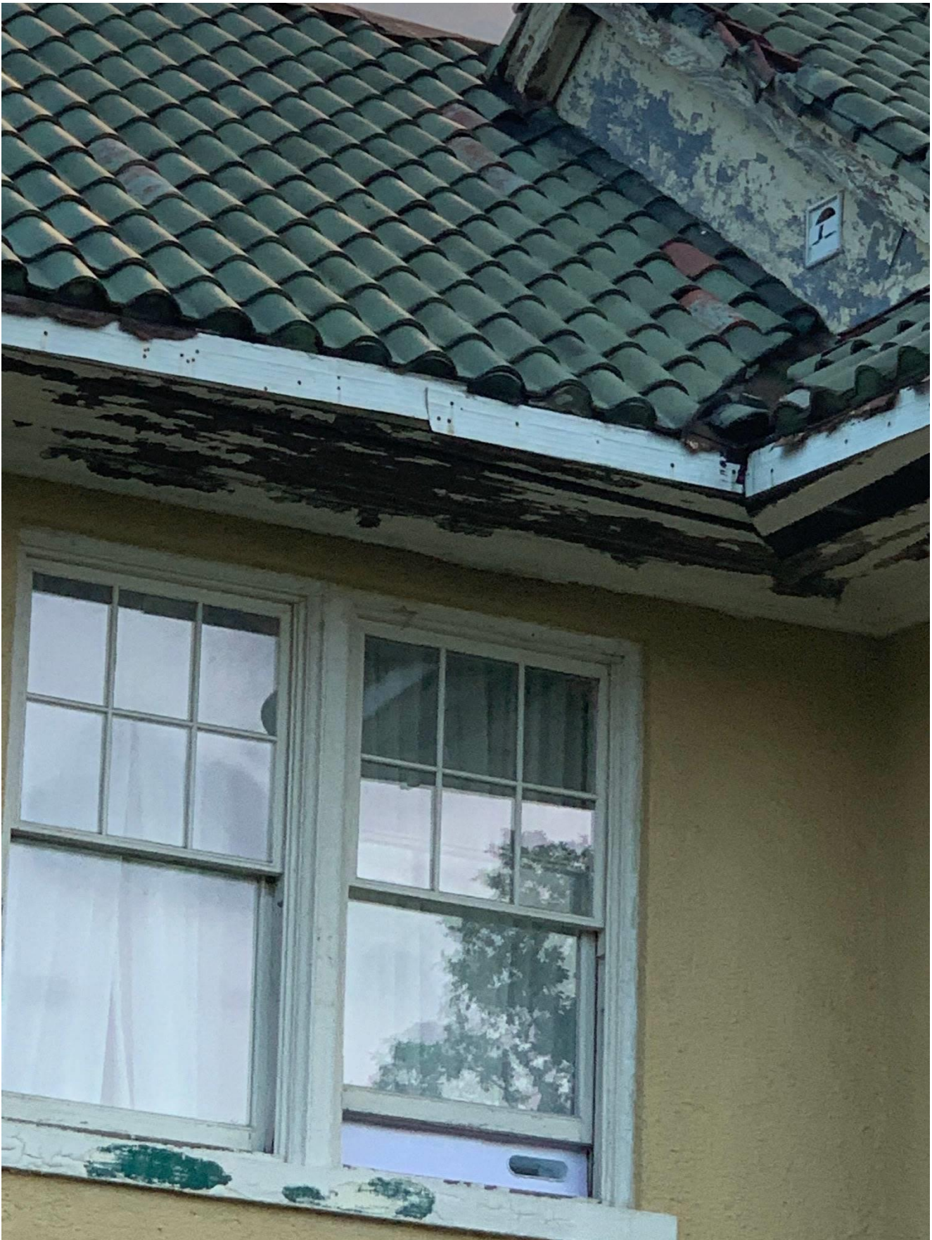
Front Windows 9-10