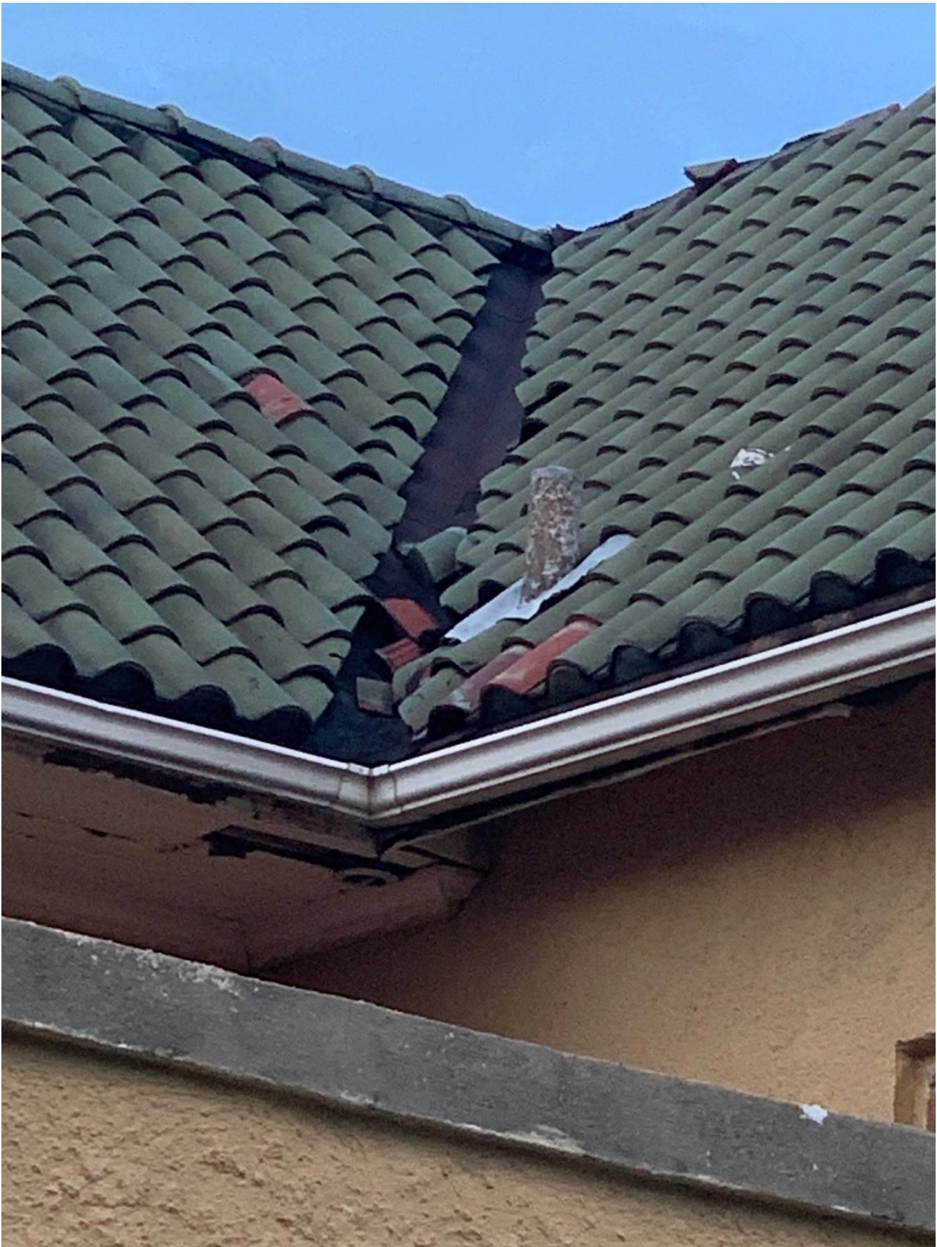
Missing Tile Detail2 9-10