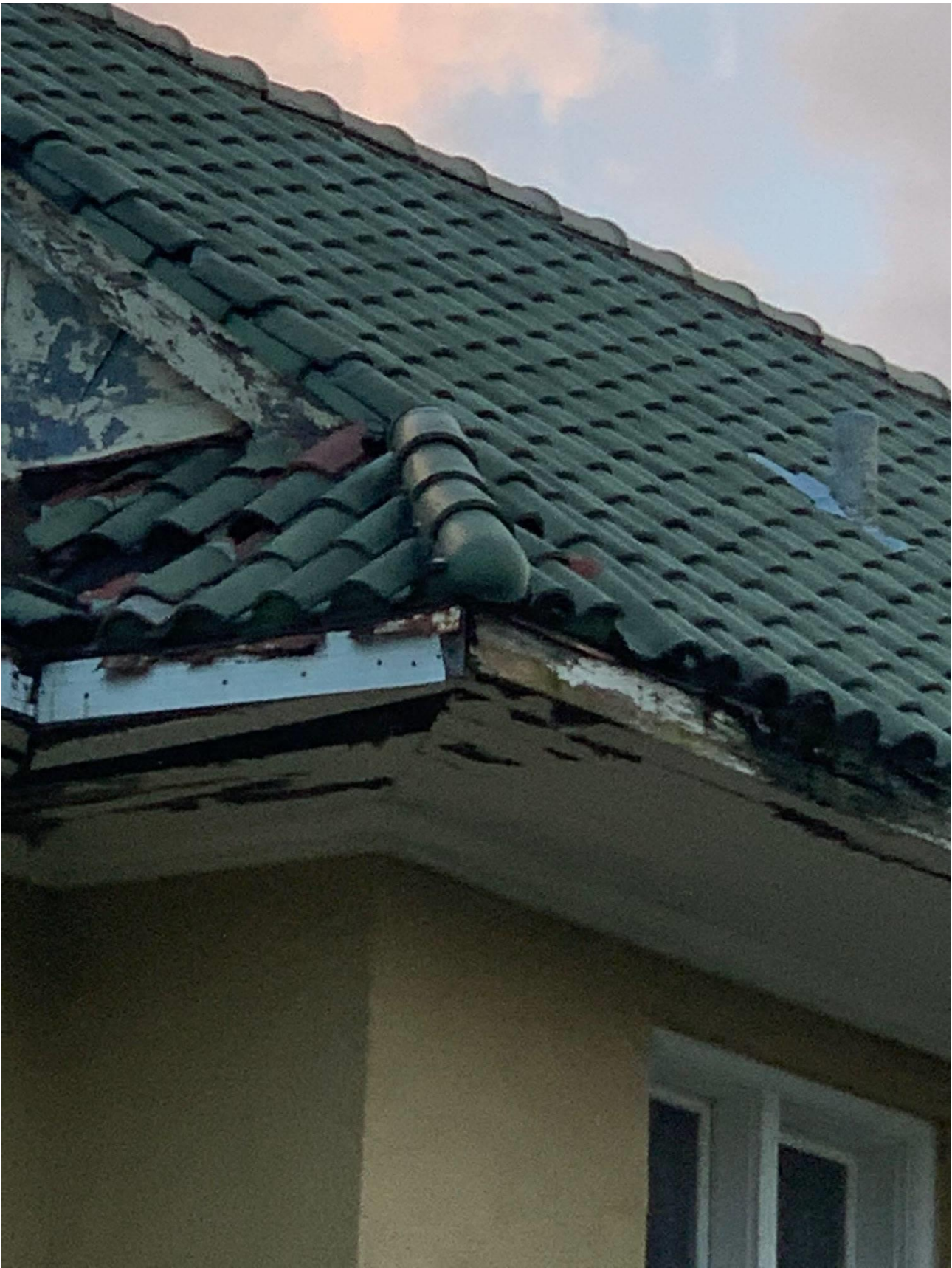
Corner Details 9-10