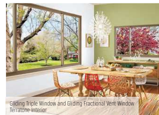
Gliding Triple Window and Gliding Fractional Vent Window / Terracotta Interior