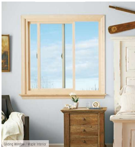
Gliding Window / Maple Interior

“Best investment in our home that we have made.” STEVEN E.