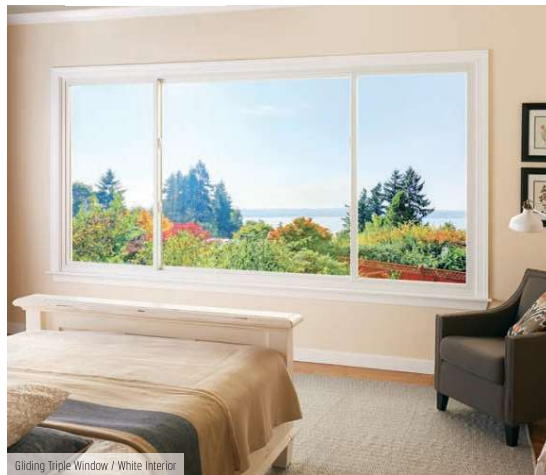
Gliding Triple Window / White Interior