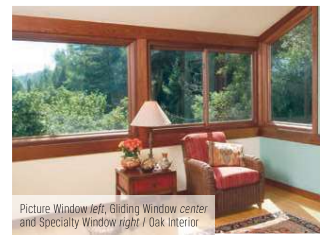
Picture Window left, Gliding Window center and Specialty Window right / Oak Interior