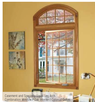
Casement and Specially Equal Leg Arch Combination Window / Oak Interior / Colonial Grilles