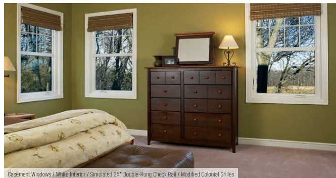
Casement Windows / White Interior / Simulated 2x Double-Hung Check Rail / Modified Colonial Grilles