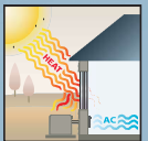
Warm Weather Performance

To help homeowners, in 1992 the National Fenestration Rating Council (NFRC) established an independent third-party rating, certification, and labeling program for windows, doors, and skylights (fenestration products). Renewal by Andersen displays the NFRC label on all of its windows. This label means that the entire window unit has been rated and certified, not just the center of the glass or individual components. See our Energy Efficiency brochure for additional information.