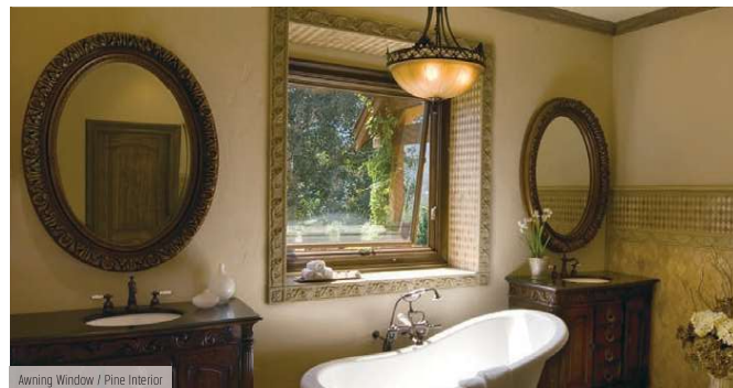
Awning Window / Pine Interior