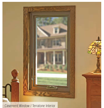
Casement Window / Terracotta Interior