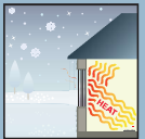
Cool Weather Performance