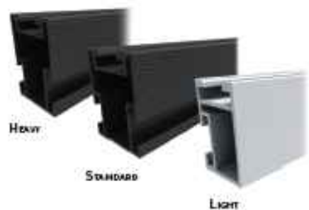
QRails come in two lengths — 168 inches (14 ft) and 208 inches (17.3 ft) Mill and Black Finish

QRail is engineered for optimal structural performance. The system is certified to UL 2703, fully code compliant and backed by a 25-year warranty. QRail is available in Light, Standard and Heavy versions to match all geographic locations. QRail is compatible with virtually all modules and works on a wide range of pitched roof surfaces. Modules can be mounted in portrait or landscape orientation in standard or shared-rail configurations.