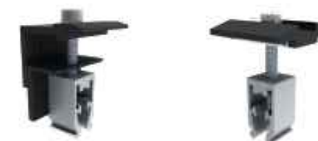
UNIVERSAL END CLAMP 2 clamps for modules from 30-45mm or 38-50mm thick