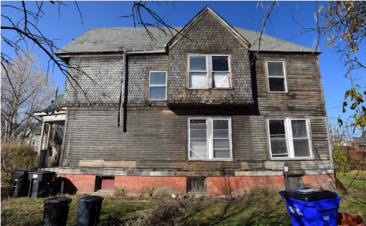
Side Façade (Southeast)