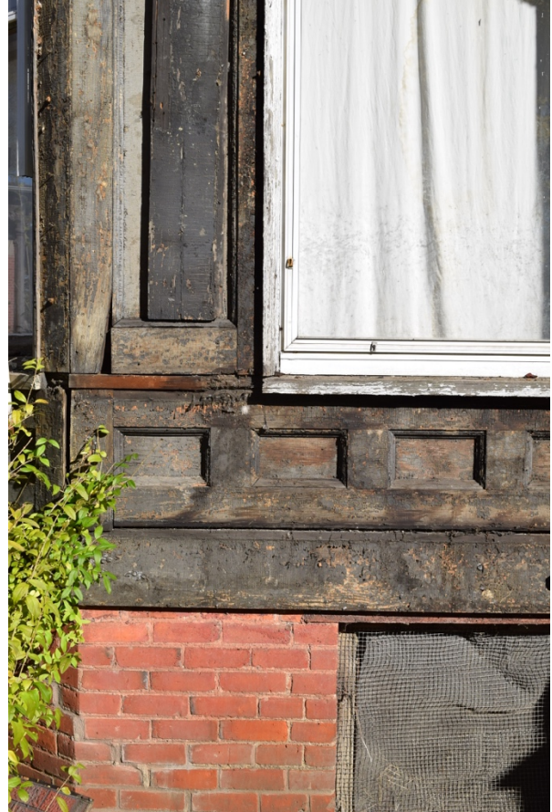
Paneling Detail at Front Façade