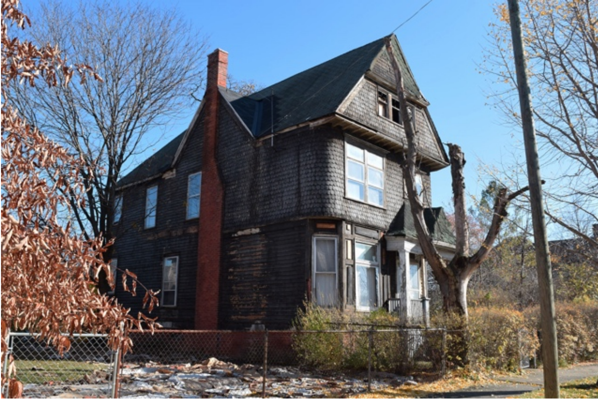
Side Façade (Northwest)