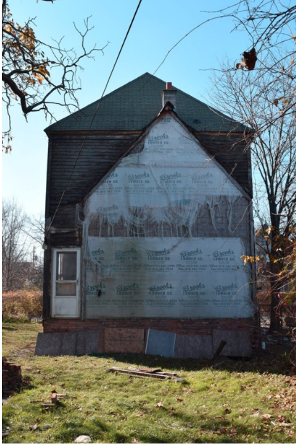
Rear Façade (Northeast)