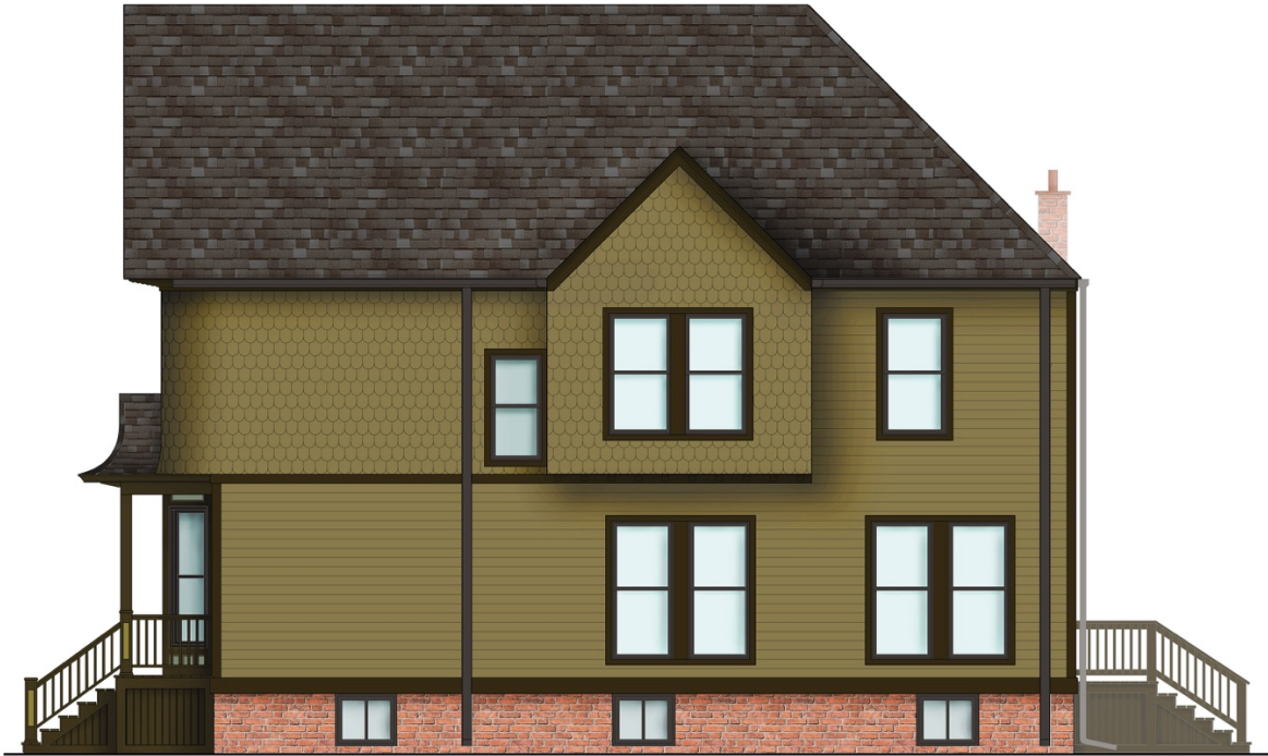
SIDE FAÇADE (Southeast)