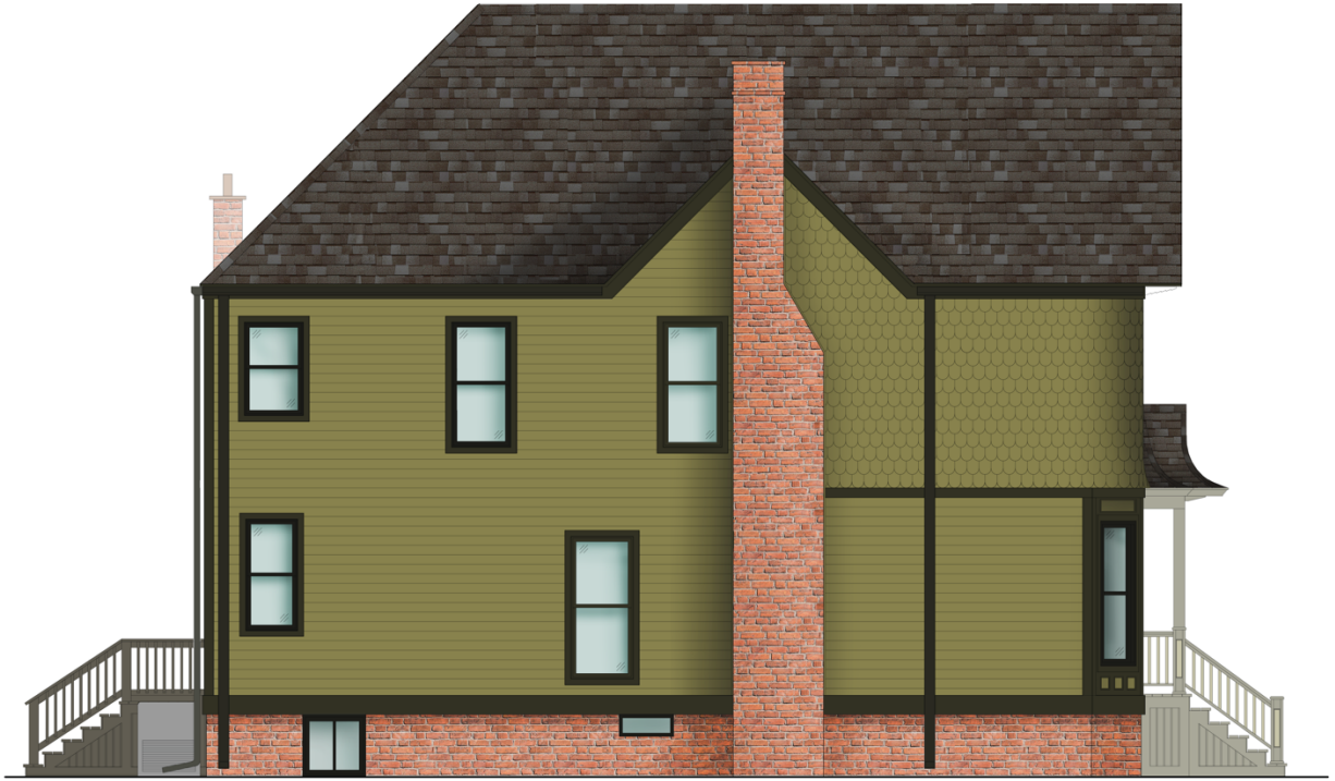
SIDE FAÇADE (Northwest)