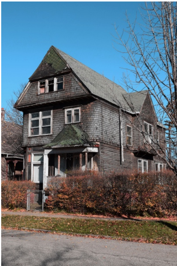
Front Façade (South)