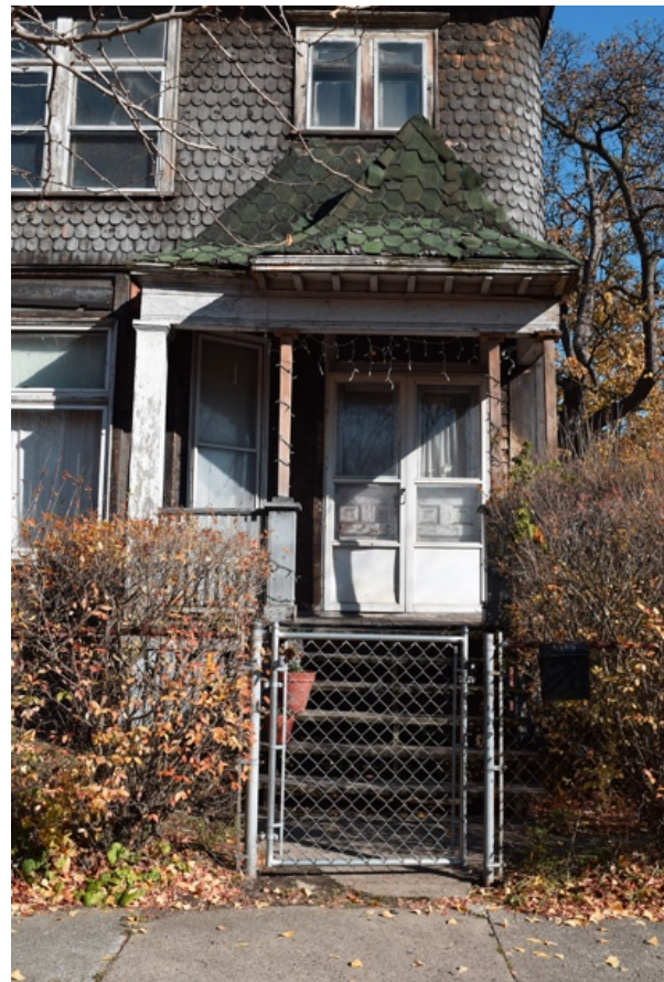
Front Porch (Southwest)