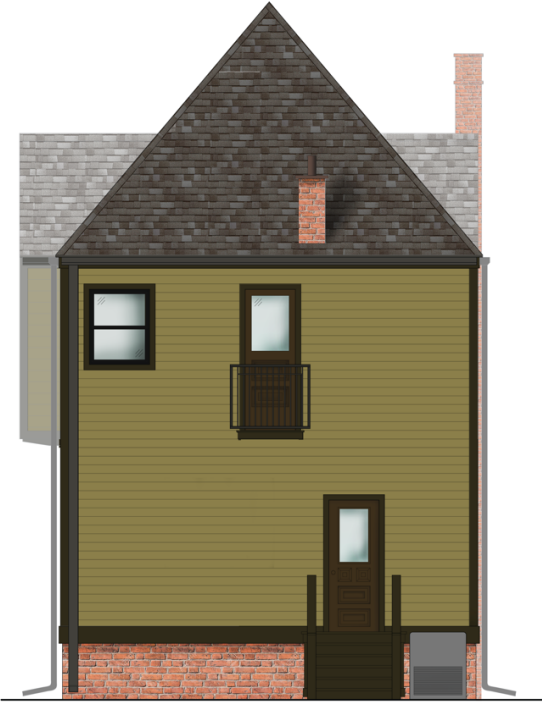
REAR FAÇADE (Northeast)