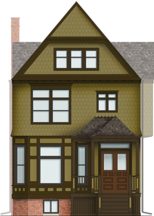
FRONT FAÇADE (Southwest)