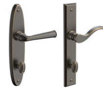
HINGED & BIFOLD PATIO DOOR HANDLE Locus | Virago