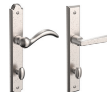
HINGED PATIO DOOR HANDLES Rustiek | Gusto