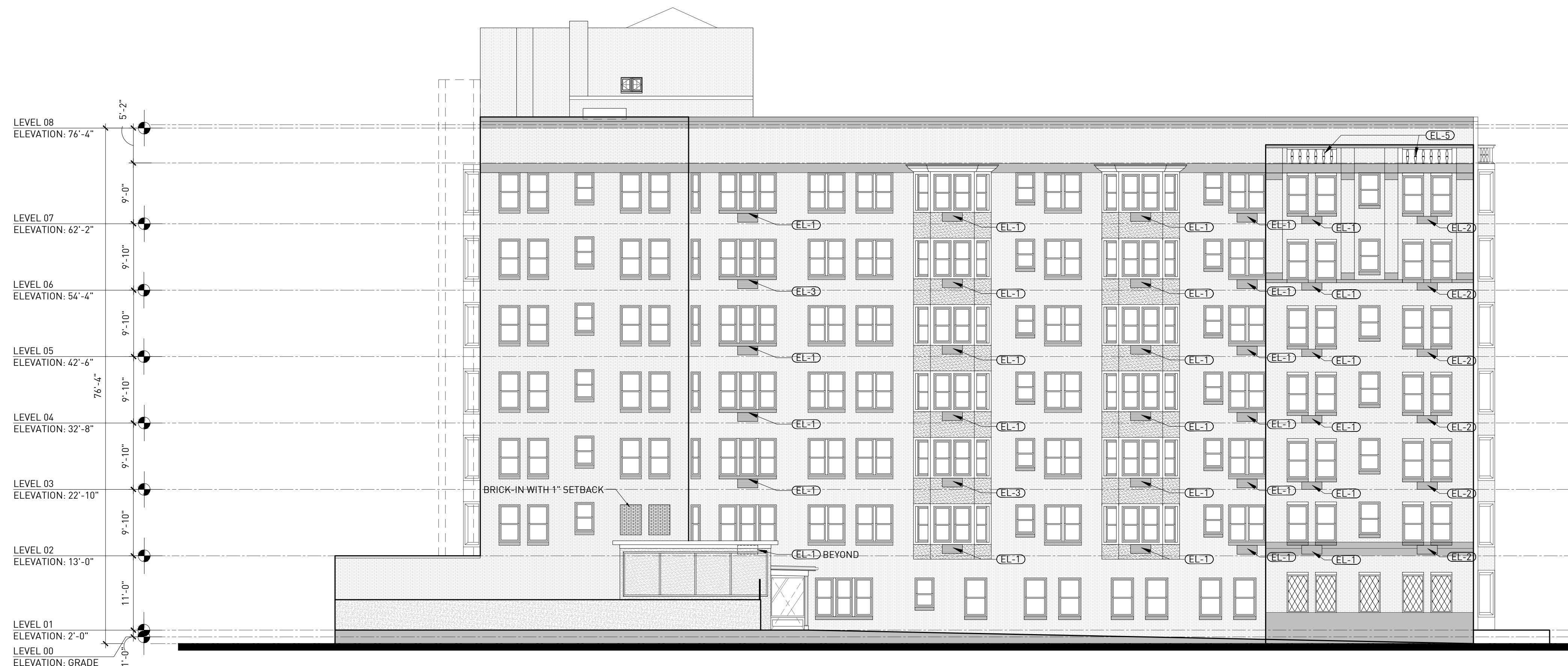
2 WEST ELEVATION ORIGINAL DRAWING SCALE: 3/32" = 1'-0"

700 SEWARD 700 SEWARD AVE, DETROIT, MI 48202 RAMP REMOVAL / STAIR CONSTRUCTION