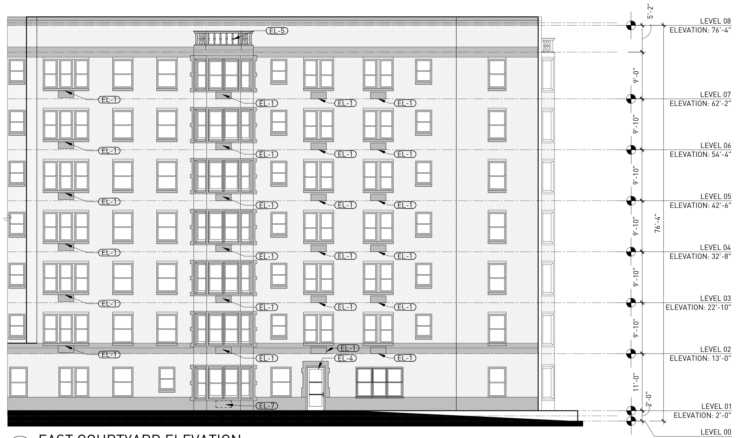
3 EAST COURTYARD ELEVATION ORIGINAL DRAWING SCALE: 3/32" = 1'-0"

700 SEWARD 700 SEWARD AVE, DETROIT, MI 48202 RAMP REMOVAL / STAIR CONSTRUCTION