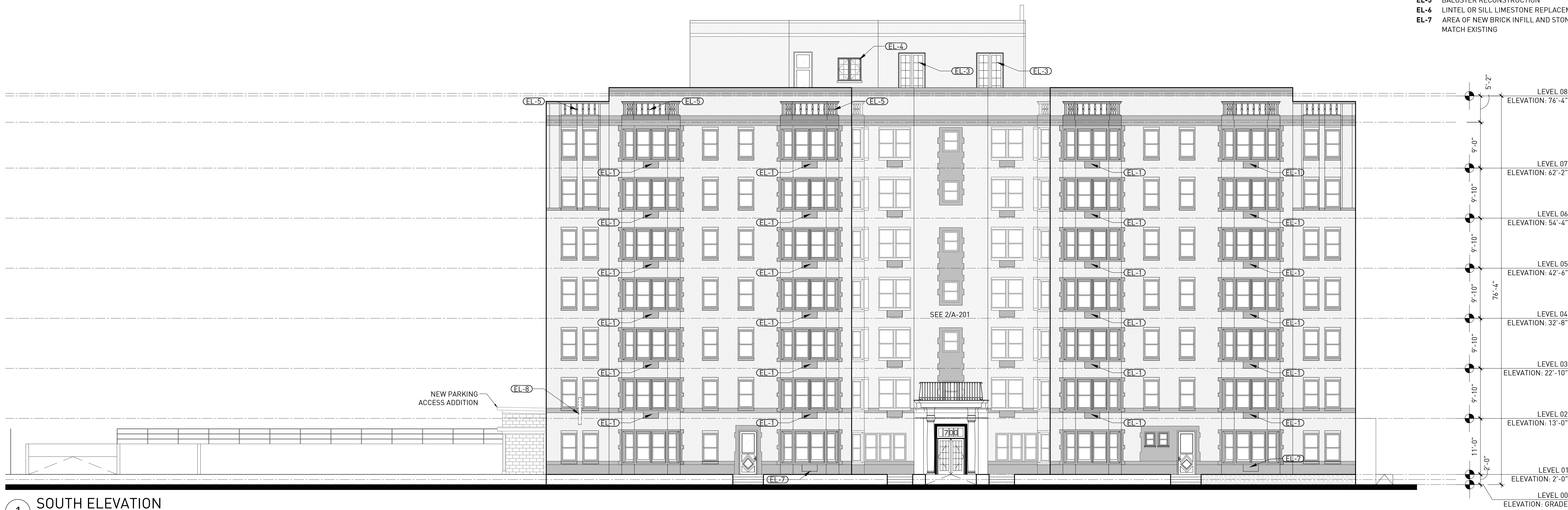
1 SOUTH ELEVATION ORIGINAL DRAWING SCALE: 3/32" = 1'-0"