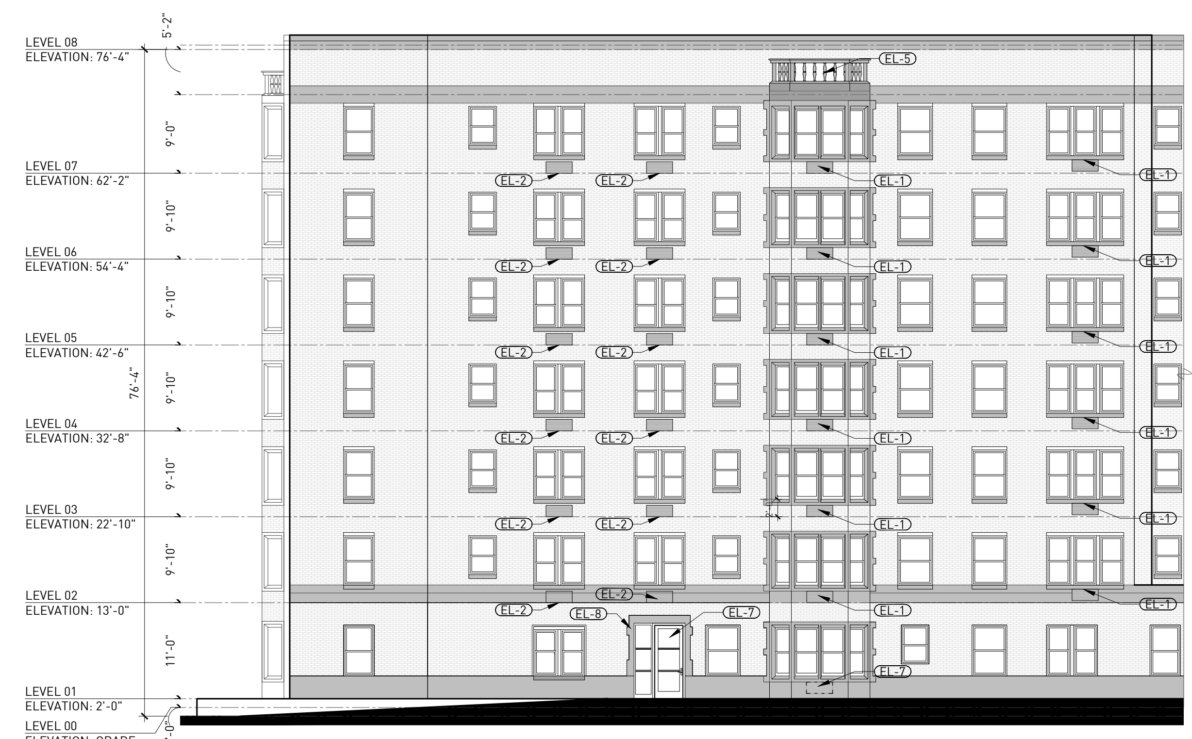
1 WEST COURTYARD ELEVATION ORIGINAL DRAWING SCALE: 3/32" = 1'-0"