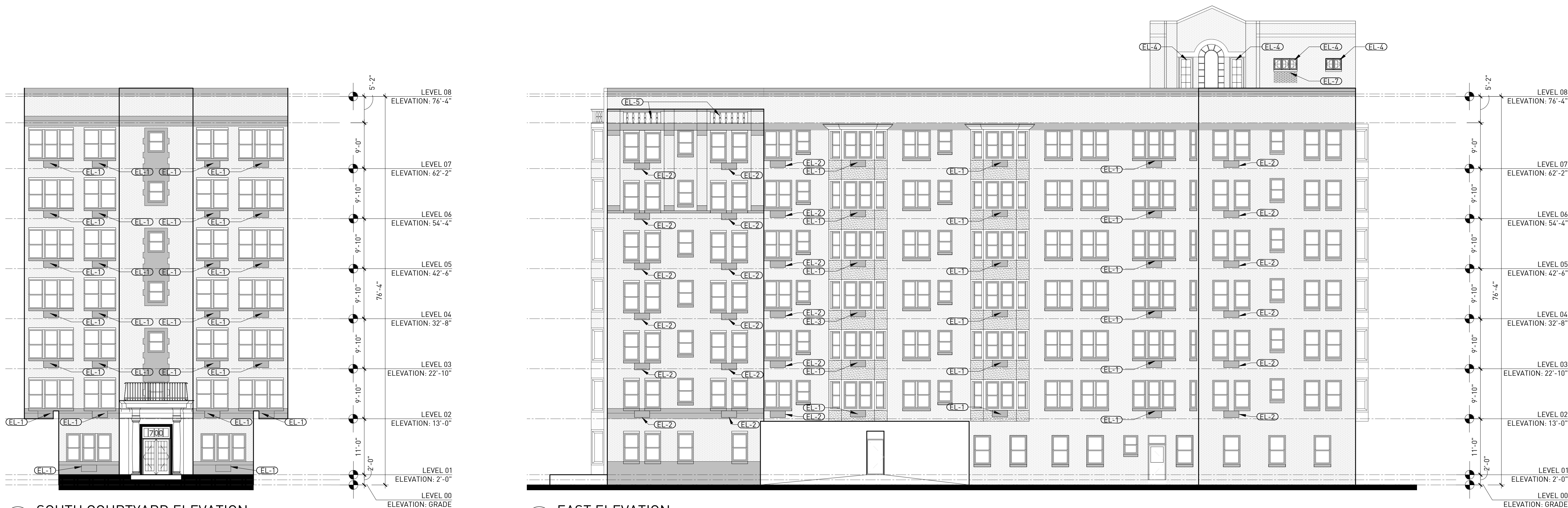
2 SOUTH COURTYARD ELEVATION ORIGINAL DRAWING SCALE: 3/32" = 1'-0"