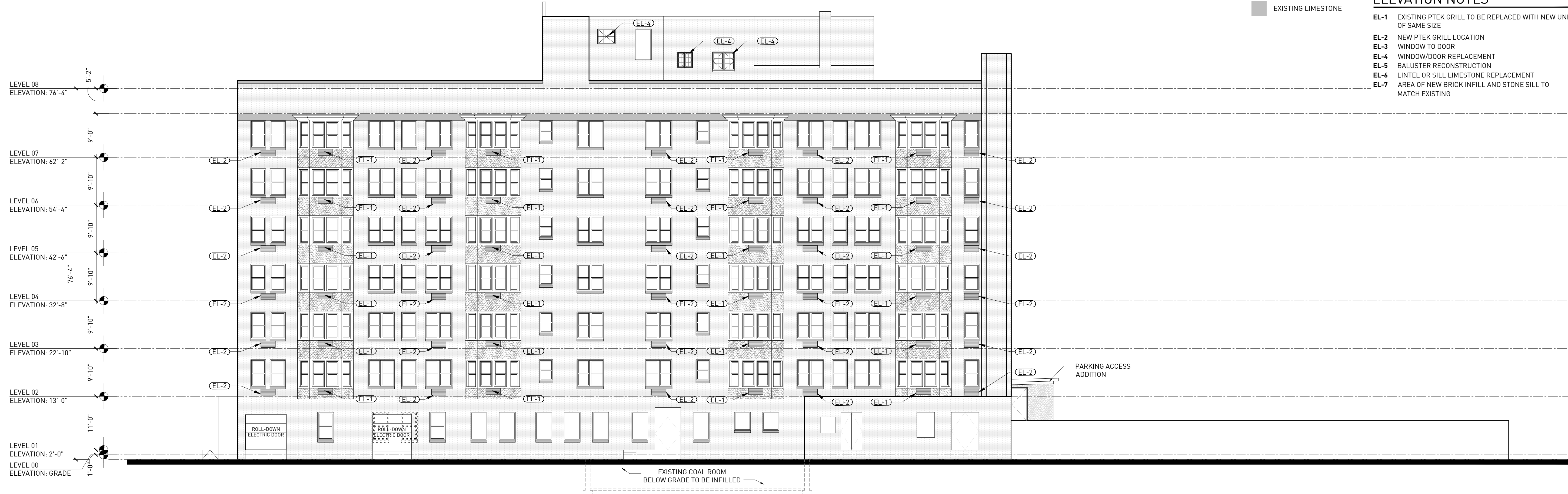
1 NORTH ELEVATION ORIGINAL DRAWING SCALE: 3/32" = 1'-0"