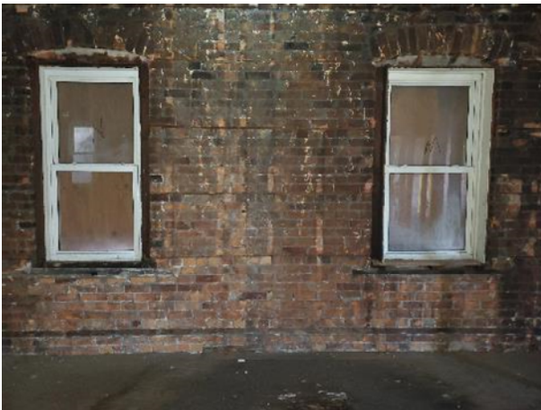
Winds 49, 50 vinyl