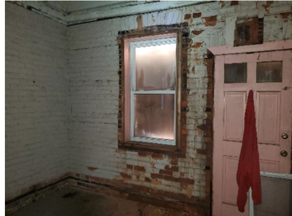
Wind 54 vinyl