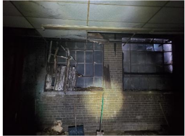
447 Henry- Steel Factory sash behind CMU infill- examine after CMU removed.