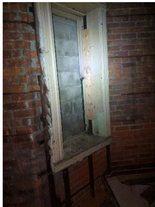
Wind #5- mostly missing