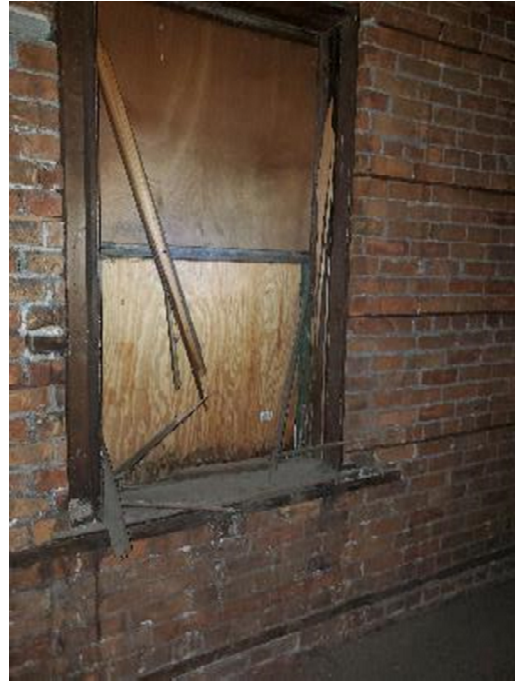
Wind #19- disassembling