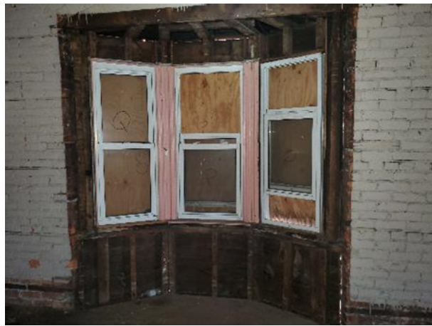
Wind #51 vinyl