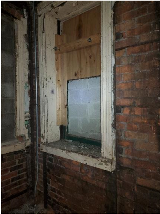
Wind #16- partially covered