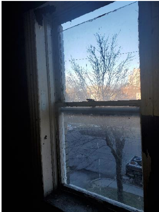
Wind #27- upper sash disassembling