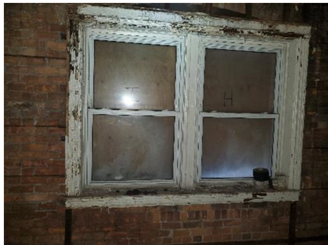
Wind #36-east 3 rd flr vinyl windows