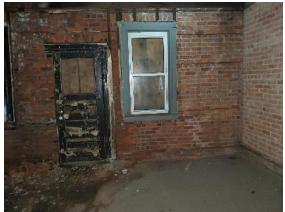
Winds 44 vinyl