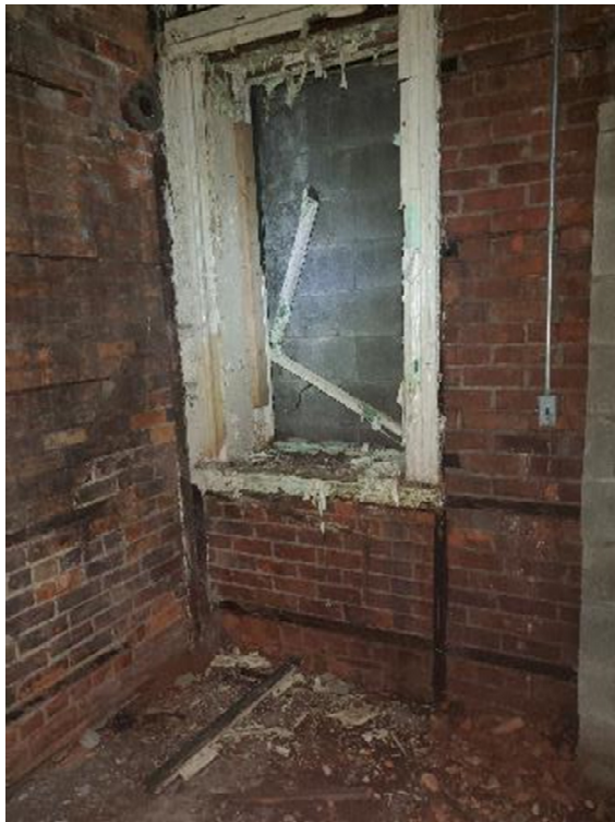
Wind #8- badly damaged