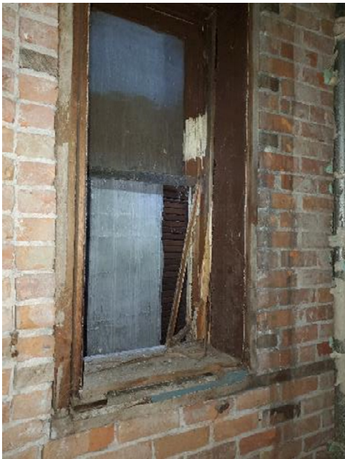
Wind #35- partially missing