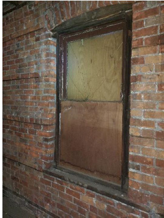
Wind #30- partially covered