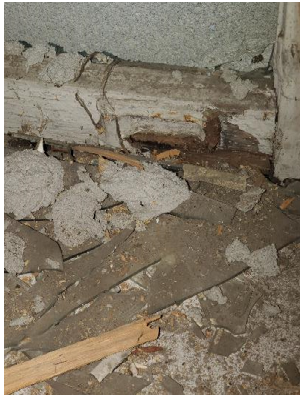
427 Henry- Window #1, some minor deterioration