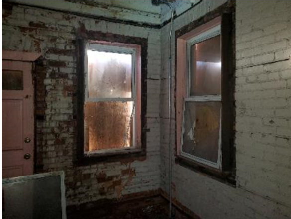
Winds 52, 53 Vinyl