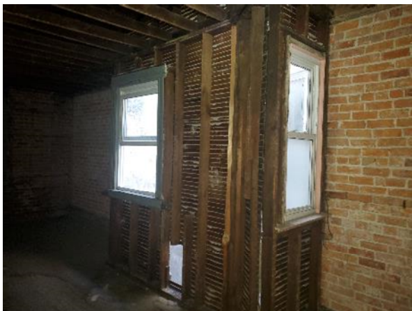
Winds 45, 46- 3 rd lightwell east