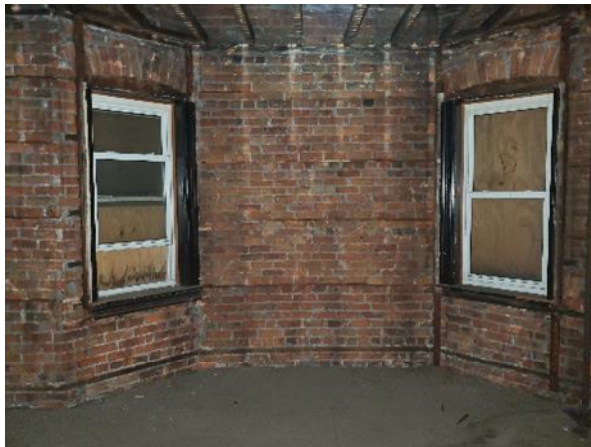
Winds 42, 43- vinyl