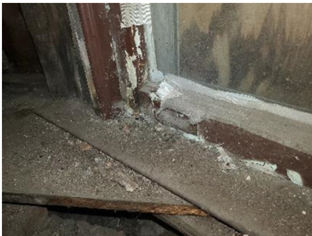
Wind #17a- some sill rail damage