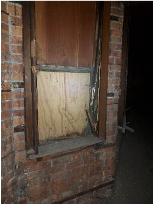
Wind #18- jamb stile damage