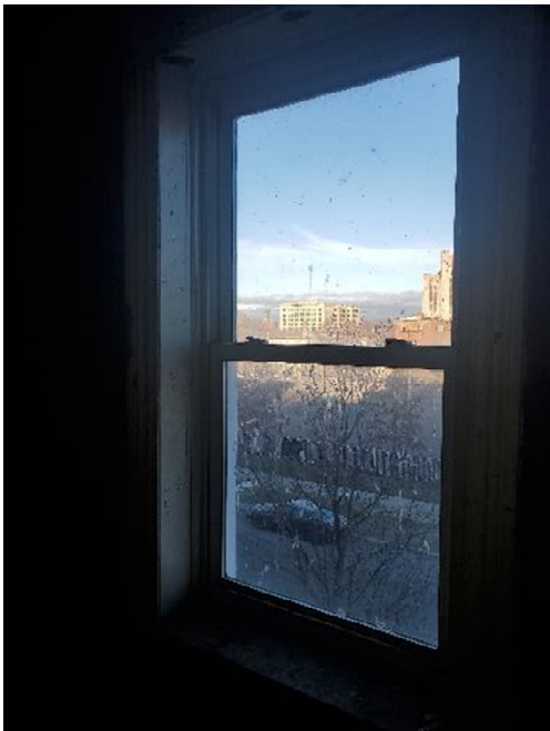
Wind #47- vinyl