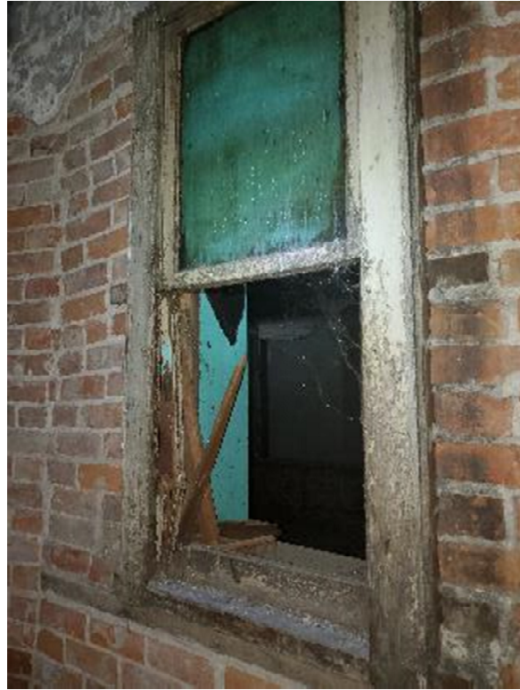
Wind #11- light well window