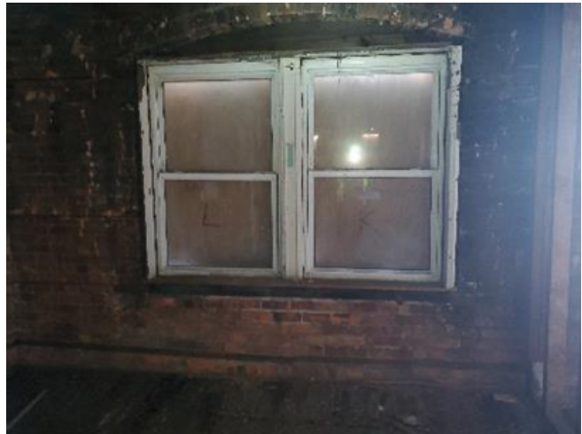
Wind #48- vinyl