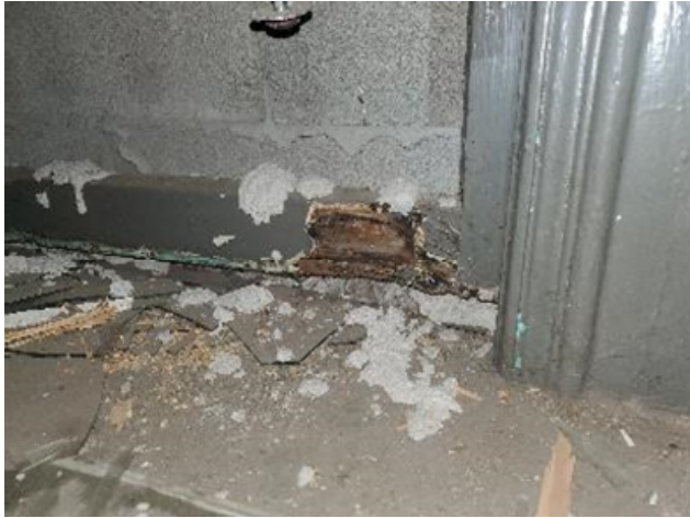
Wind #13a- deterioration detail