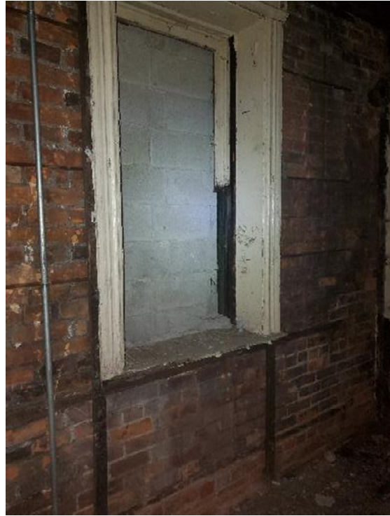
Wind #7- mostly missing