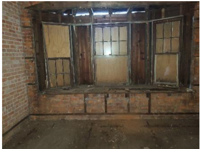
Wind #17- east bay 2 nd floor