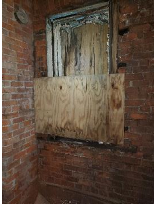
Wind #23- partially covered