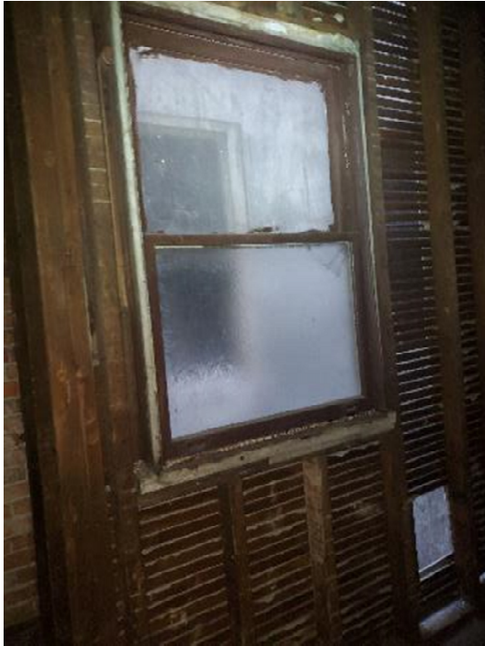
Wind #26- 2 nd east light well window