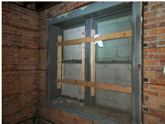
Wind #13- partially covered