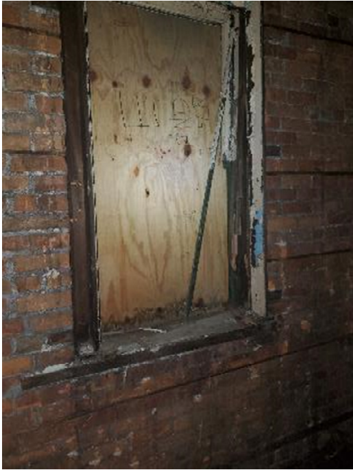
Wind #22- mostly missing