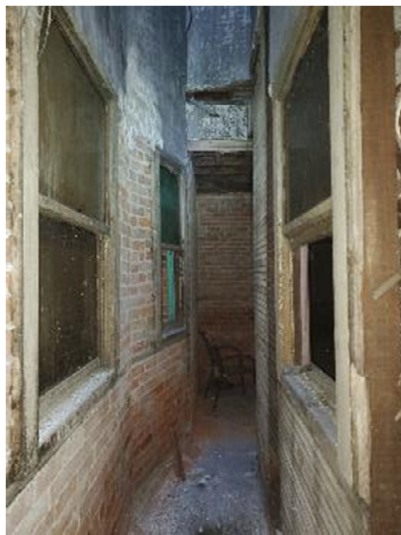
Wind #9- 1 st floor of light well