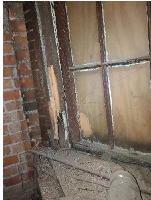
Wind #17b- left jamb