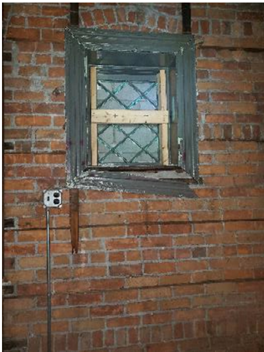
Wind #12- west diagonal muntin window