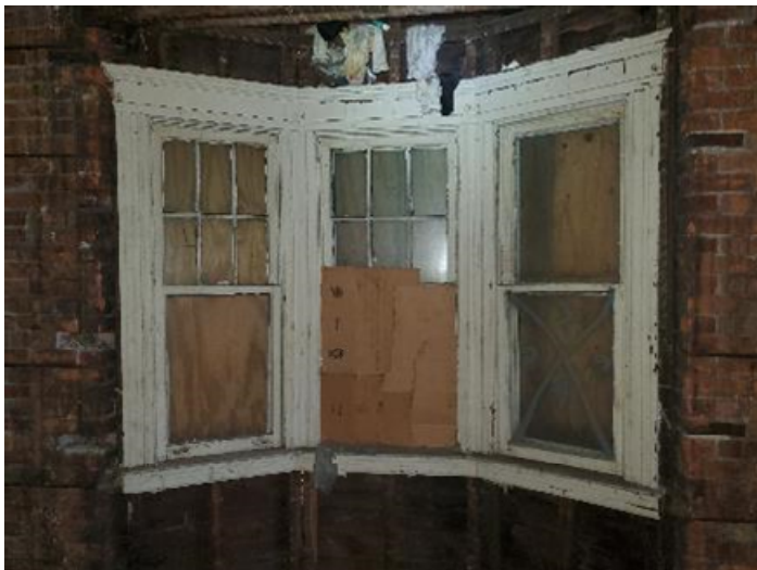
Wind #31- west bay, right replacement window