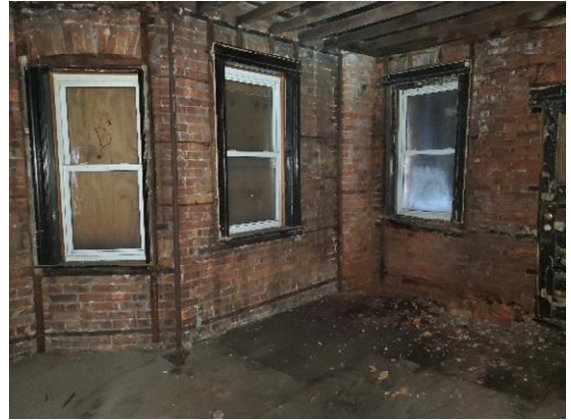
Winds 39, 40, 41- vinyl