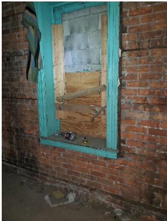
Wind #15- partially covered