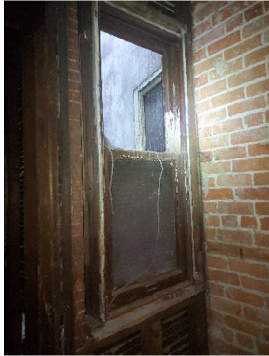
Wind #27-northeast lightwell