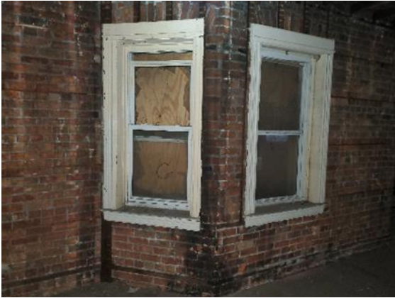
Wind #37 & 38- vinyl