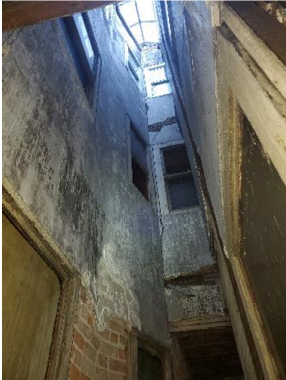
Wind #10- Upper light well