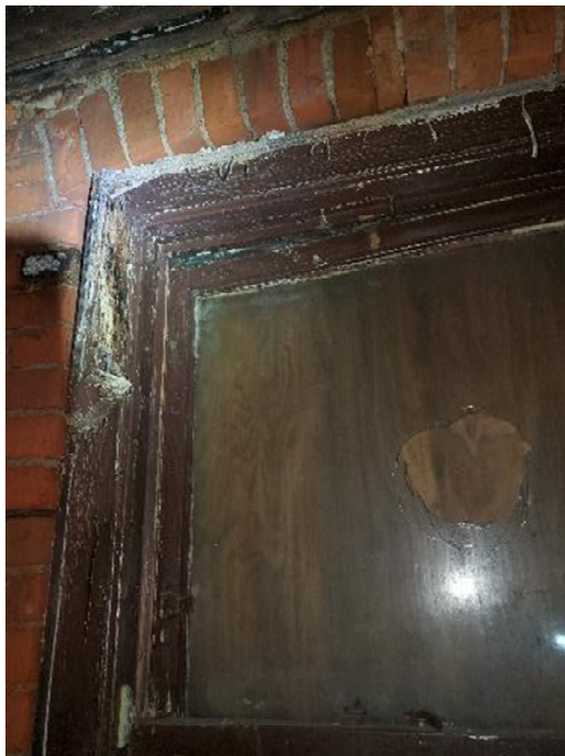
Wind #25a- upper sash saggi