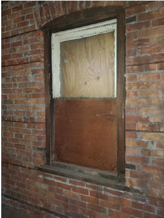
Wind #29- partially covered