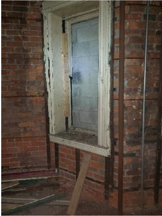
Wind #6- mostly missing