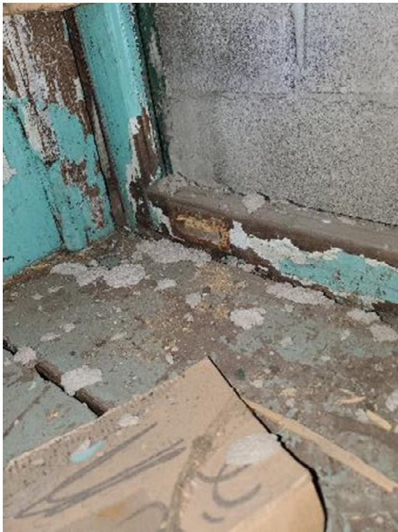
Wind #14a- damage detail