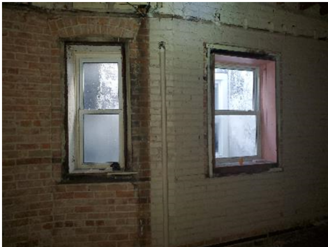
Winds 55, 56 west lightwell vinyl