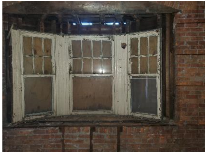
Wind #28-intact west 2 nd floor bay