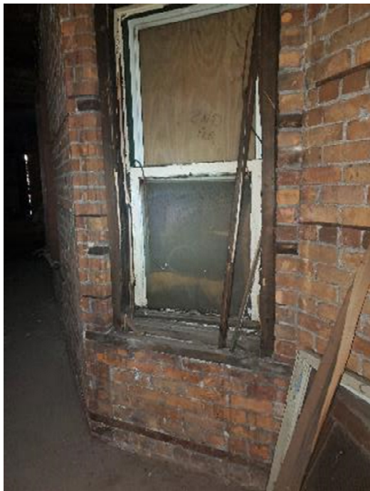
Wind #20- disassembling