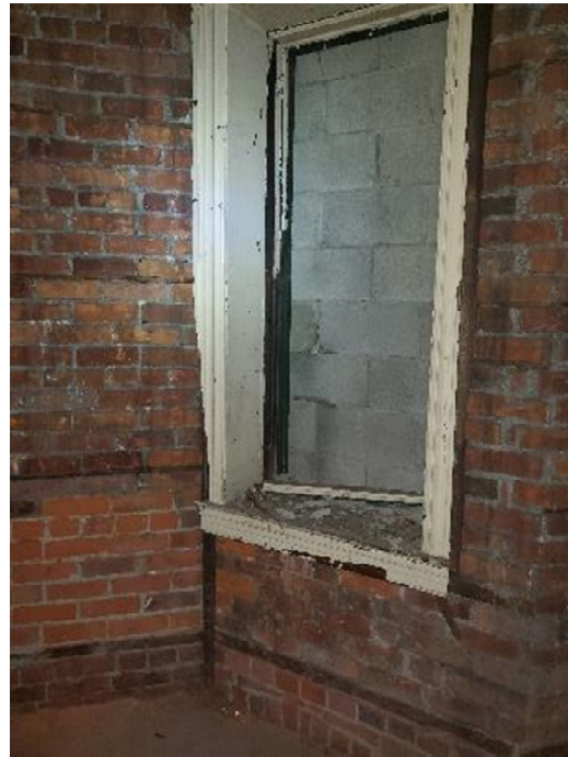
Wind #3- mostly missing