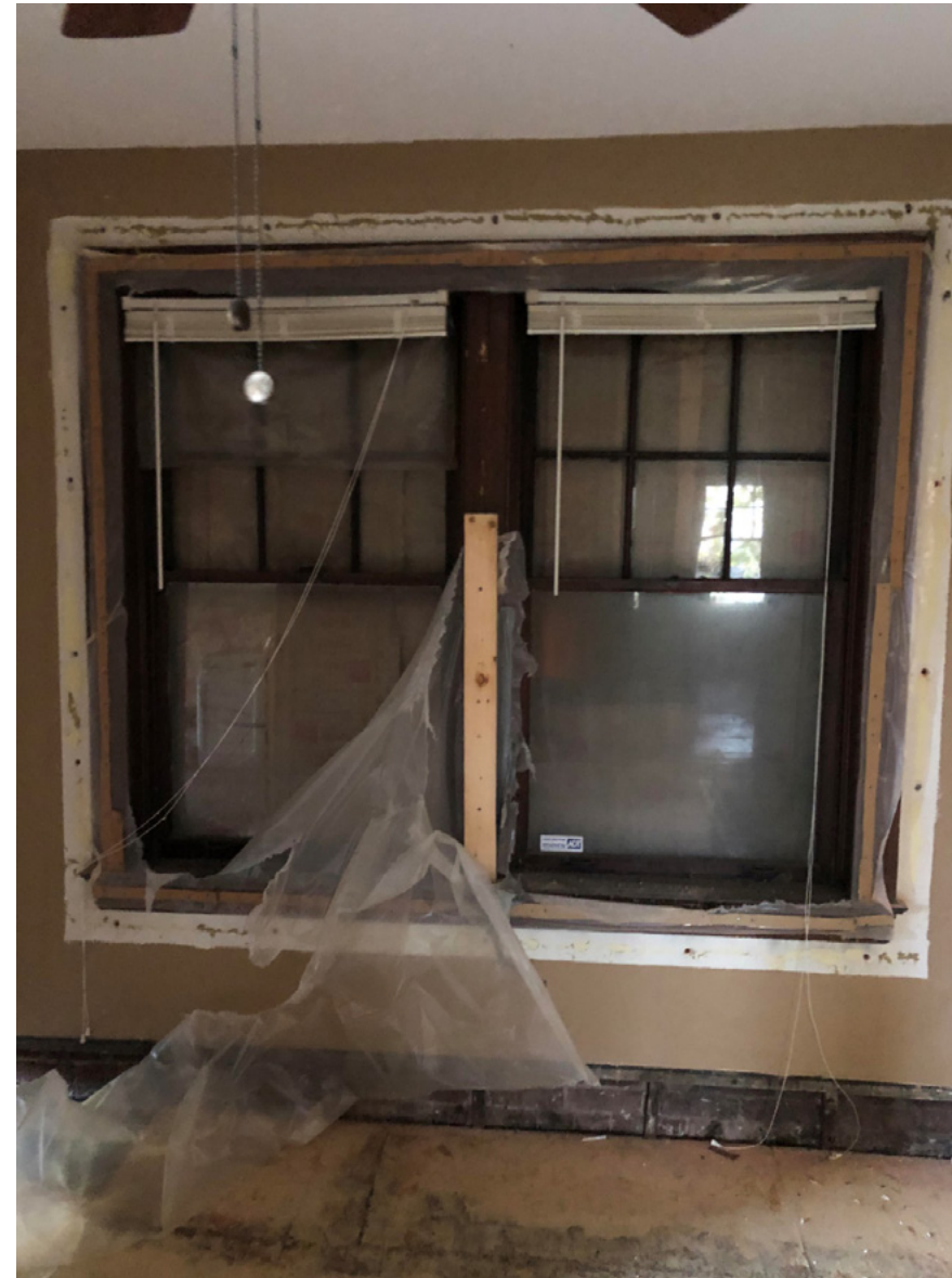
Windows F-11 & 12