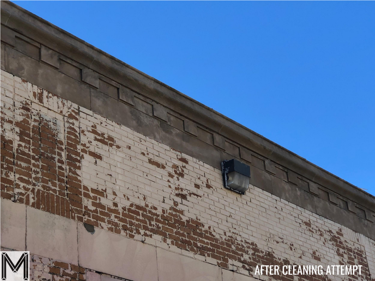
AFTER CLEANING ATTEMPT