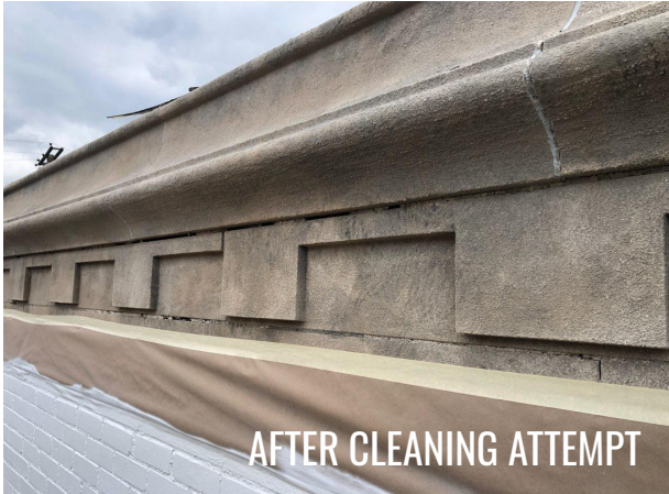
AFTER CLEANING ATTEMPT