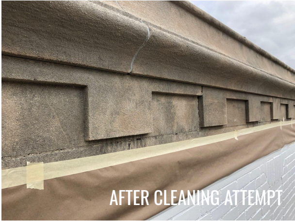
AFTER CLEANING ATTEMPT