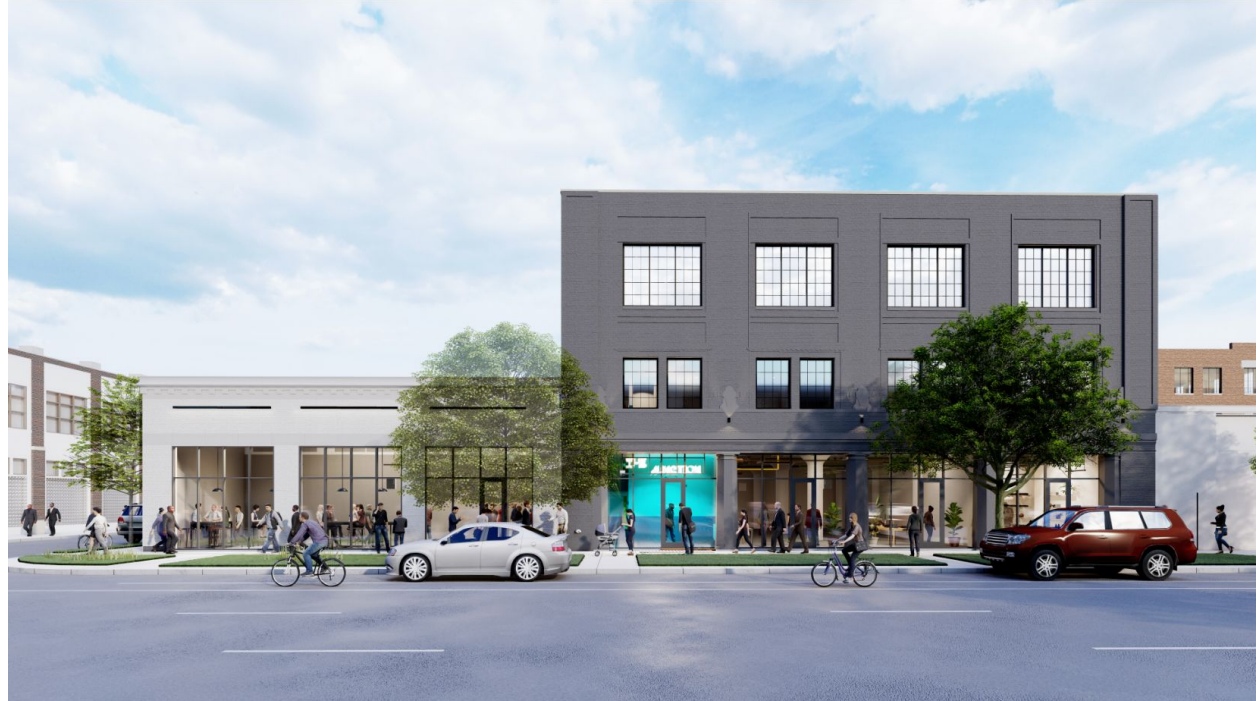
CURRENT PROPOSAL - NOVEMBER 2020