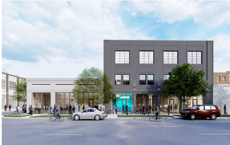
2857 - Sherwin Williams 7636 Origami White