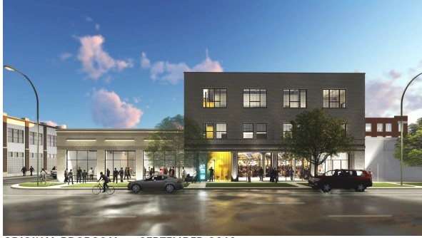
ORIGINAL PROPOSAL - SEPTEMBER 2019