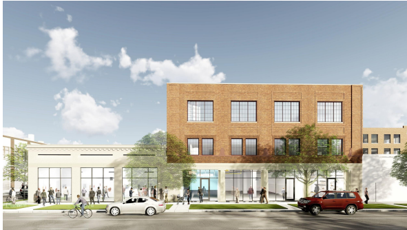
HDC APPROVED - OCTOBER 2019