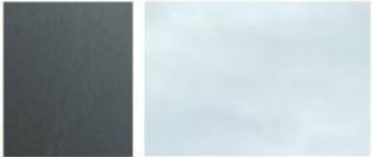
DARK ANODIZED ALUMINUM WINDOWS + TYPICAL GLAZING