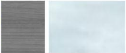
GREY STAINED CEDAR STOREFRONT MULLIONS + TYPICAL GLAZING