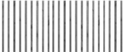
GREY STAINED CEDAR SCREEN