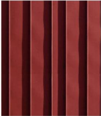
RED STANDING SEAM METAL