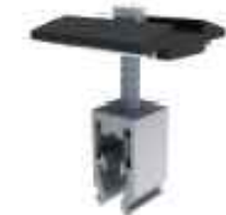
UNIVERSAL BONDED MID CLAMP 2 clamps for modules from 30-45mm or 38-50mm thick