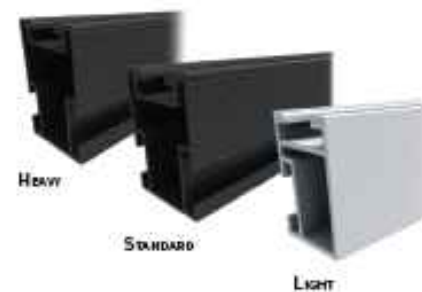
QRails come in two lengths — 168 inches (14 ft) and 208 inches (17.3 ft) Mill and Black Finish

QRail is engineered for optimal structural performance. The system is certified to UL 2703, fully code compliant and backed by a 25-year warranty. QRail is available in Light, Standard and Heavy versions to match all geographic locations. QRail is compatible with virtually all modules and works on a wide range of pitched roof surfaces. Modules can be mounted in portrait or landscape orientation in standard or shared-rail configurations.