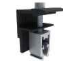
UNIVERSAL END CLAMP 2 clamps for modules from 30-45mm or 38-50mm thick