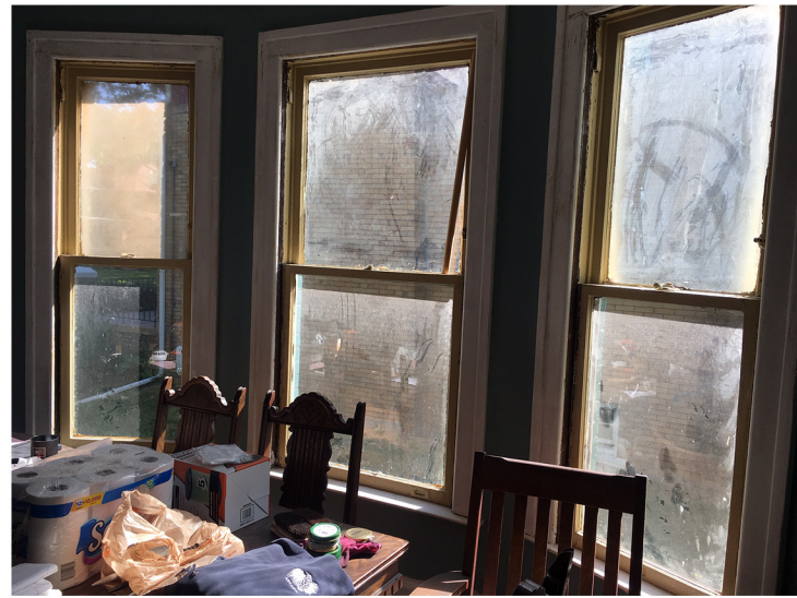
INTERIOR VIEW: PLEXI GLASS