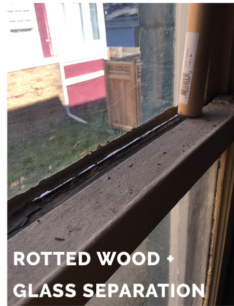
ROTTED WOOD + GLASS SEPARATION