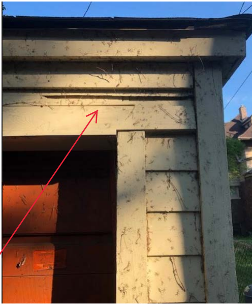
damaged, cracked siding