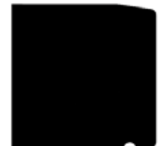
Subsill - 8 ft D69 - 1-3/8" x 1-3/8"