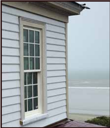
Custom Siding, Casing, and Sills Private Residence Kiawah Island, SC

DURATION® is the industry leader in poly-ash composite moulding and custom millwork production and is manufactured from TruExterior® Trim and Siding Products.