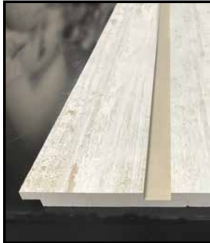
Custom Channel Siding Private Residence Princeton, NJ