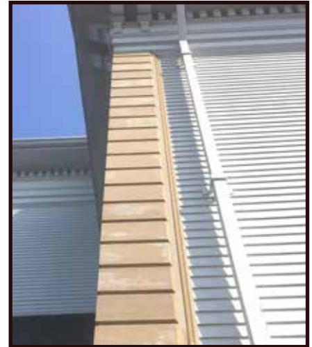
Historical Quoin Replication Old South Church Boston, MA