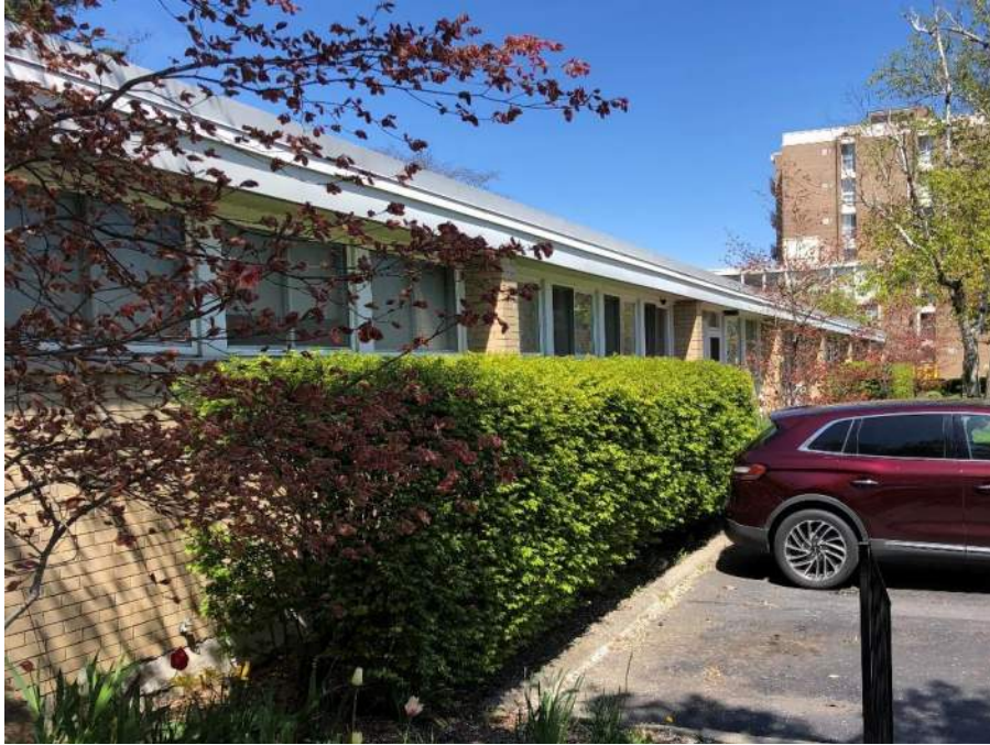
Figure 3. Overview photo of building from grade.