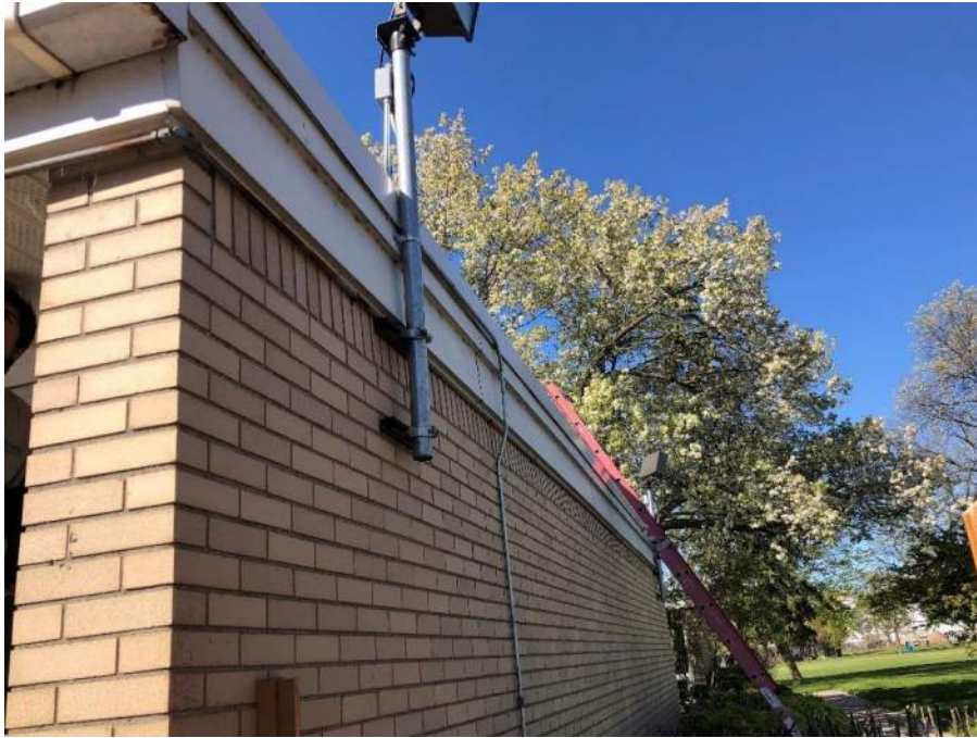
Figure 9. Existing gravel stop and fascia at side of building.