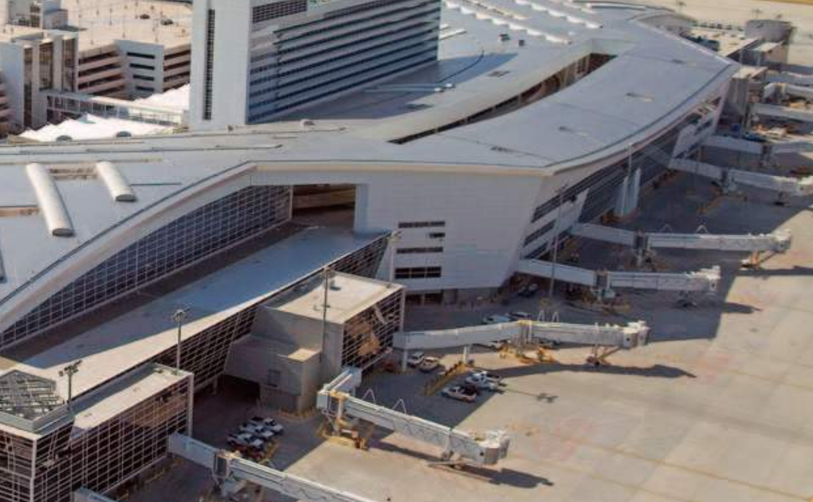
▲ Dallas/Fort Worth International Airport, Dallas, TX