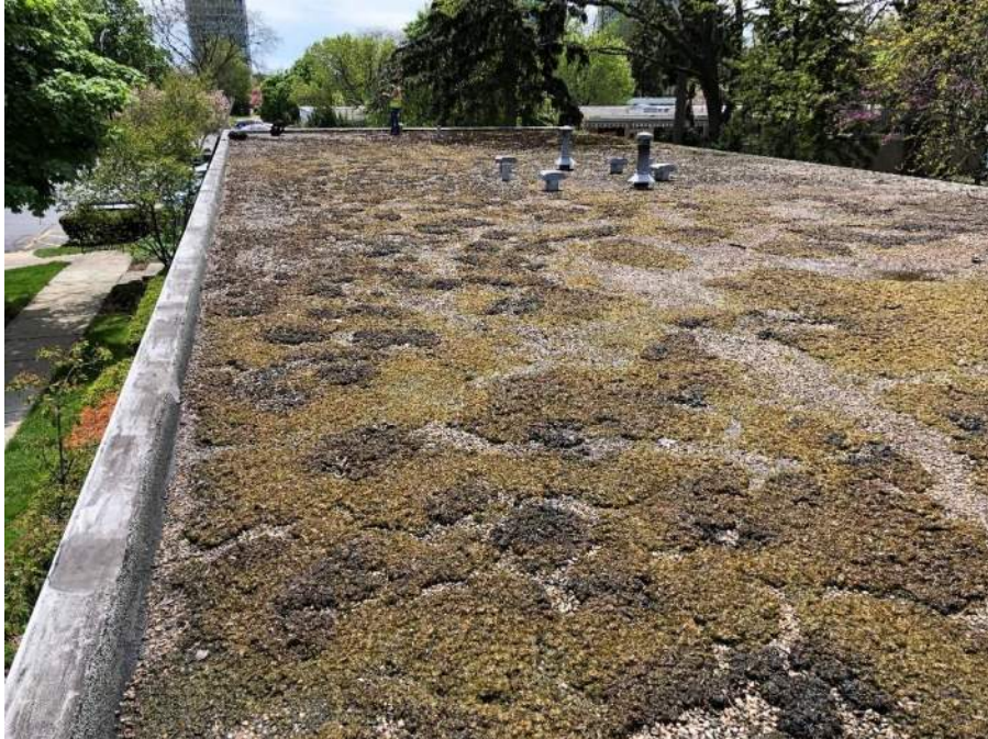
Figure 4. Overview of existing roof surface.