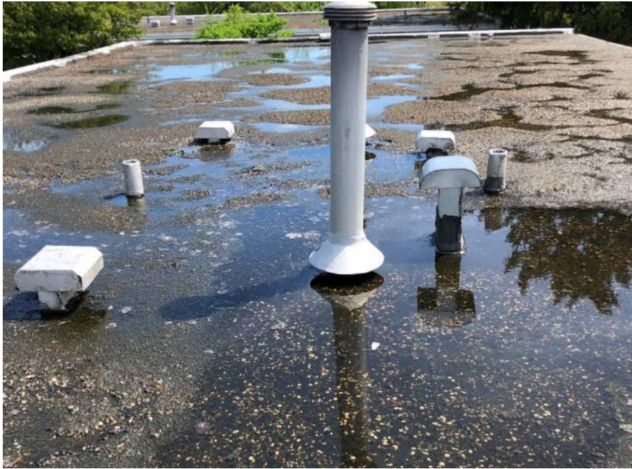
Figure 7. Detail photo of rooftop equipment and penetrations.