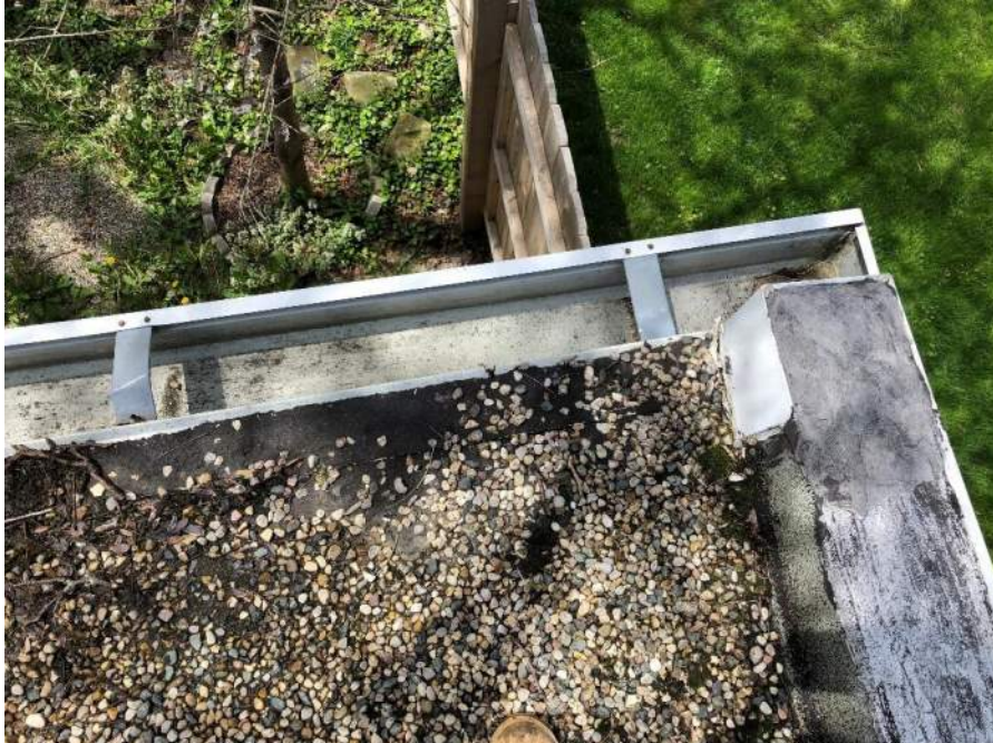
Figure 6. Detail photo of typical roof edge conditions.