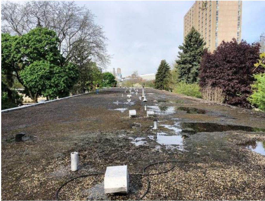
Figure 5. Overview of existing roof surface.