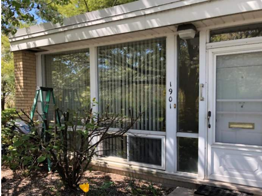
Figure 8. Existing gravel stop and fascia and soffit at front of building.