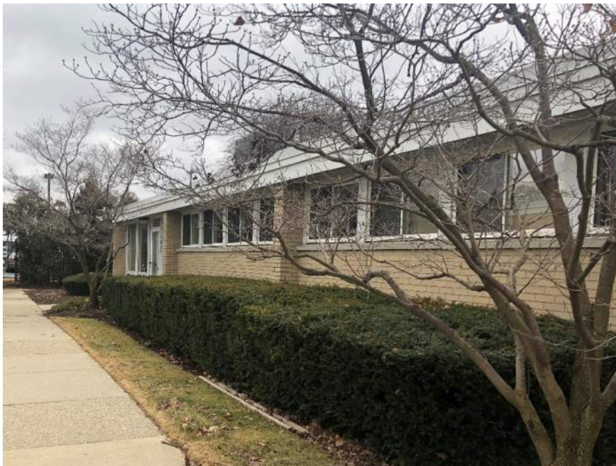
Figure 2. Overview photo of building from grade.