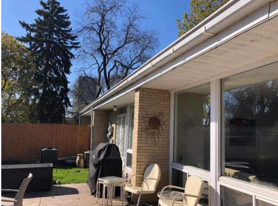
Figure 10. Existing hanging gutter, downspout, fascia, and soffit at back of building.