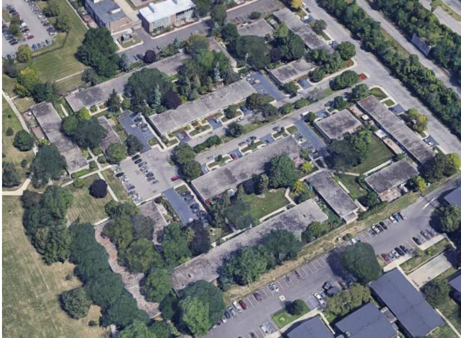
Figure 1. Aerial view of the sixteen buildings within Chateaufort Place Cooperative.