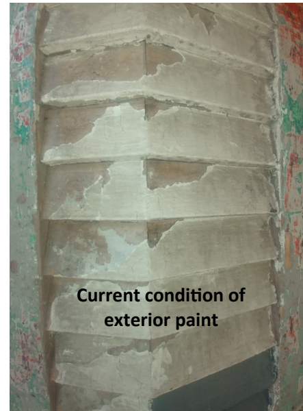
Current condition of exterior paint