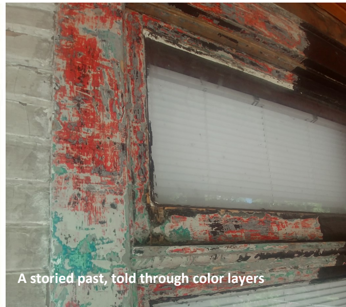
A storied past, told through color layers