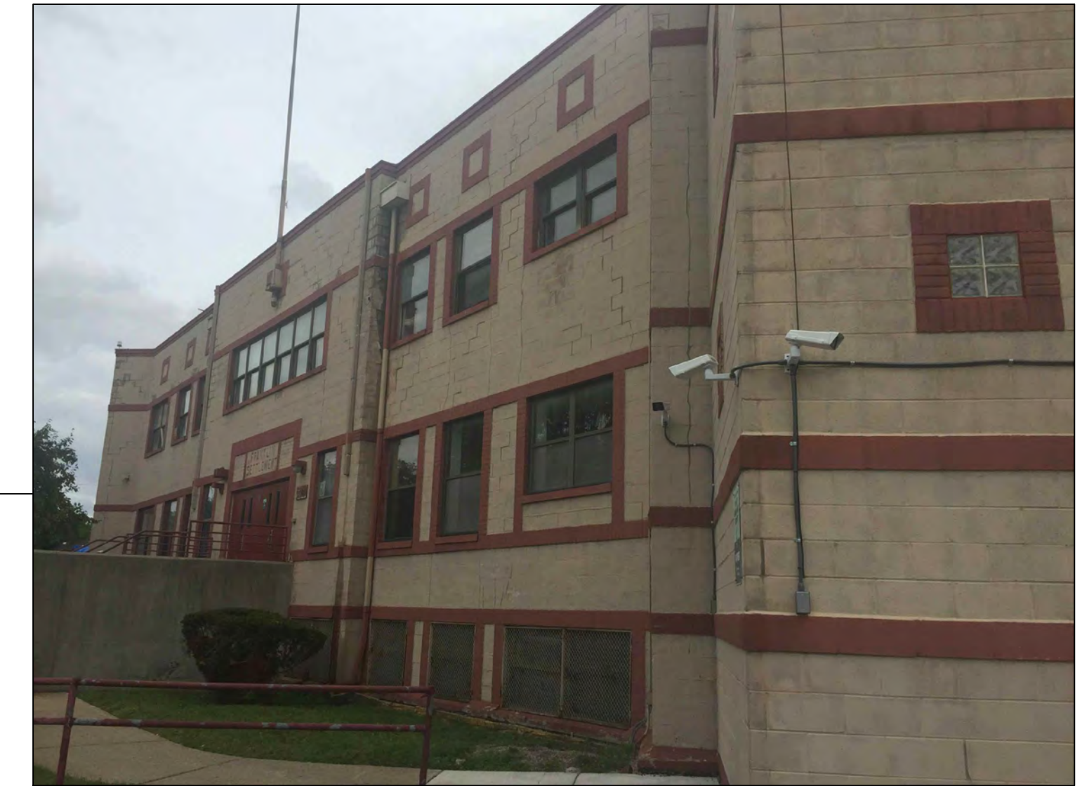
EXTERIOR EXTERIOR PHOTO "E"