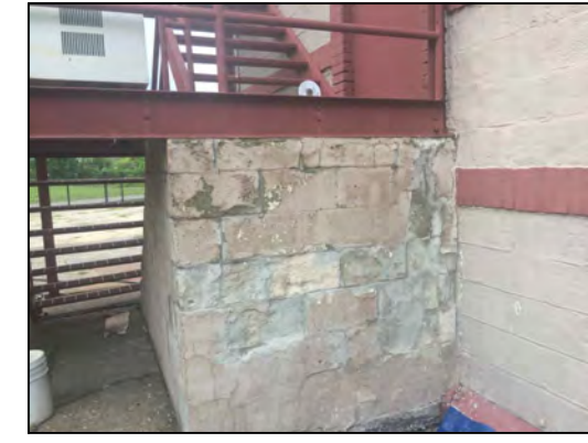
EXTERIOR EXTERIOR PHOTO "C"