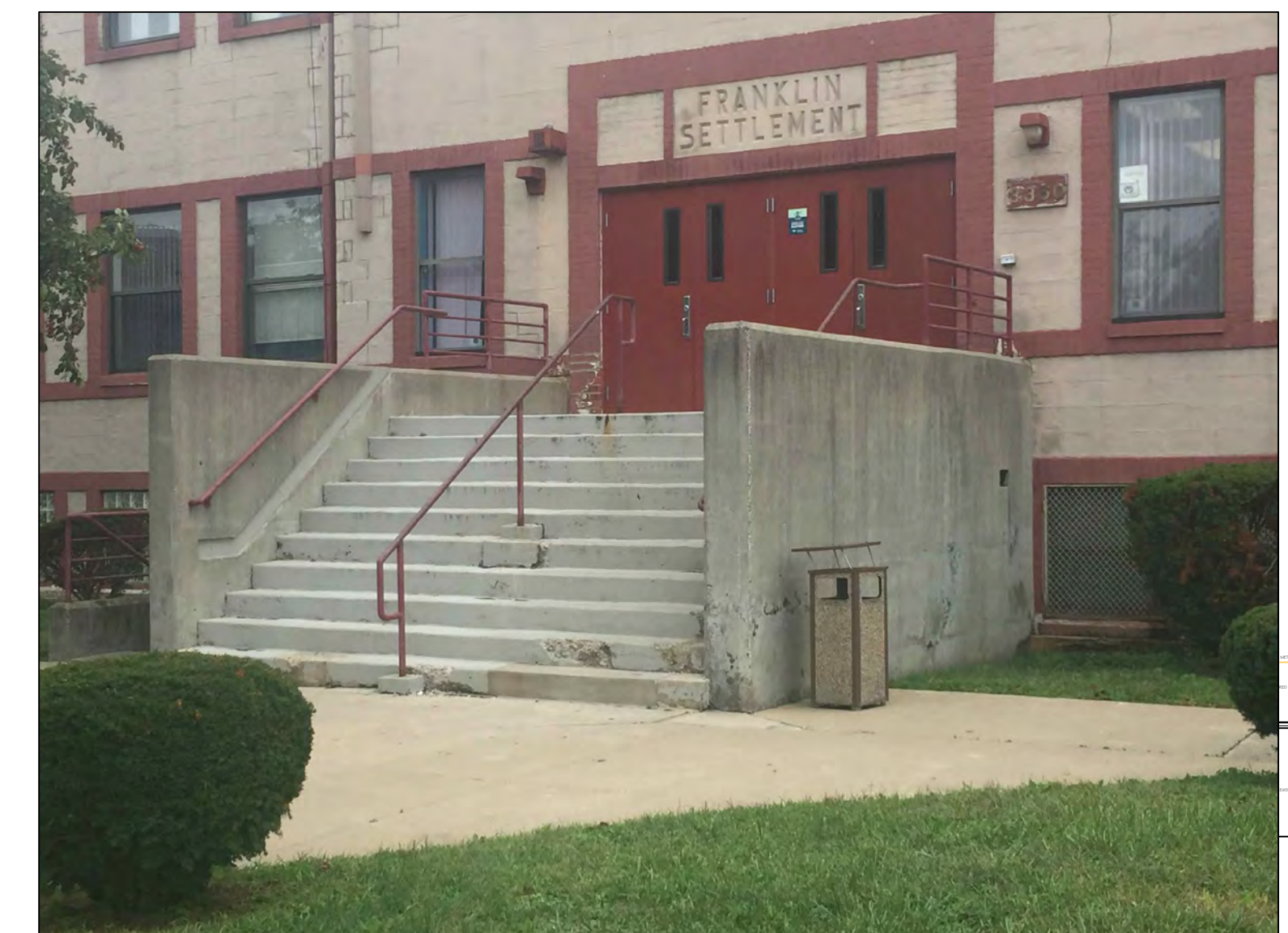
EXTERIOR EXTERIOR PHOTO "F"