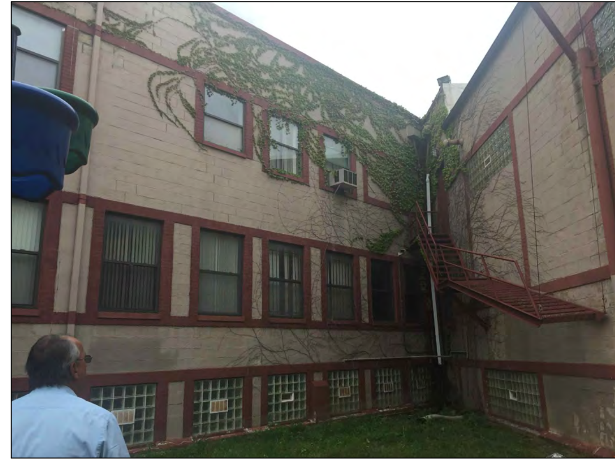
EXTERIOR EXTERIOR PHOTO "A"