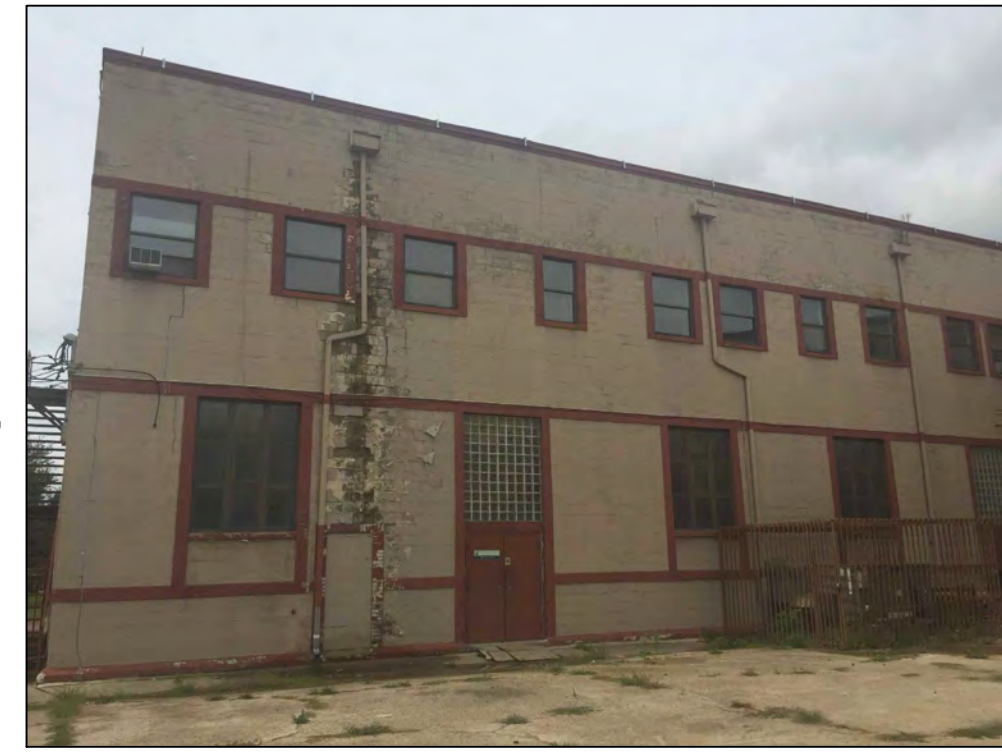
EXTERIOR EXTERIOR PHOTO "D"