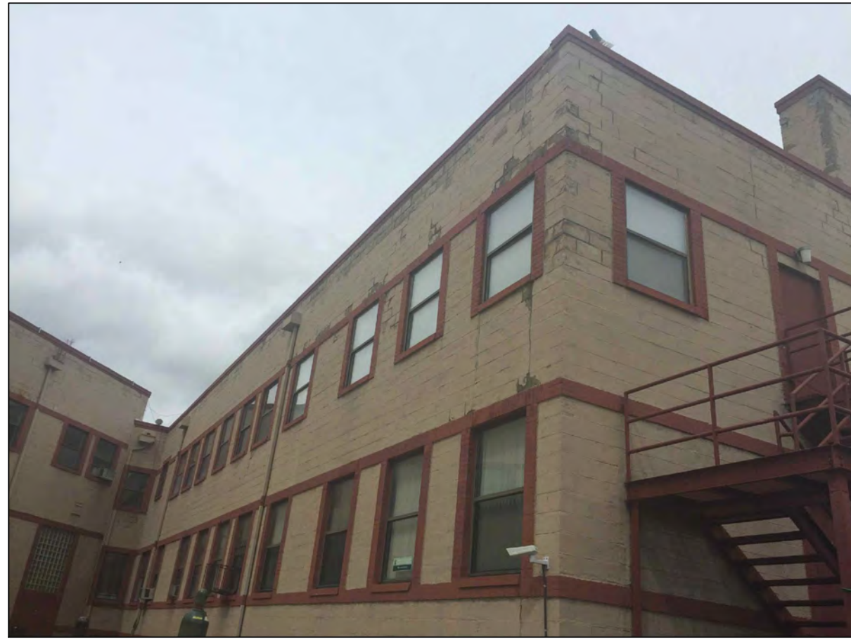
EXTERIOR EXTERIOR PHOTO "B"