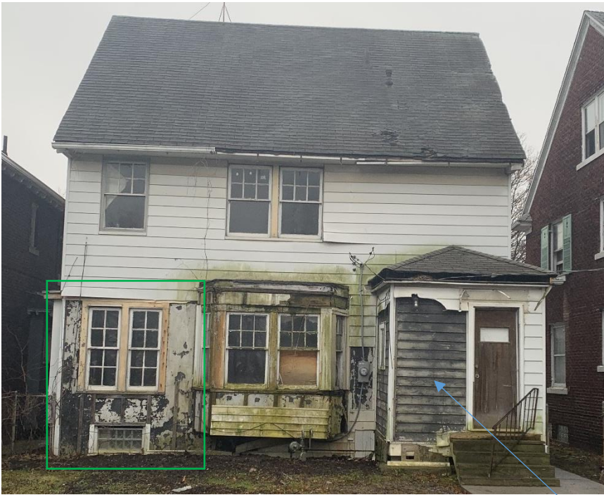
Rear, photo taken in 2020 by previous applicant. Note apparent fire damage at first story. The area outlined in green shows original stucco finish at first story. Also, note that the fire has exposed the historic lapped wood siding at the hipped roof wing