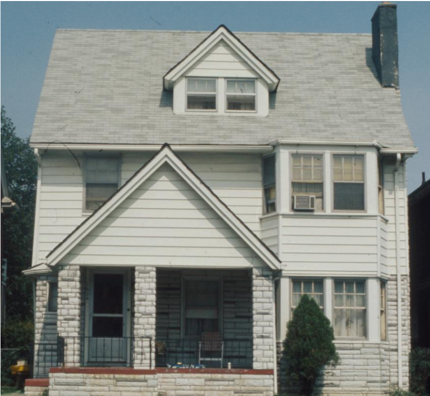
Designation slide, taken in 1974.

The chimney, porch deck and columns were also clad with non-historic Permastone. However, note that the original 6/1 wood windows remained, and the roof's original wood fascia/soffits were present despite the presence of the non-historic siding.