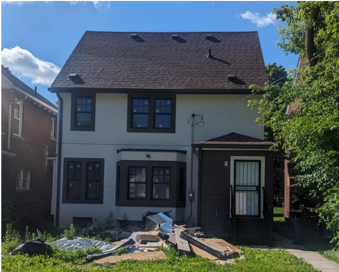
Current condition at rear.