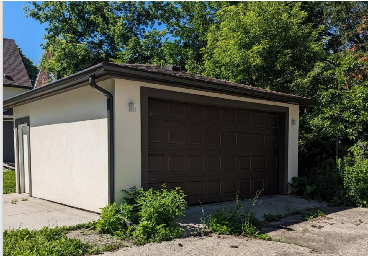
Current condition of garage.