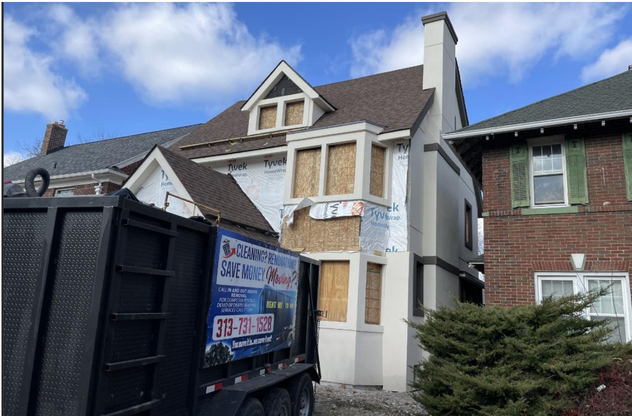
Front façade. Photo taken by HDC staff on 3/21/2024