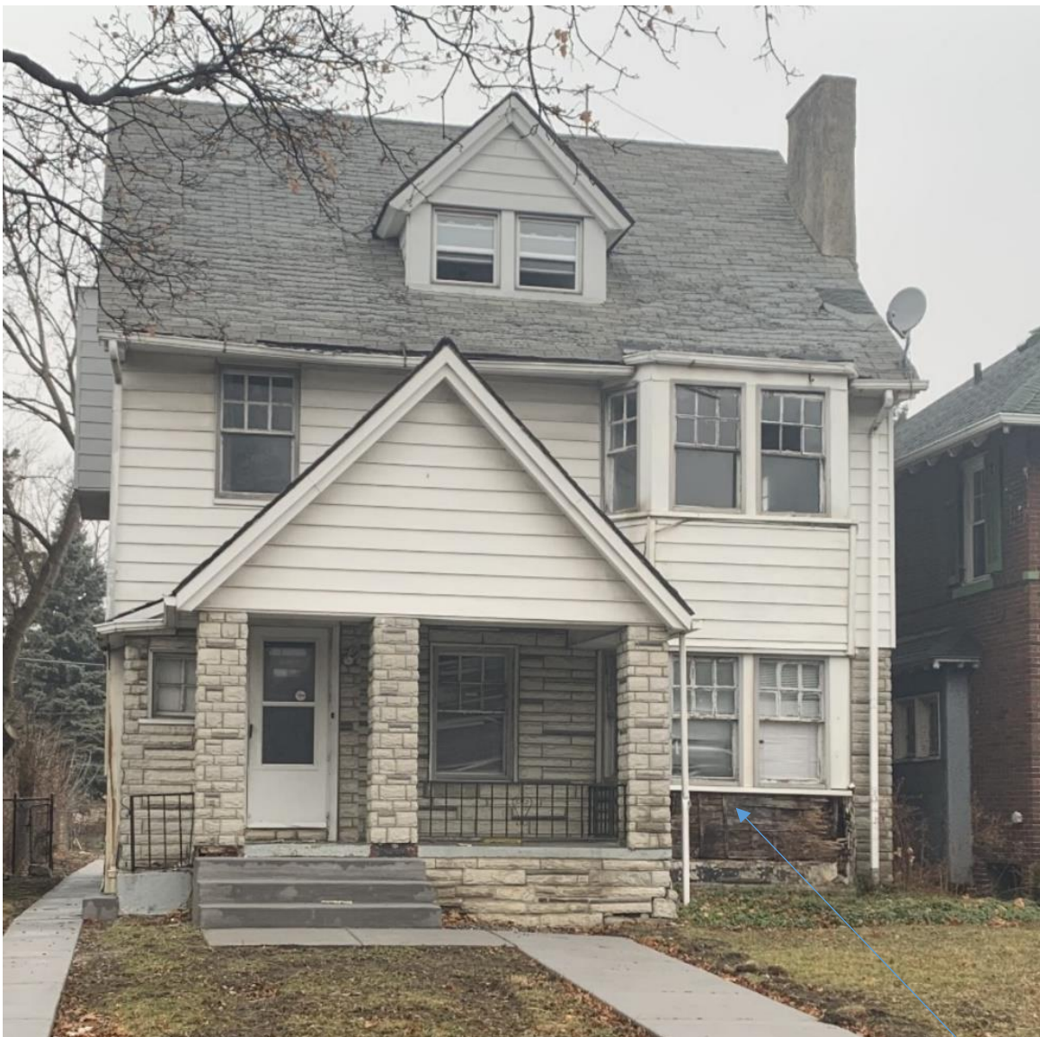
Front façade, 2020 photo taken by previous applicant. Note area where Permastone has fallen off