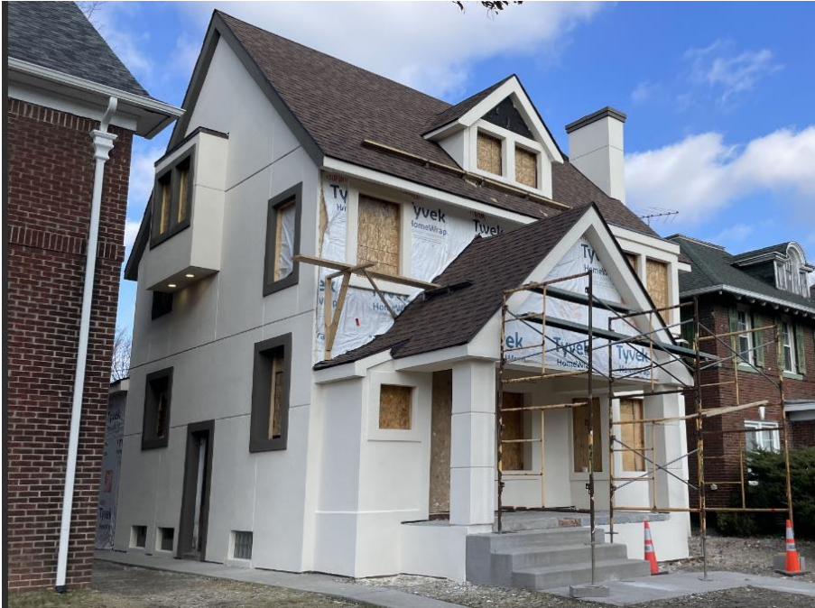
taken on 12/12/2023