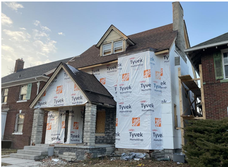
Conditions on 1/24/2023.