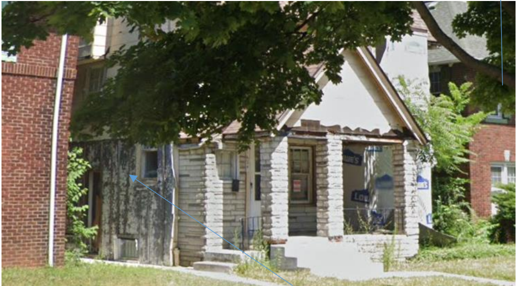
Conditions in 2020, per Google Streetview. Note where PermaStone has been removed to reveal original stucco finish at first story