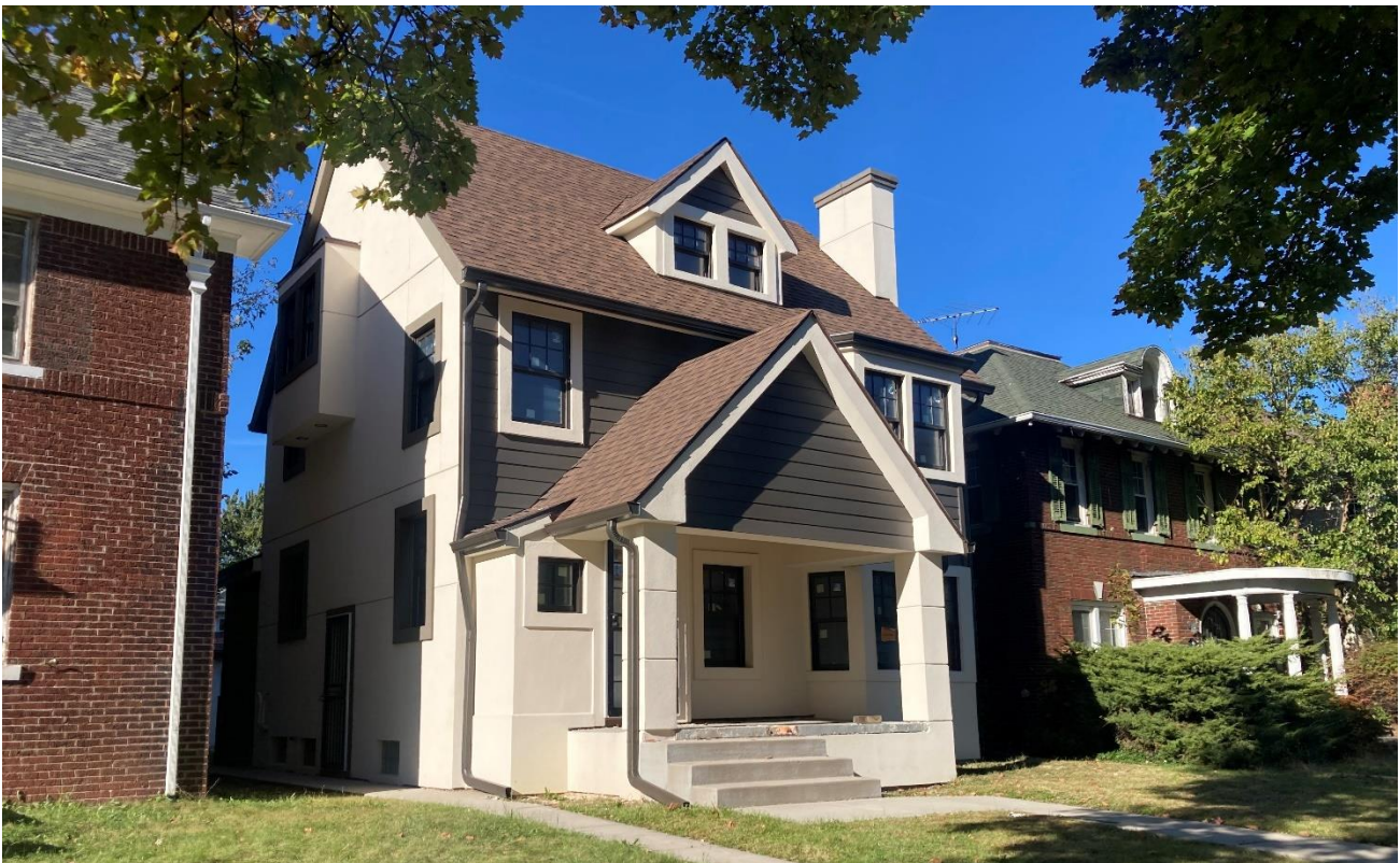
Current condition. Staff photo taken 10/16/2024

The property also includes a detached garage in the rear yard which was erected ca. 2018. The garage has a hipped roof with is covered with asphalt shingles and exterior walls are clad with EIFS. Windows are vinyl units. A single steel overhead door is located at the building's front façade serves as the primary entrance.