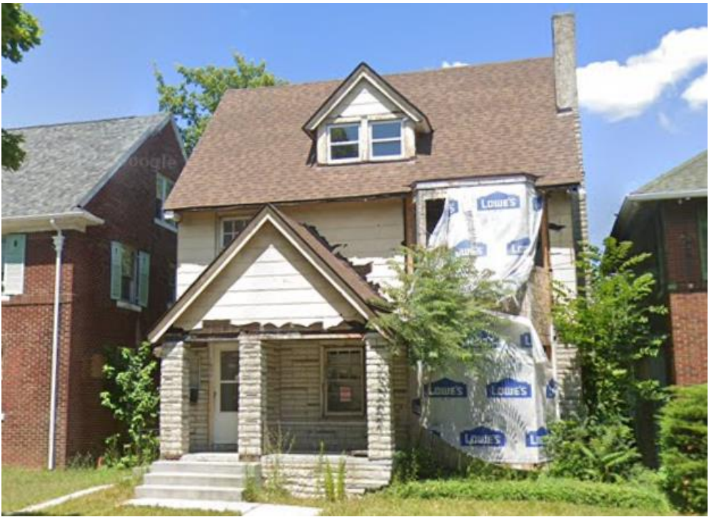
Conditions in 2020, per Google Streetview