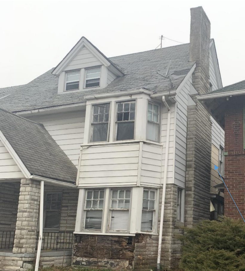
Photo taken in 2020 by previous applicant. Note area where aluminum siding has fallen off, revealing synthetic shingle siding underneath.