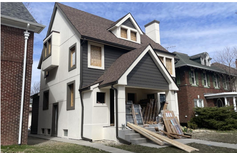
Front façade. Photo taken by HDC staff on 3/21/2024