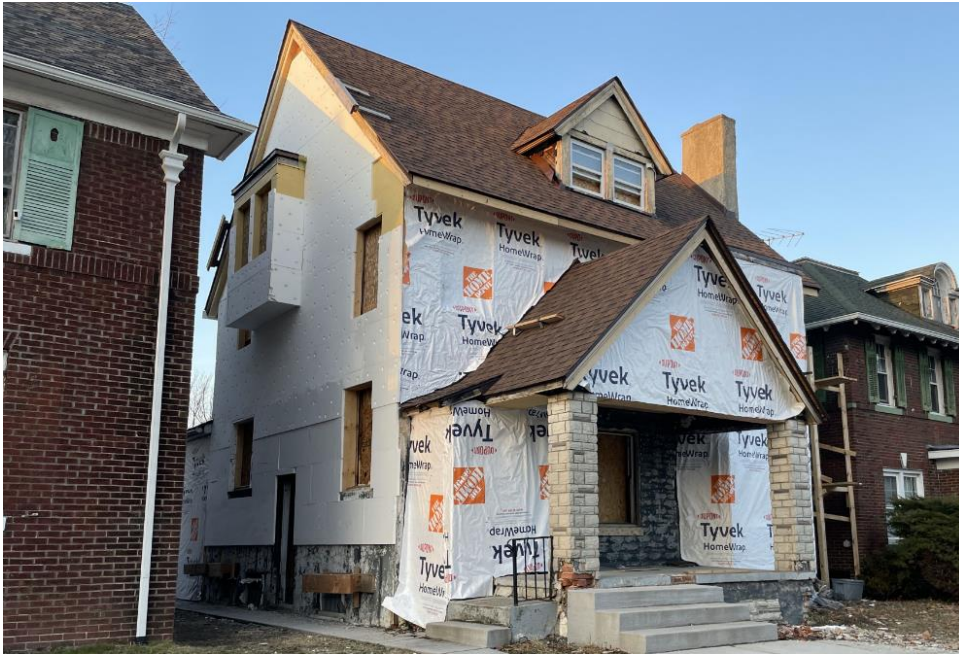
Conditions on 1/24/2023.

Staff therefore reported the work to the building department and requested that a stop work order be issued. The building department inspected the site in response to HDC staff request. The following photos illustrate conditions at that time: